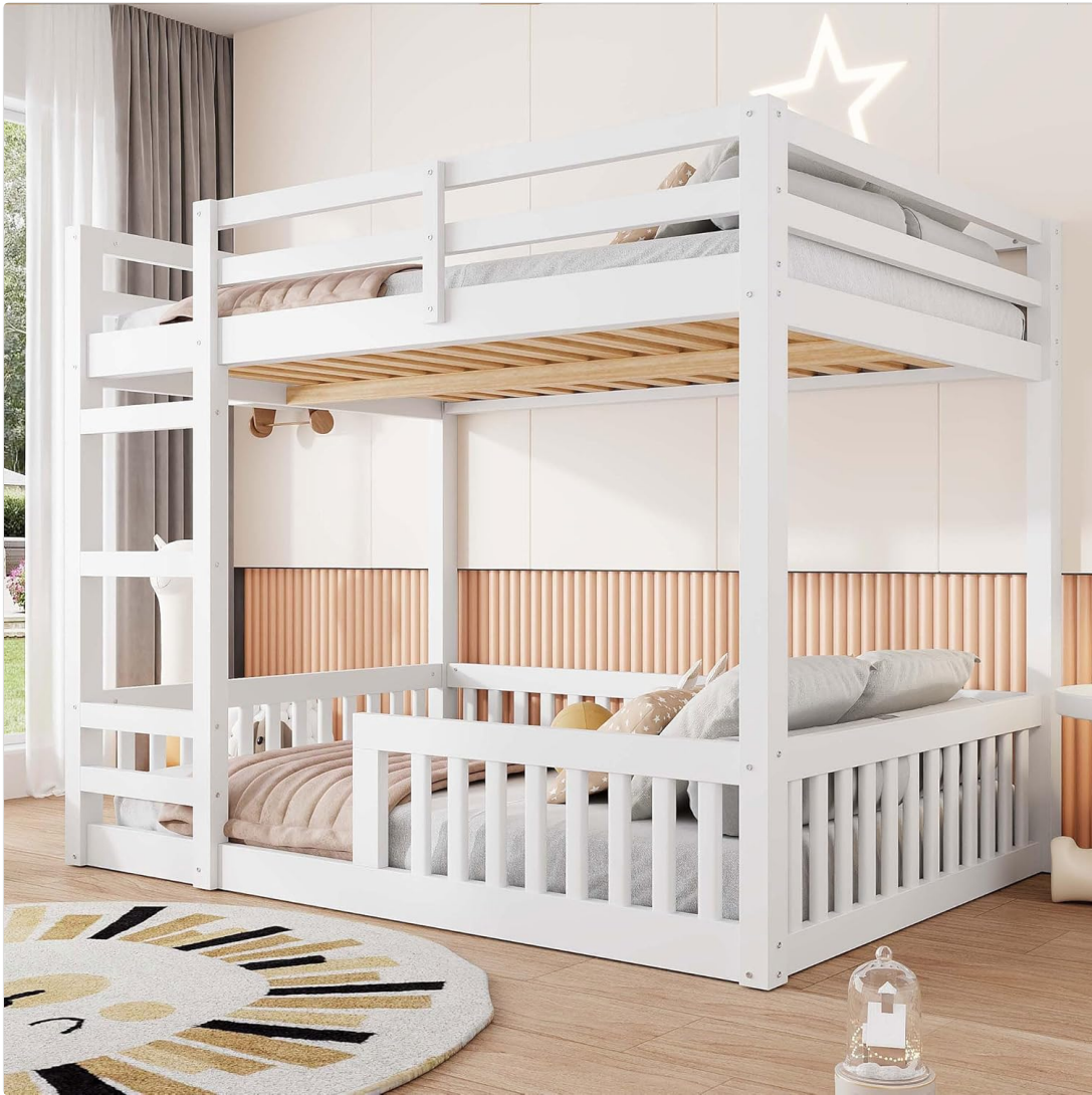
Image Description: A fully assembled Bellemave Full Over Full Bunk Bed in a pure white finish, featuring a ladder on the left side and guardrails on both the upper and lower bunks. The bed is shown in a child's room setting.

Securely attach the full-length guardrails to the upper bunk frame. Install the angled ladder to the designated side of the bunk bed, ensuring it is firmly attached and stable for climbing.