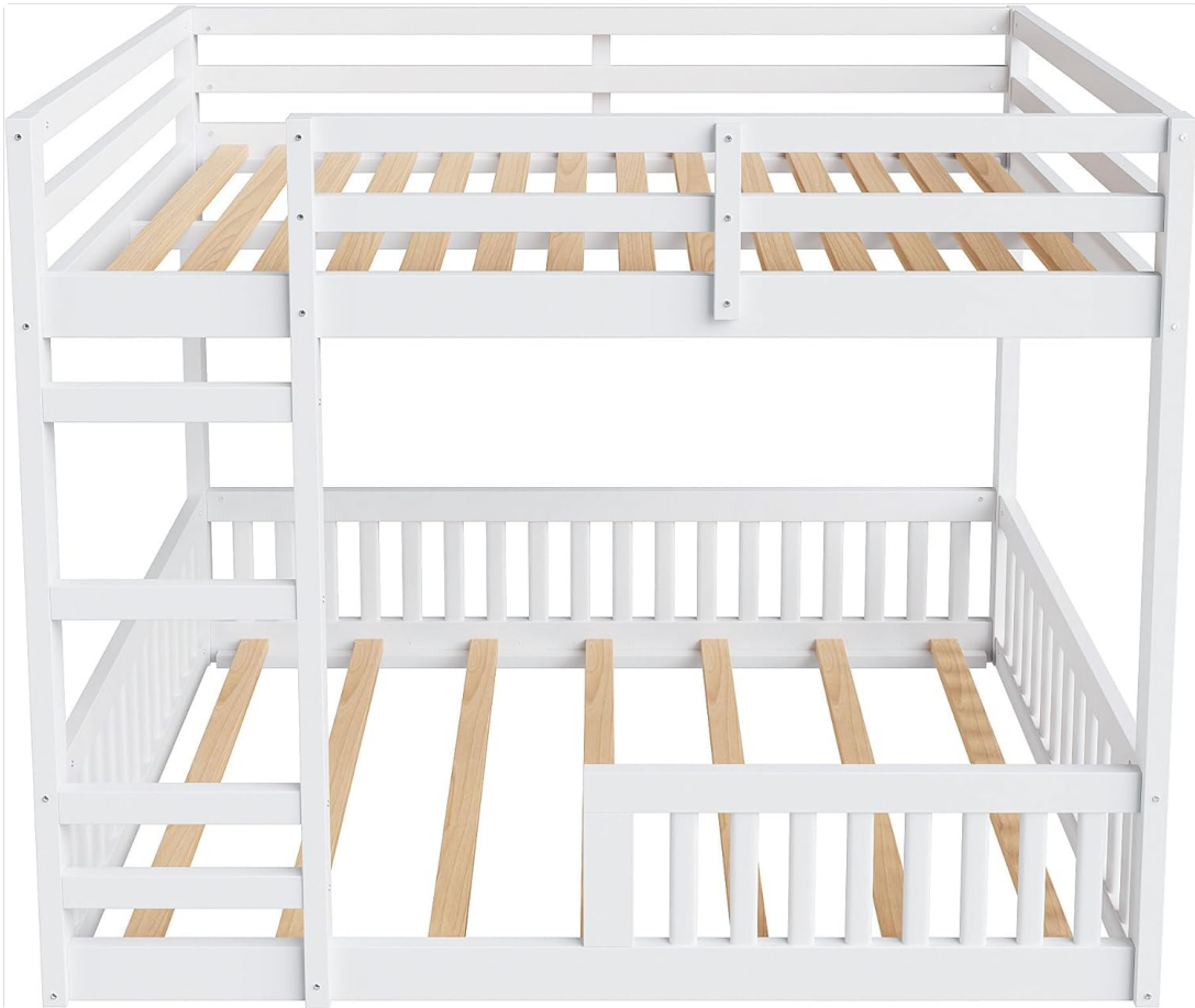
Image Description: A detailed view of the bunk bed frame showing the wooden slats laid across the bed base, ready to support a mattress. The slats are evenly spaced and secured.