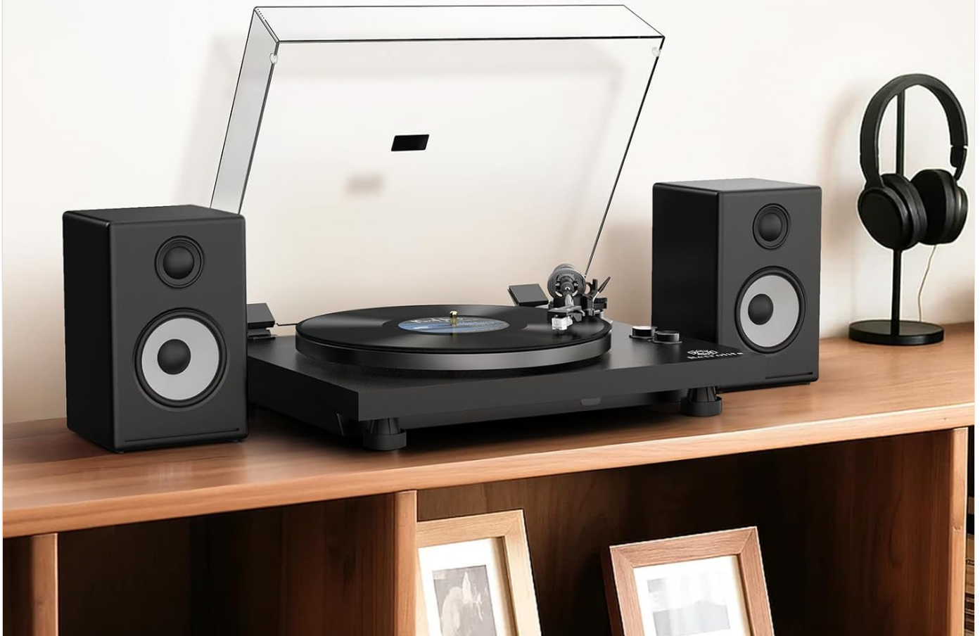
Retrolife turntable connected to external powered speakers via RCA output.