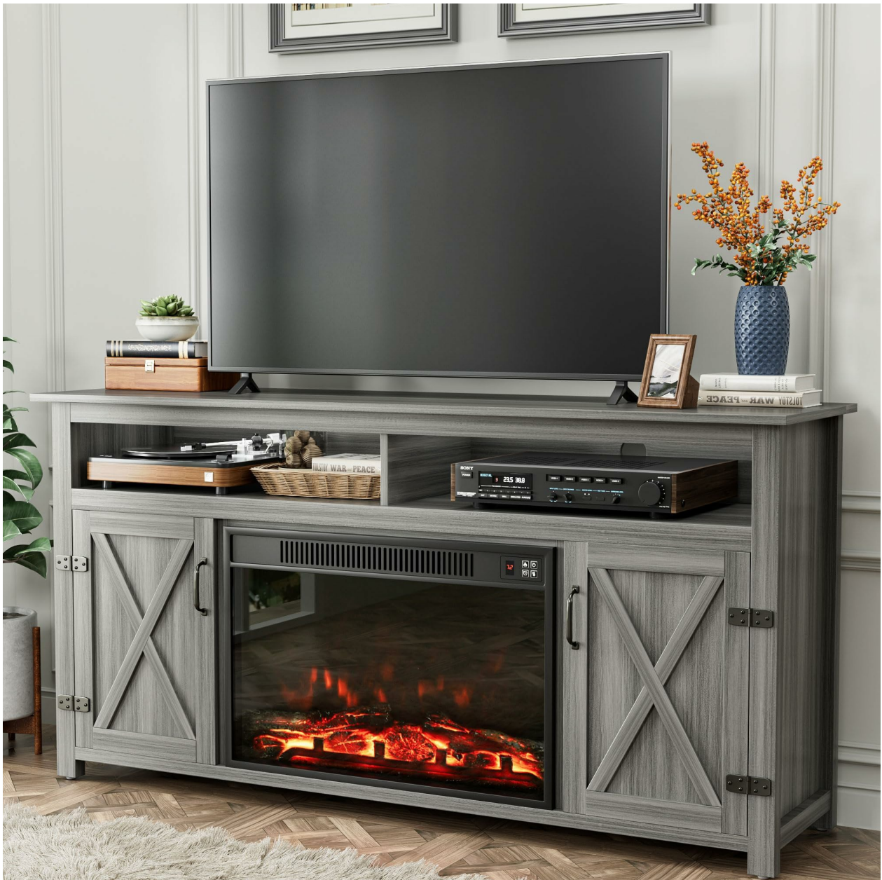
Figure 1: Assembled Fireplace TV Stand