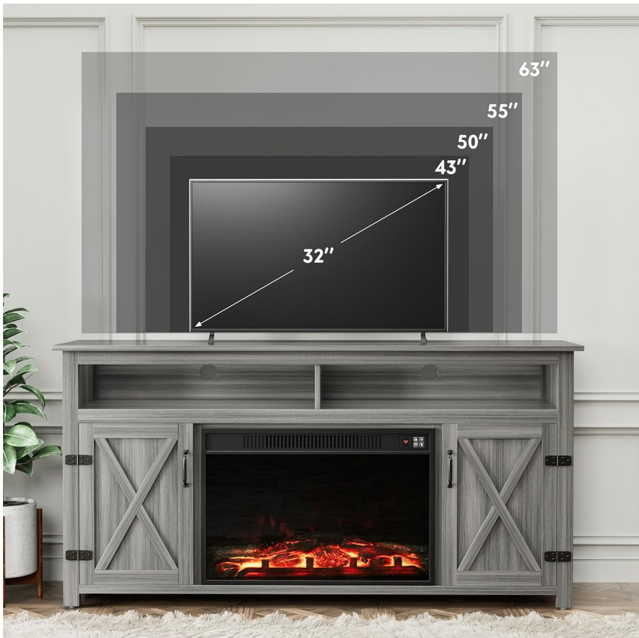
Figure 7: TV Size Compatibility