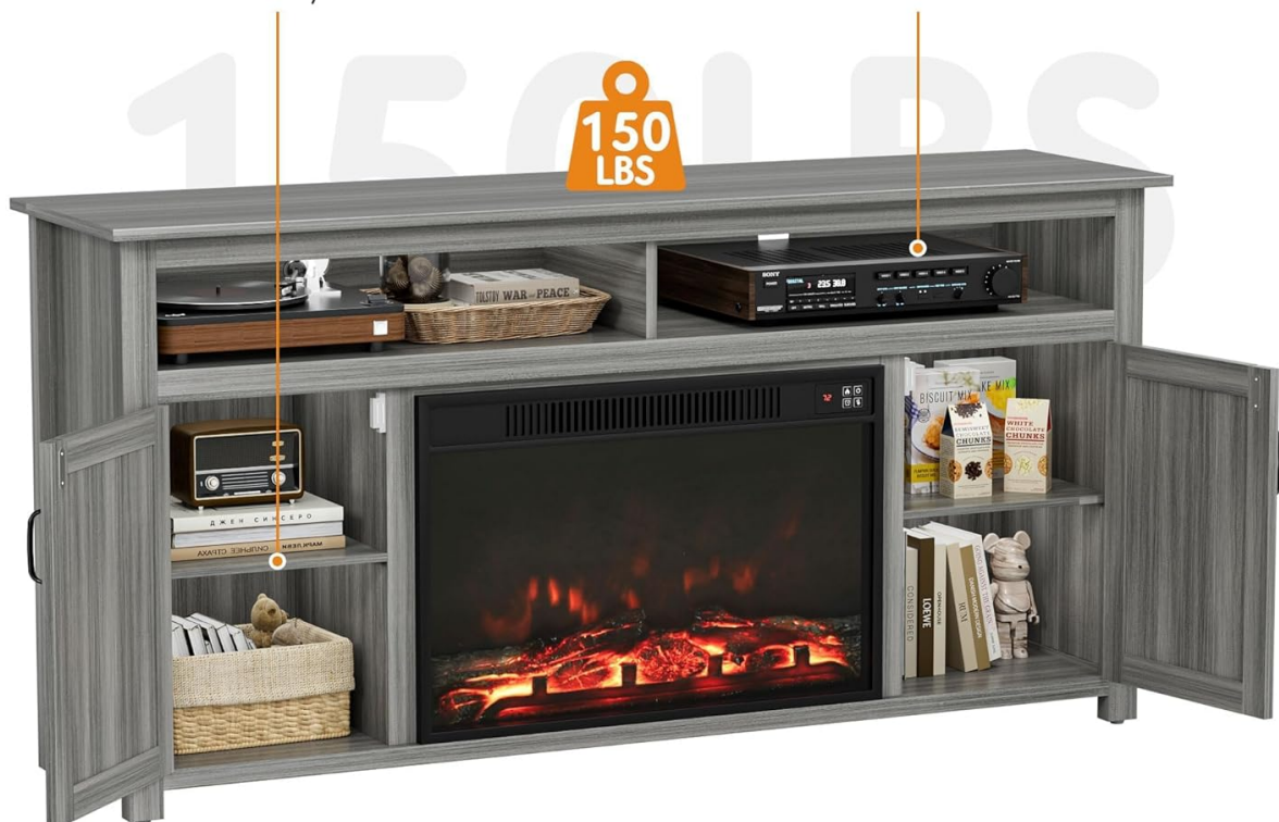
Figure 3: Internal Storage and Structure

For media equipment storage & arts display