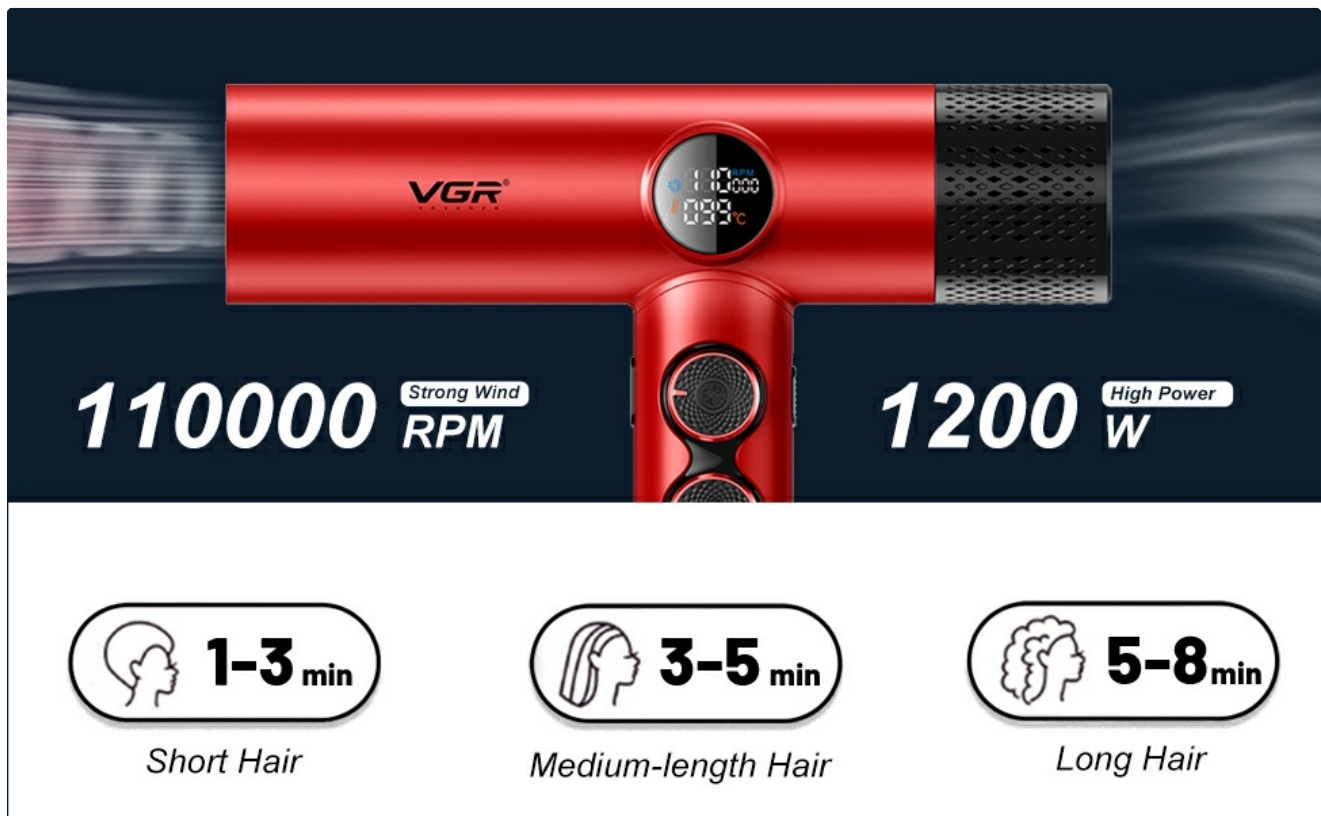
Figure 11: Hair dryer performance and estimated drying times.