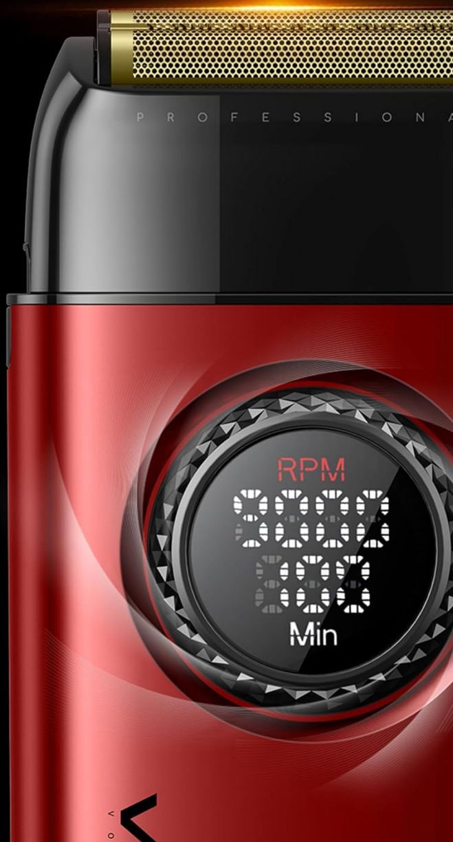
Figure 5: The VGR foil shaver with titanium coating foils and its digital display.