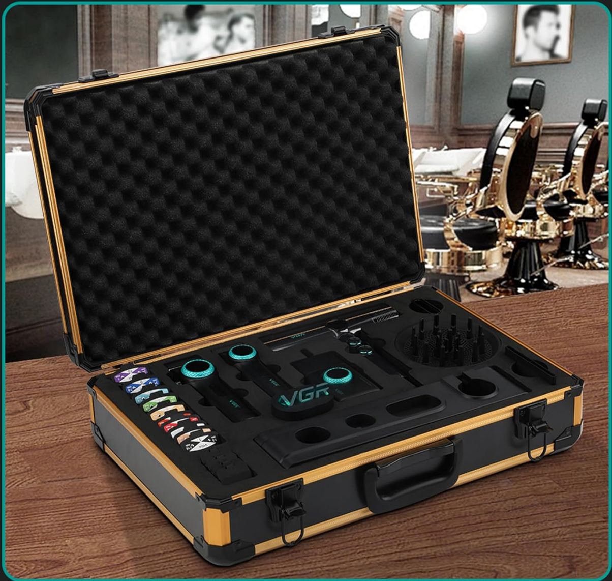
Figure 3: The durable travel case designed for organized storage and portability of the grooming kit.