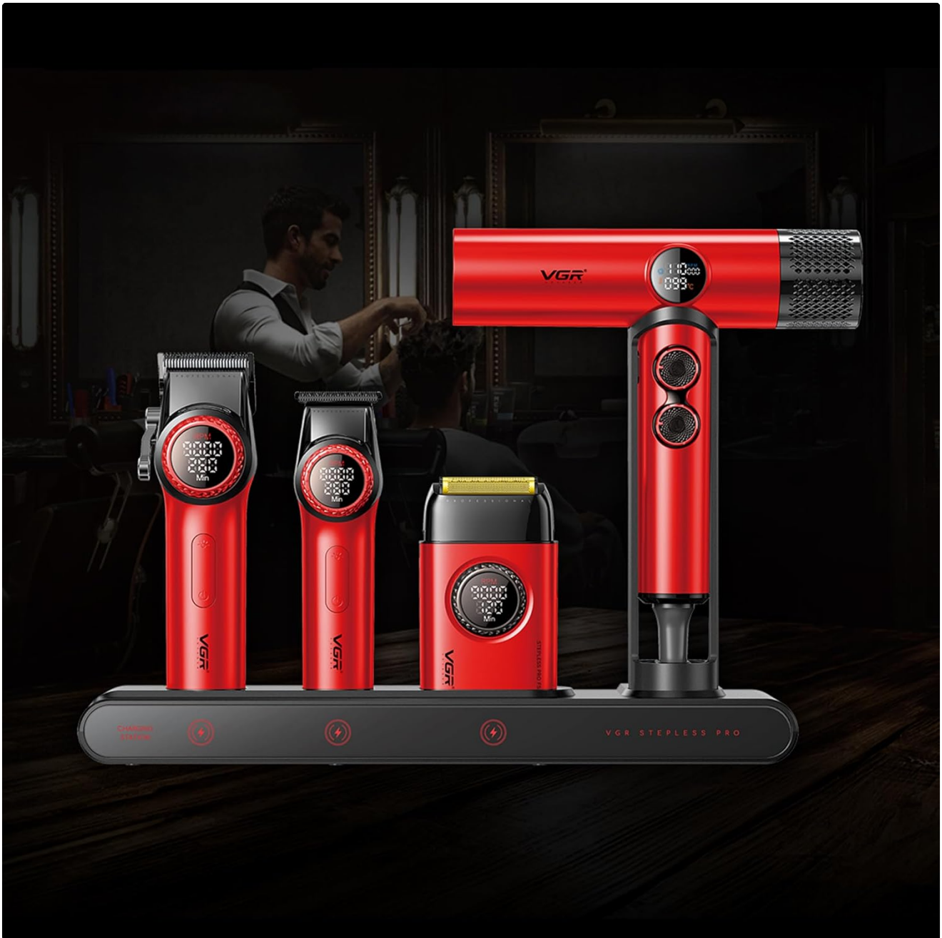
Figure 7: The VGR grooming tools correctly placed on the charging station.