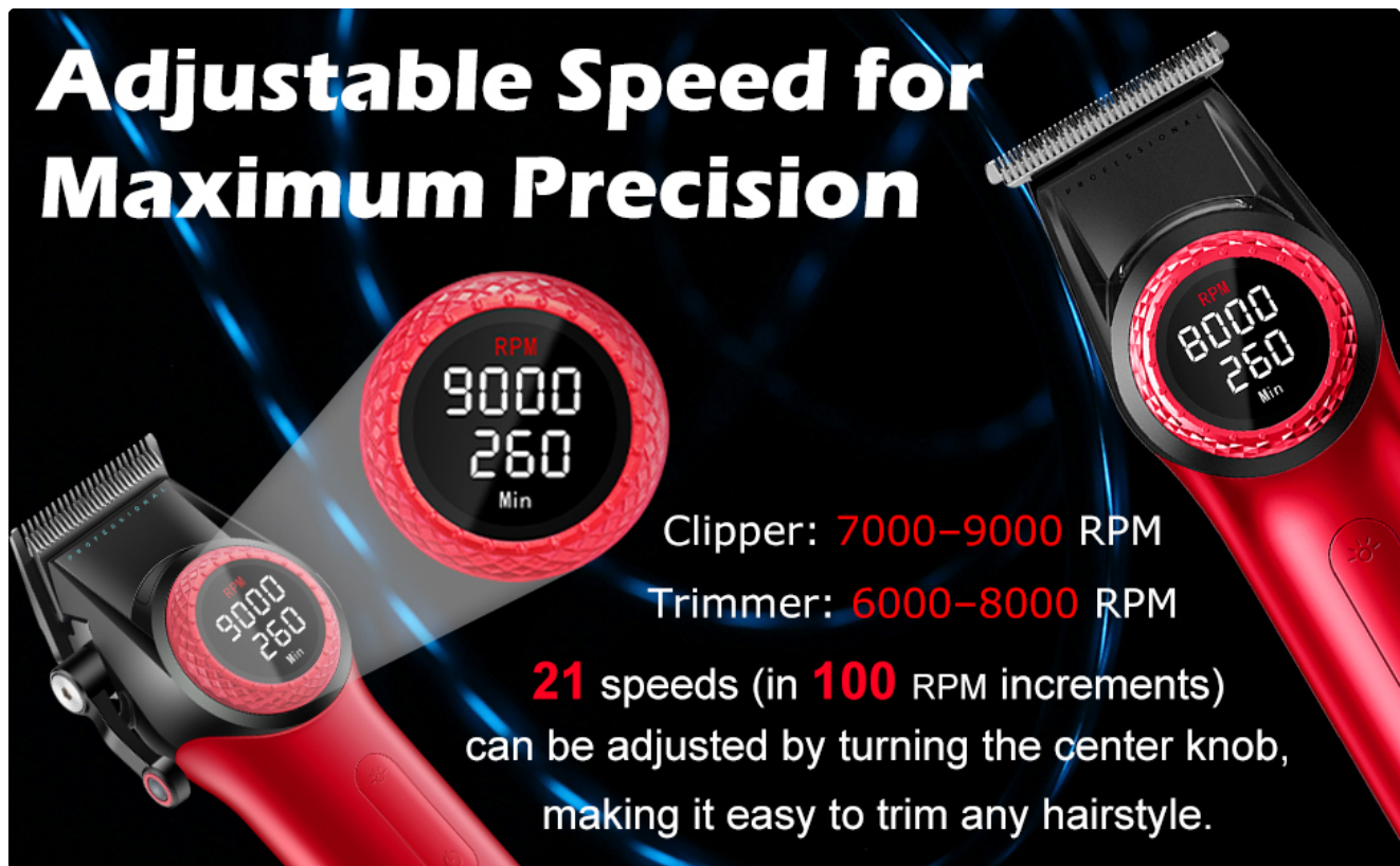
Figure 9: Adjustable speed settings for the hair clipper and trimmer.