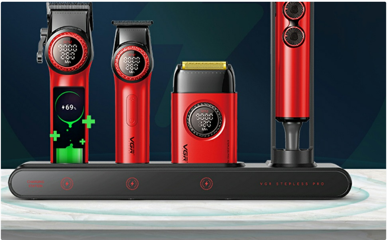
Figure 8: The multi-device charging station with tools indicating charging status.