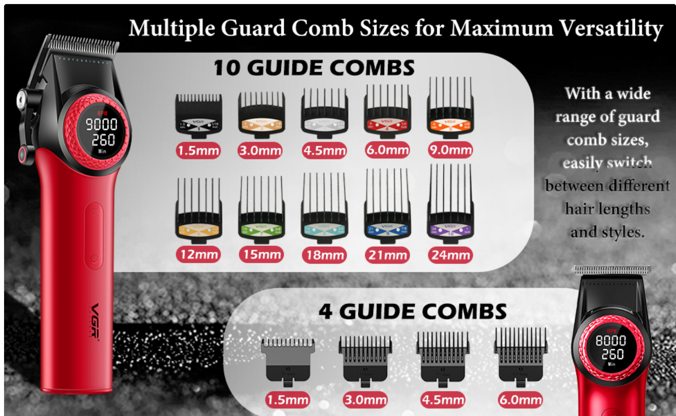
Figure 10: Multiple guide comb sizes for versatile styling with the clipper and trimmer.