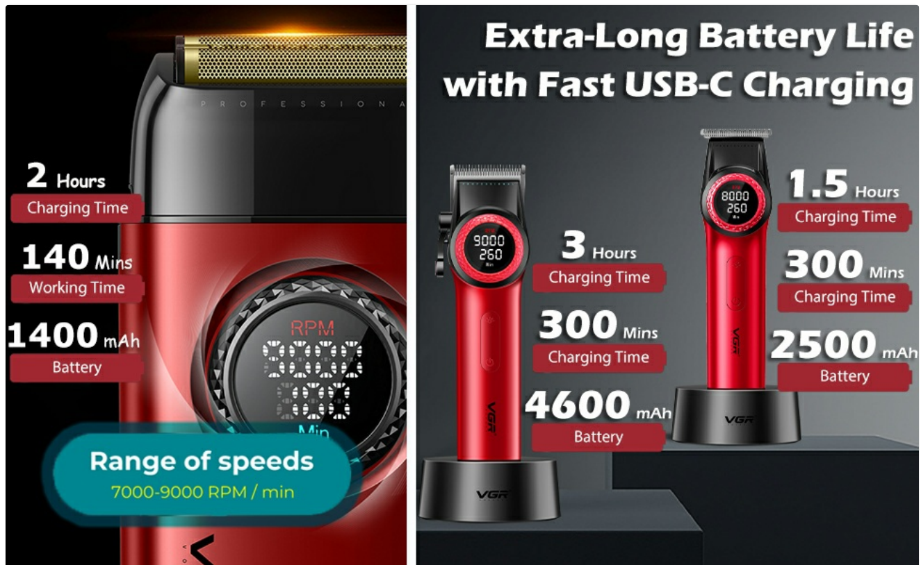
Figure 12: Battery life and charging specifications for the cordless tools.