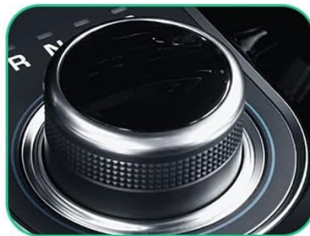
OEM Knob Control