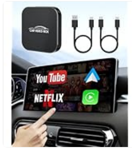
Image: A close-up of the adapter with a TF card inserted, illustrating the offline media playback capability. Also shows screen mirroring from a phone to the car display.