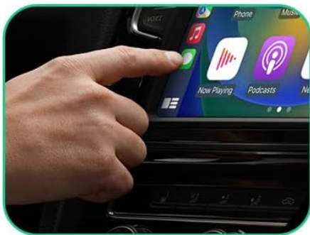
Touch Screen Control