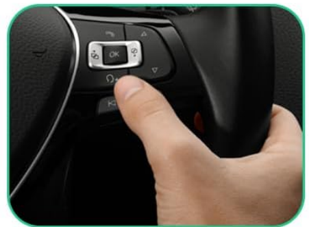
Steering Wheel Control

Image: A driver interacting with the car's infotainment system using voice commands, alongside illustrations of touch screen, OEM knob, and steering wheel controls.