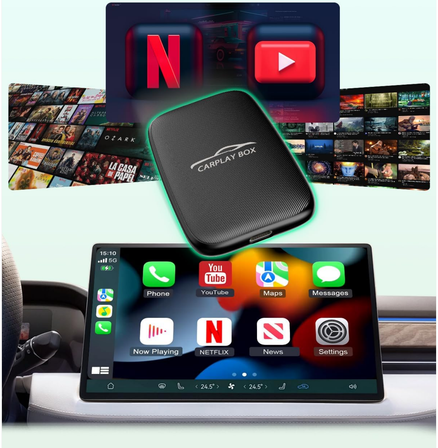
Image: A car's infotainment screen displaying the Netflix and YouTube application icons, indicating their availability through the adapter.