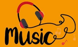
Figure 5.1: Practice silently using headphones.

Enjoy immersive drumming with our electronic drums' headphone mode without waking the neighbors