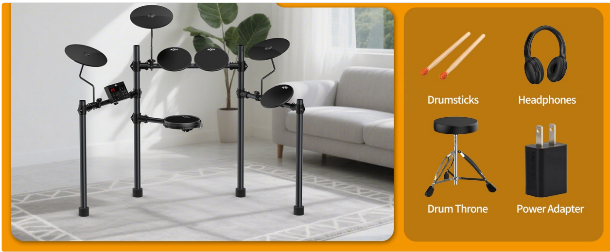
Figure 2.1: Included components of the AiJoy ADD15 Electric Drum Set.