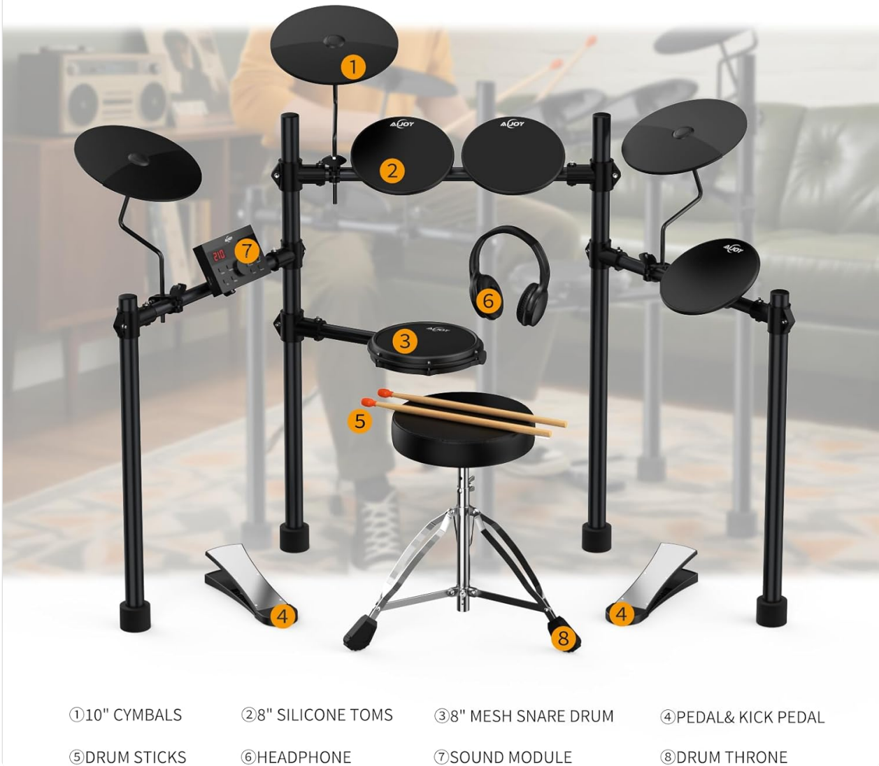
Figure 3.1: Labeled components of the assembled drum set.