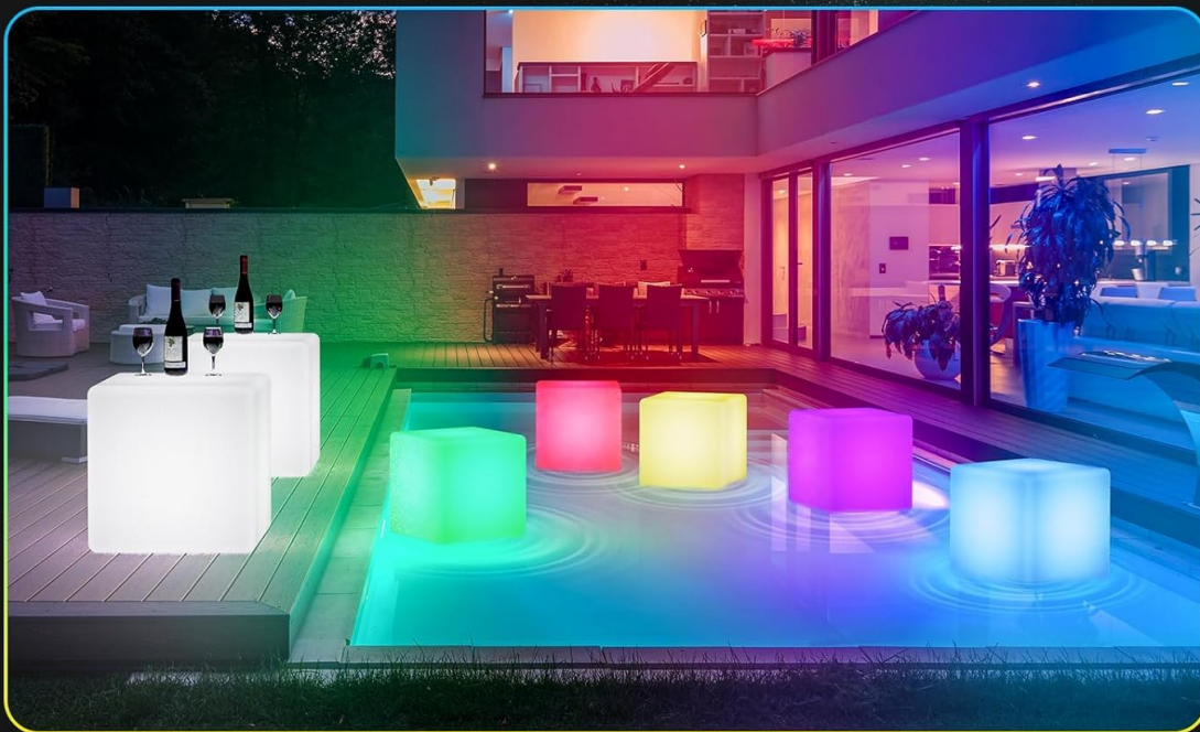
Image: Illustration of the IP65 waterproof rating, showing the LED cube light submerged in water and multiple lights floating in a swimming pool, highlighting their suitability for outdoor and pool environments.

The LOFTEK LED lights are rated IP65 waterproof, making them suitable for outdoor use and floating in pools. Ensure the charging port cover is tightly sealed before any water exposure.