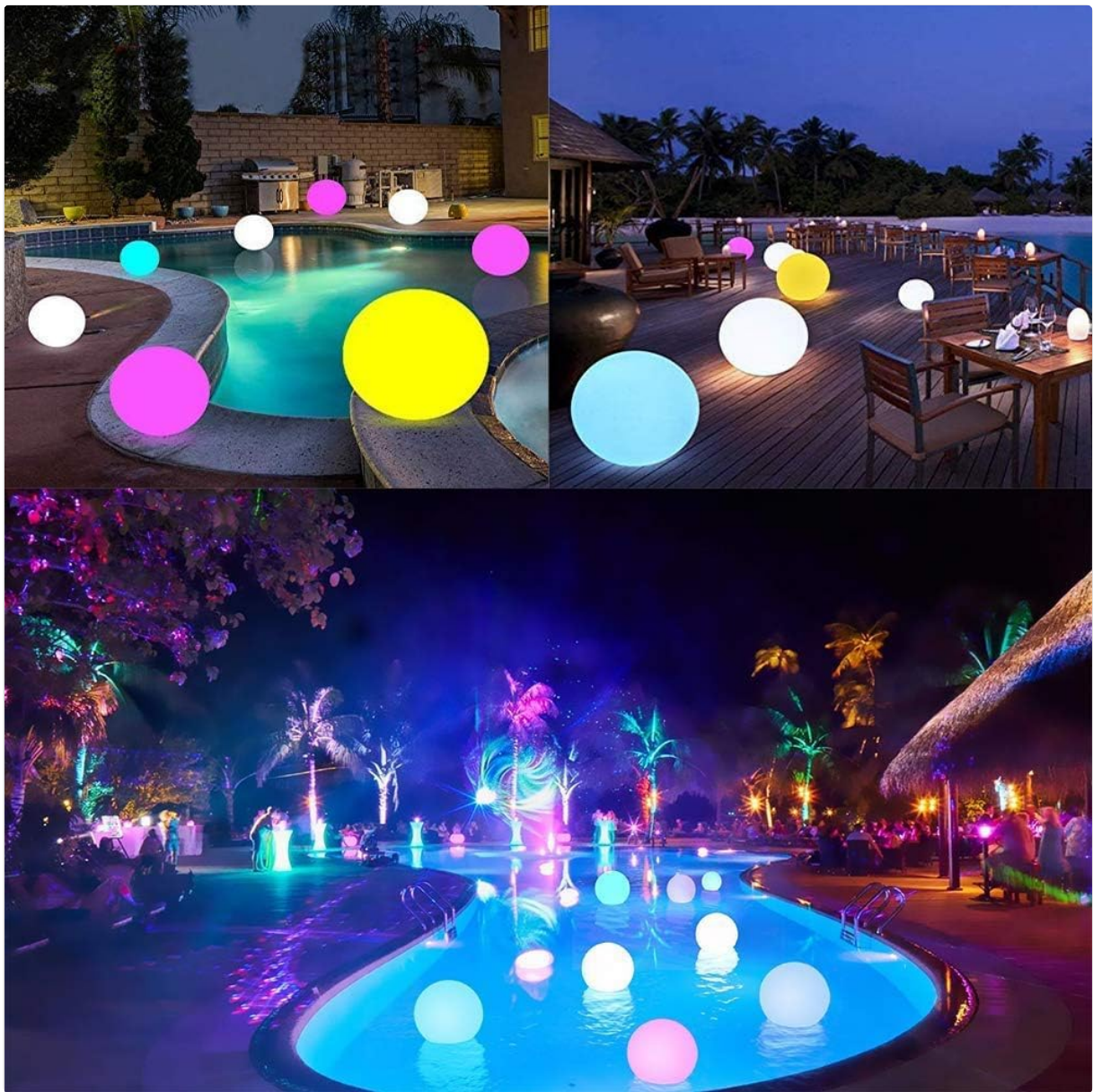
Image: Various LOFTEK LED light balls illuminating a swimming pool and surrounding deck area during the evening, showcasing their decorative and functional use in outdoor settings.