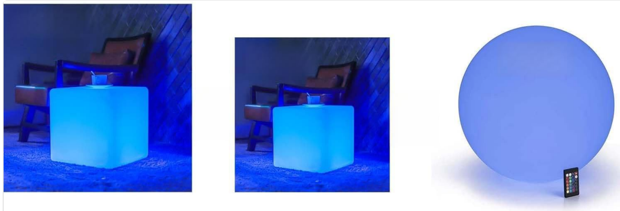
Image: A LOFTEK 20-inch LED cube light glowing in a vibrant blue color, showcasing its primary function as an illuminated decorative piece.

These products are designed to provide versatile, colorful lighting for various indoor and outdoor settings, featuring RGB color changing capabilities, remote control operation, and a waterproof design.