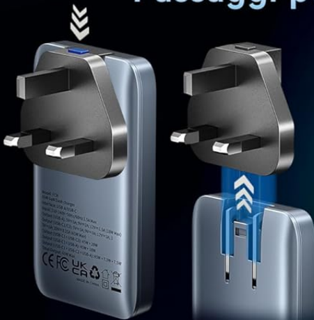
1. Premere il pulsante sulla parte superiore della spina