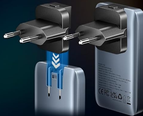
2. Allineare con la fessura e premere delicatamente

The VENTION 65W GaN charger is significantly more compact than traditional chargers, making it highly portable.