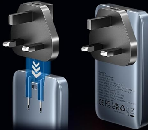
2. Allineare con la fessura e premere delicatamente