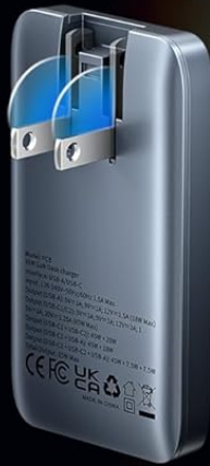
1. Piegare la spina US originale