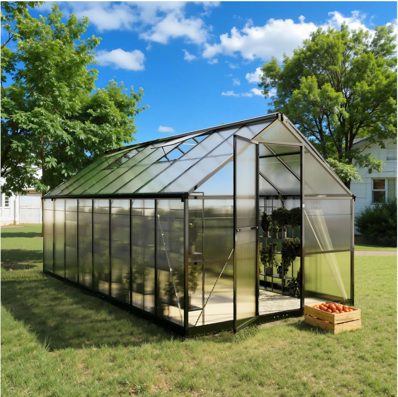
Figure 1: The EASYHAWK 8x16 FT Polycarbonate Greenhouse installed in a backyard.