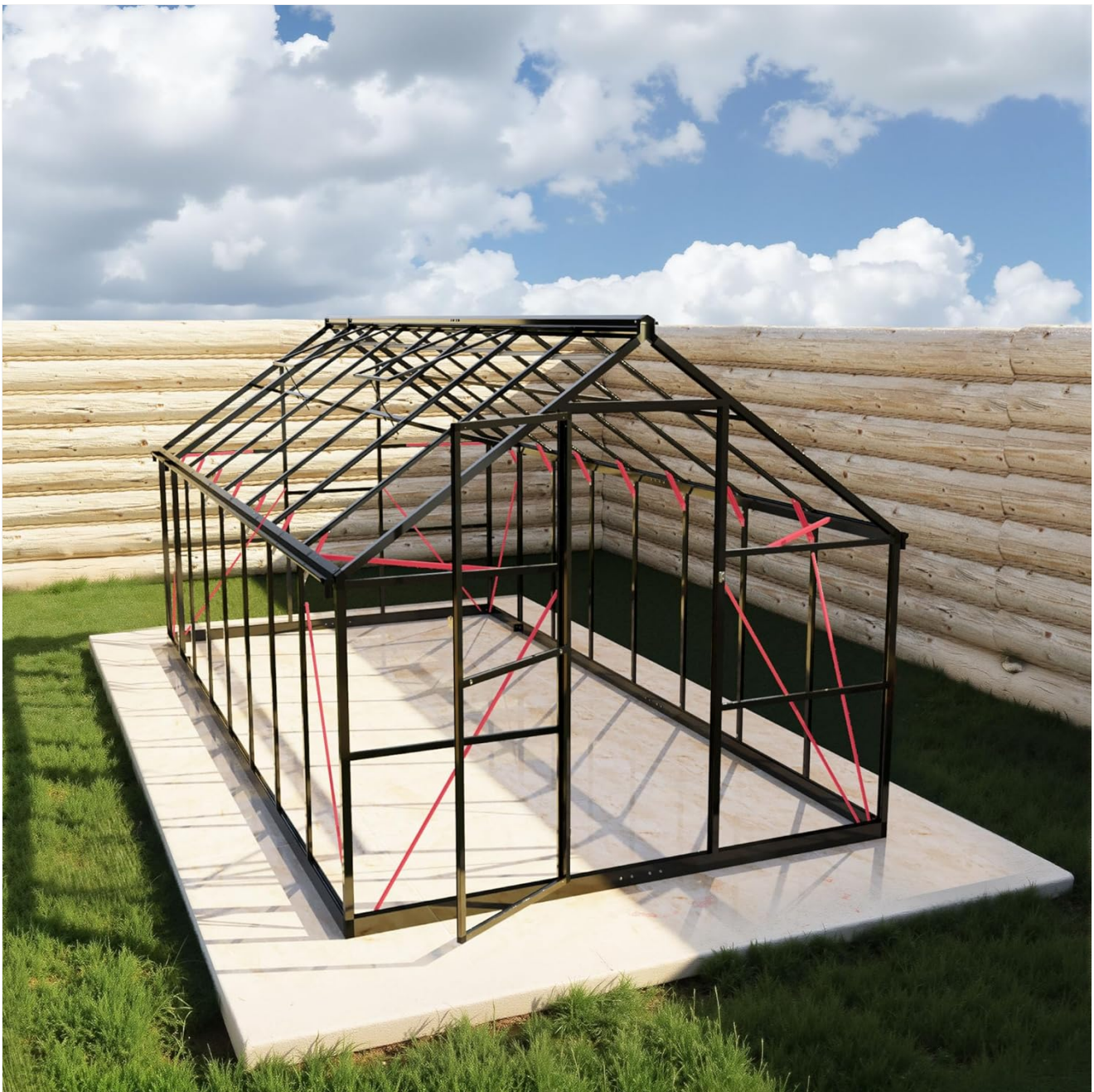
Figure 3: Illustration of the quick-fit assembly for panels.