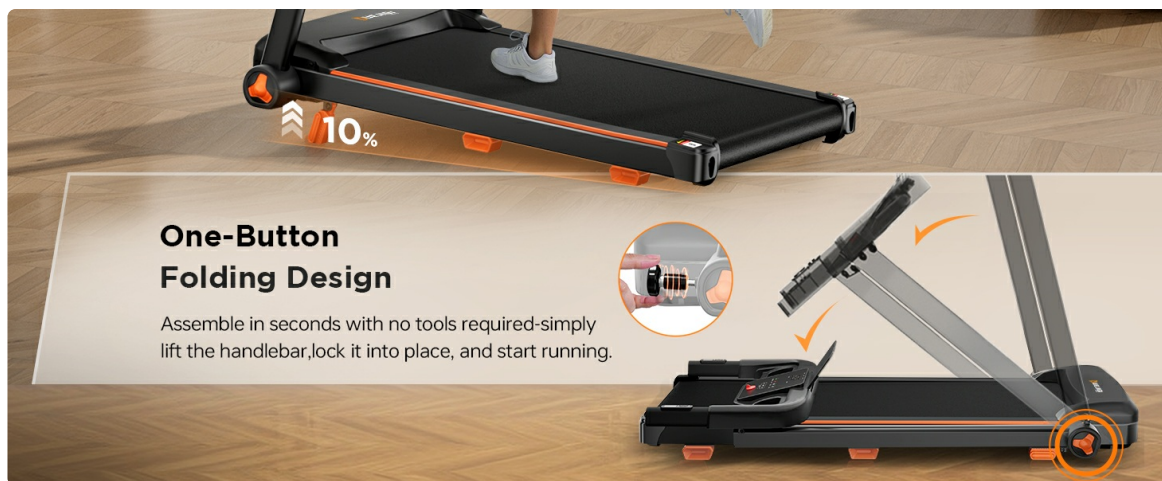
Figure 3.1: Illustration of the one-button folding design, showing the handlebar being lifted and locked into place.