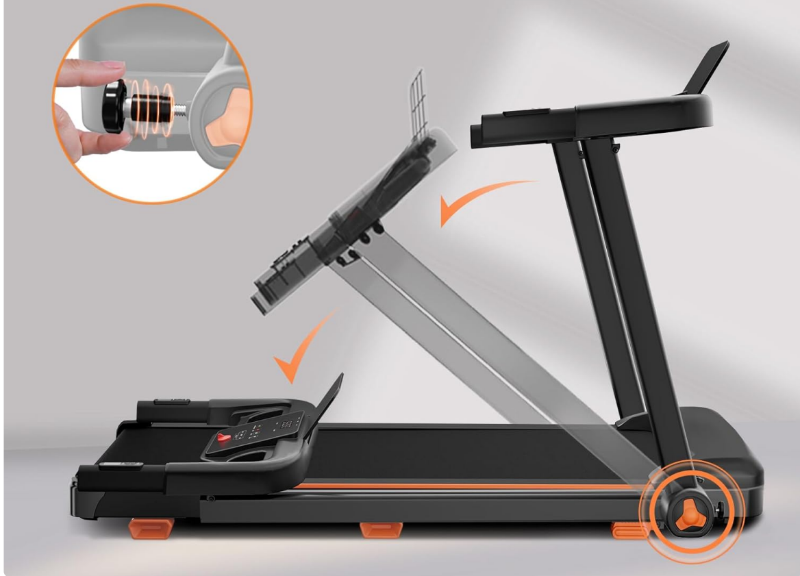
Figure 2.1: Overview of the Yuejiqi 3220 Foldable Treadmill.

Assemble in seconds with no tools required—simply lift the handlebar, lock it into place, and start running.