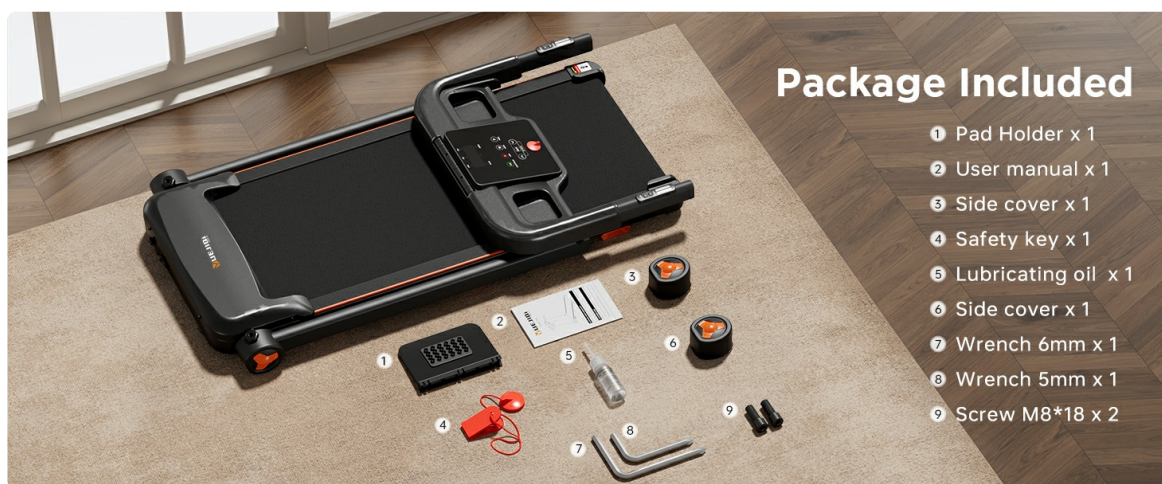
Figure 3.2: All components included in the package for assembly.