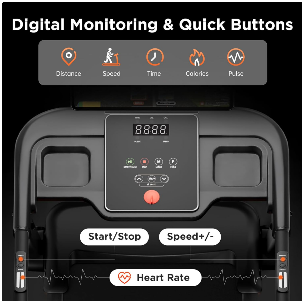
Figure 4.1: The control console displaying time, distance, calories, pulse, and speed, with quick access buttons.

Video 4.1: Demonstration of the 3220 treadmill in use, showing basic operation.