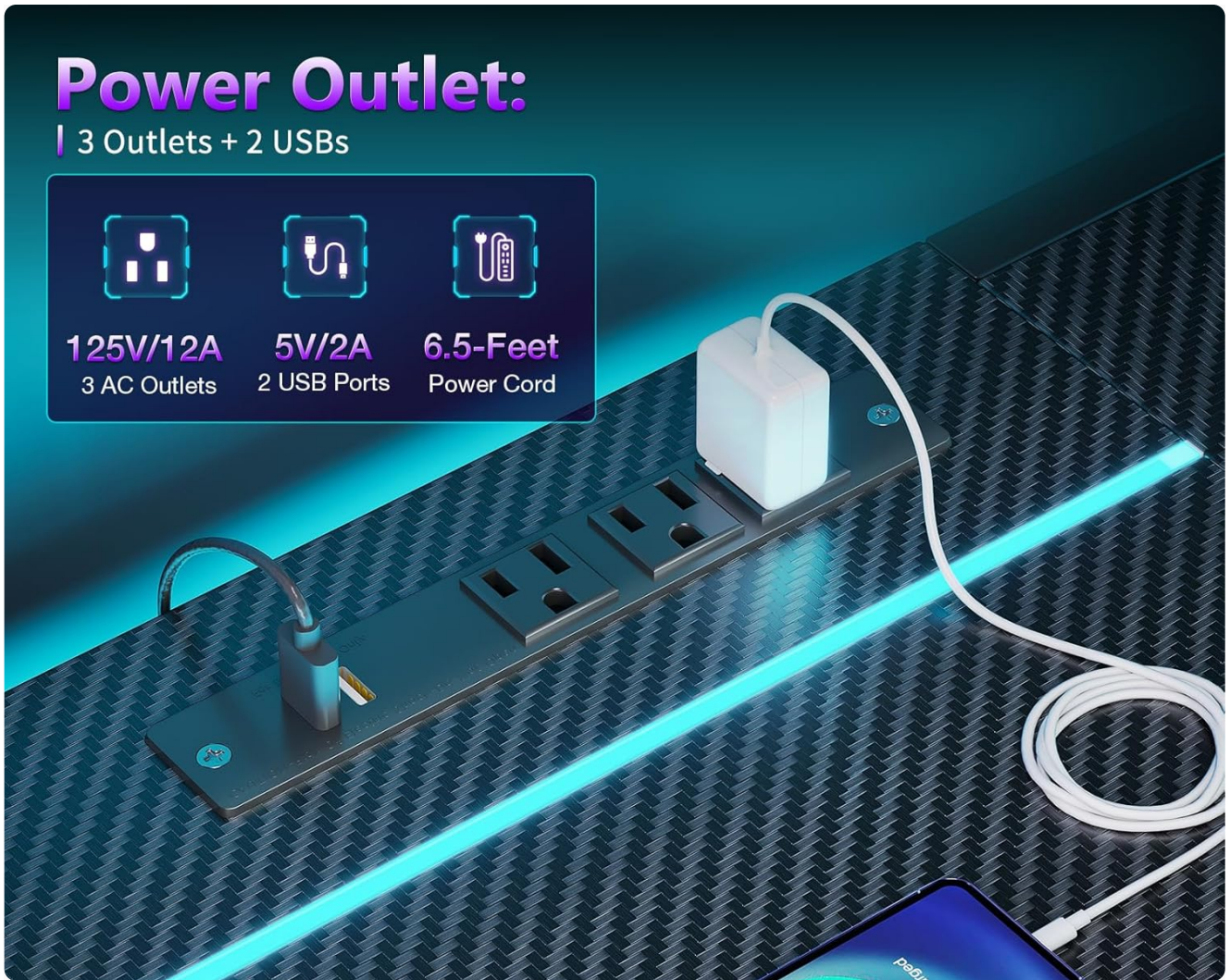
Image: A close-up view of the integrated power outlet on the desk, showing three AC outlets and two USB charging ports, with a device plugged in.