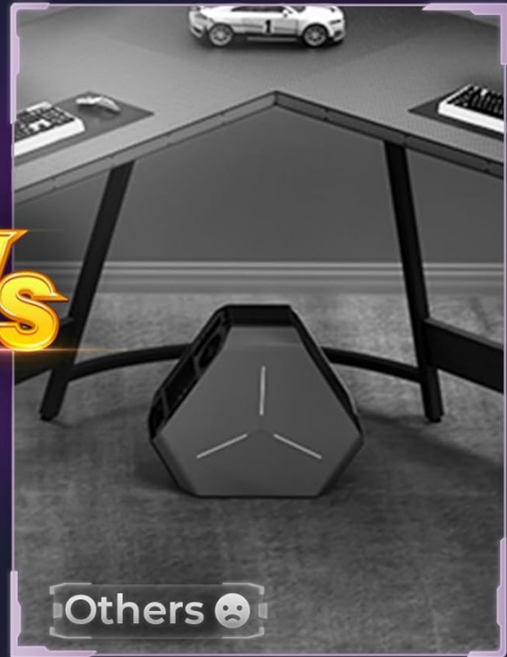
Image: A comparison showing the integrated desktop computer tower stand on the MOTPK desk versus a typical floor-standing CPU case, highlighting the space-saving and display benefits.