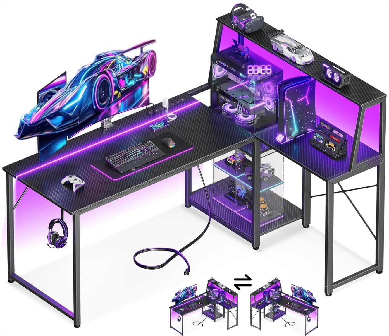
Image: An overview of the MOTPK L Shaped Gaming Desk, showcasing its design with integrated LED lighting, power outlet, and storage features. The image also illustrates the reversible configuration option.