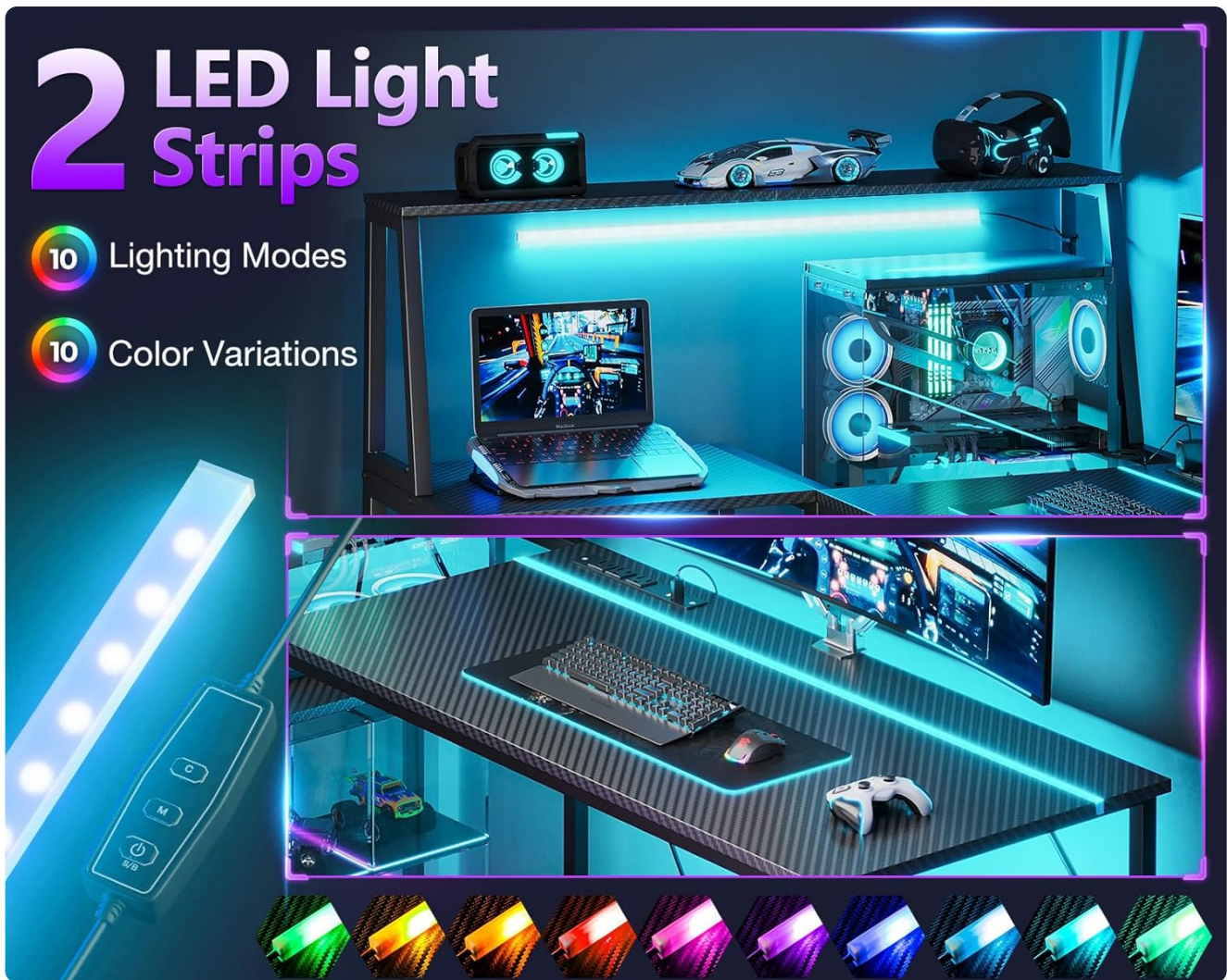
Image: A visual representation of the two LED light strips and their controller, demonstrating various color options and lighting modes available for the desk.