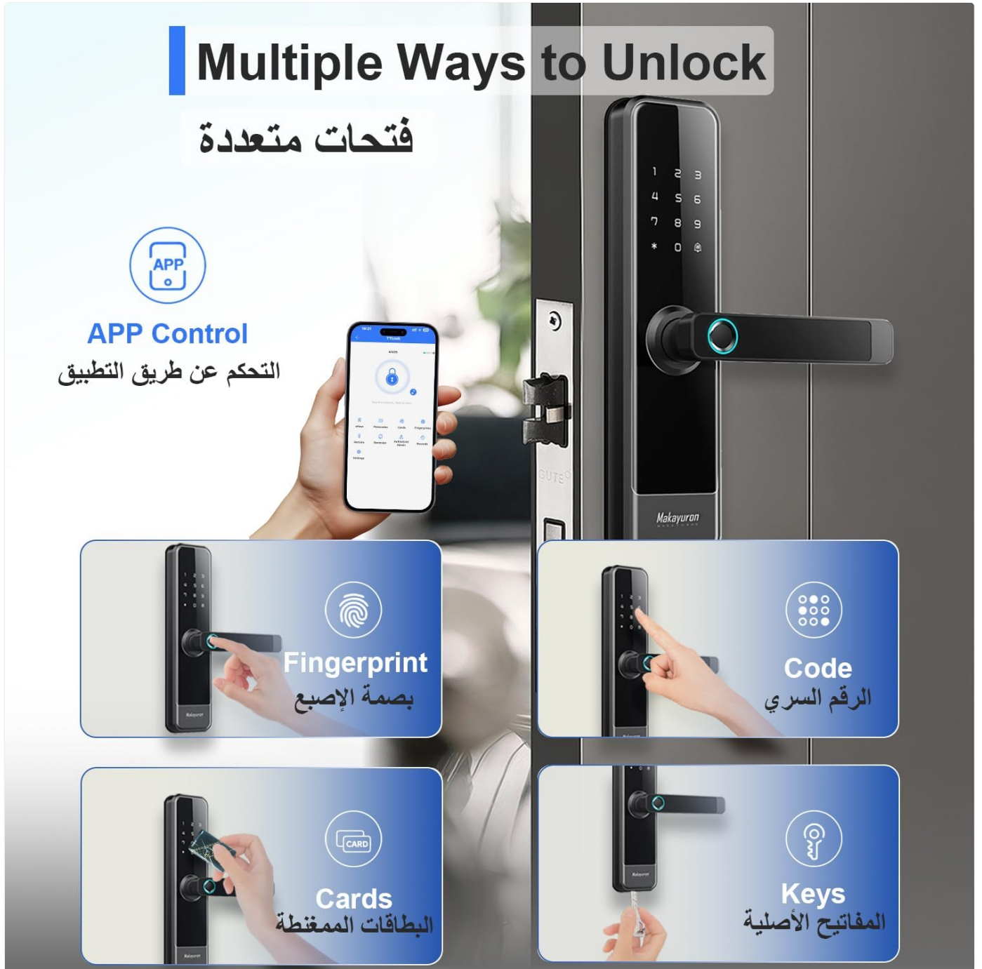
Figure 4.1: Multiple Ways to Unlock

The Makayuron Smart Door Lock M305TTBLE offers five convenient ways to unlock your door, ensuring flexible and secure access for various users and situations.