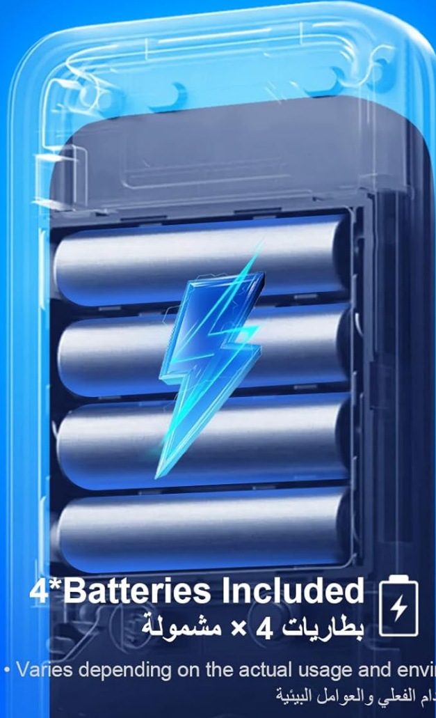
Figure 7.1: Long-lasting 8-month Battery

This image displays the internal battery compartment, confirming the use of 4 AA batteries and highlighting the extended battery life, which can vary based on usage.