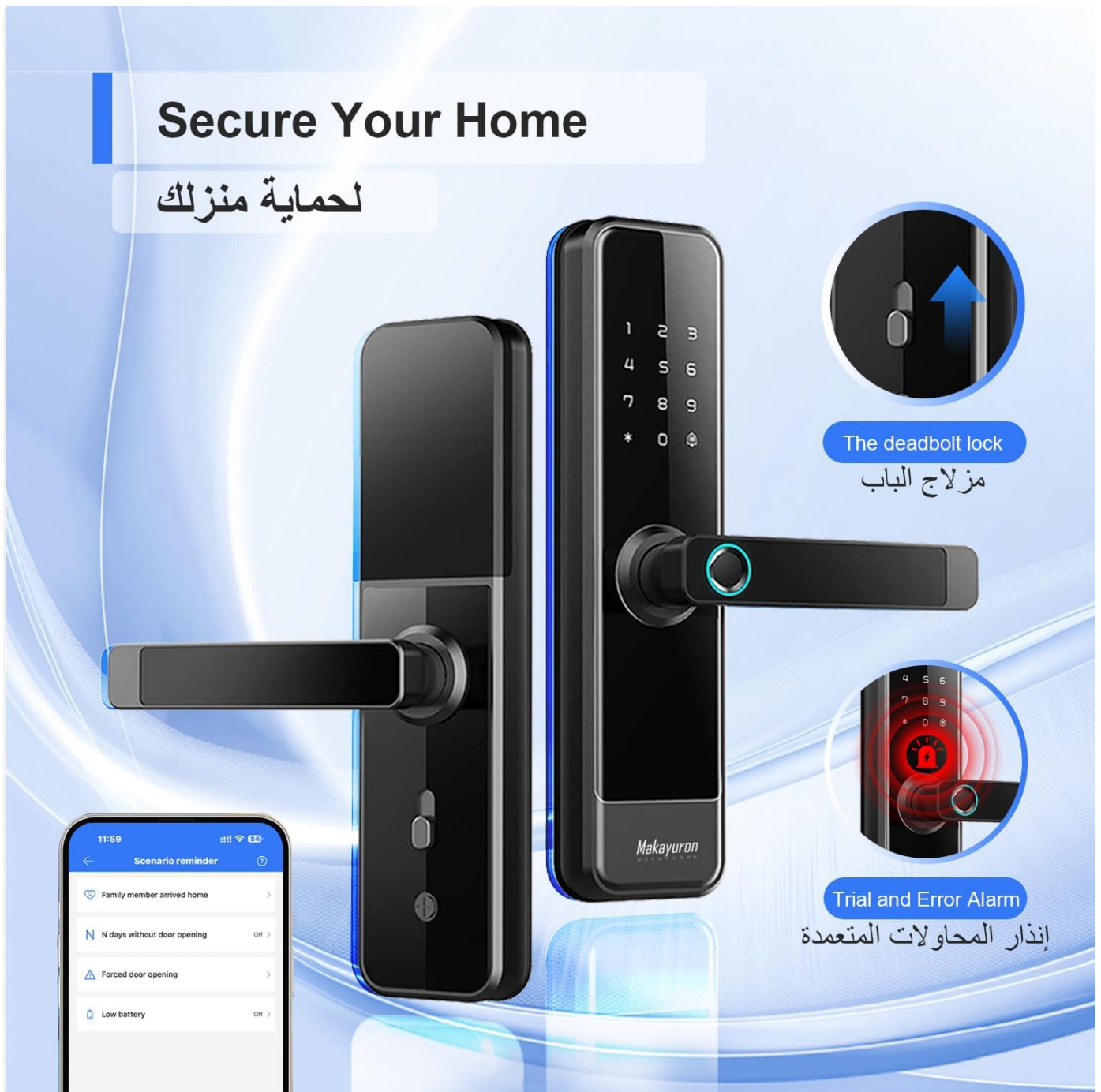
Figure 6.2: Secure Your Home

This image highlights the robust deadbolt mechanism and the 'Trial and Error Alarm' feature, which activates after multiple incorrect attempts, enhancing the security of your home.