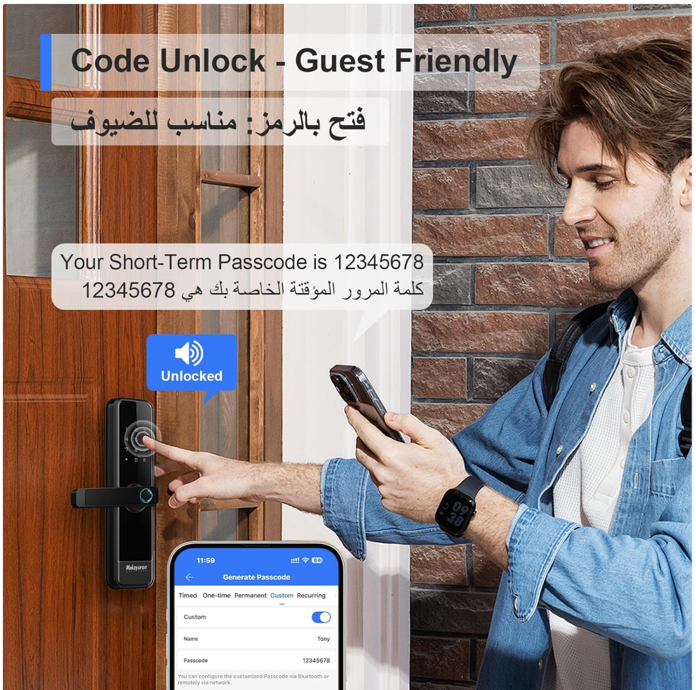
Figure 6.1: Code Unlock - Guest Friendly

This image demonstrates how to generate and use temporary passcodes via the TT Lock app, making it easy to provide access to guests or service providers.