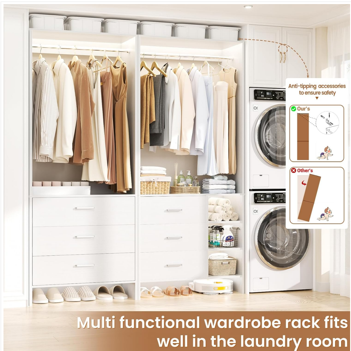
Image: The Aheaplus Closet System, showcasing its overall design with hanging space and drawers.