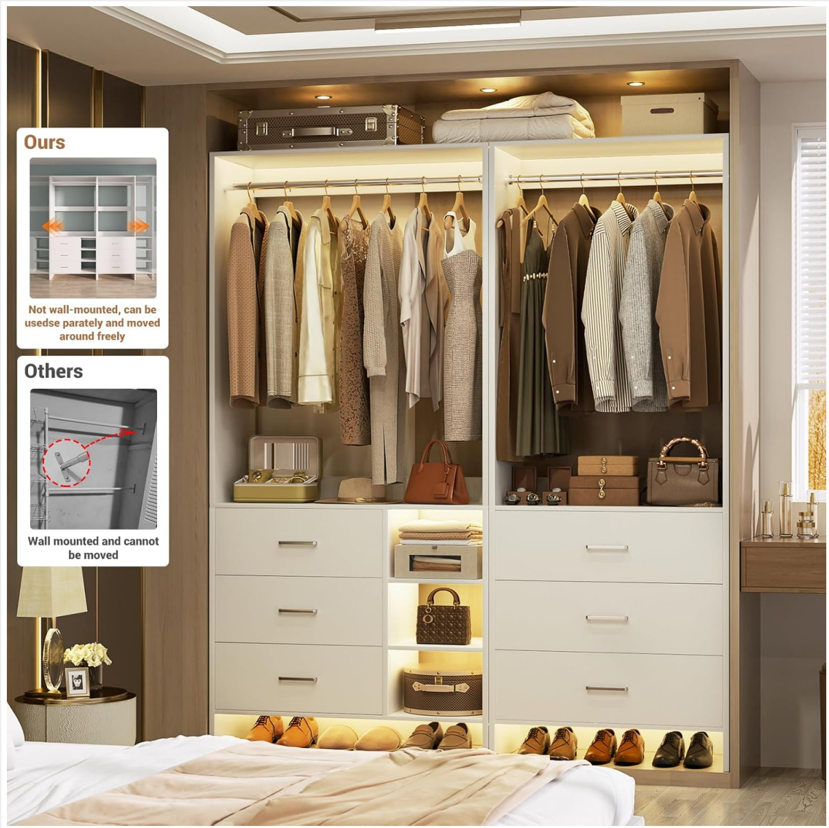
Image: Key features of the closet system including top shelf, anti-tip kits, desktop space, and drawers.