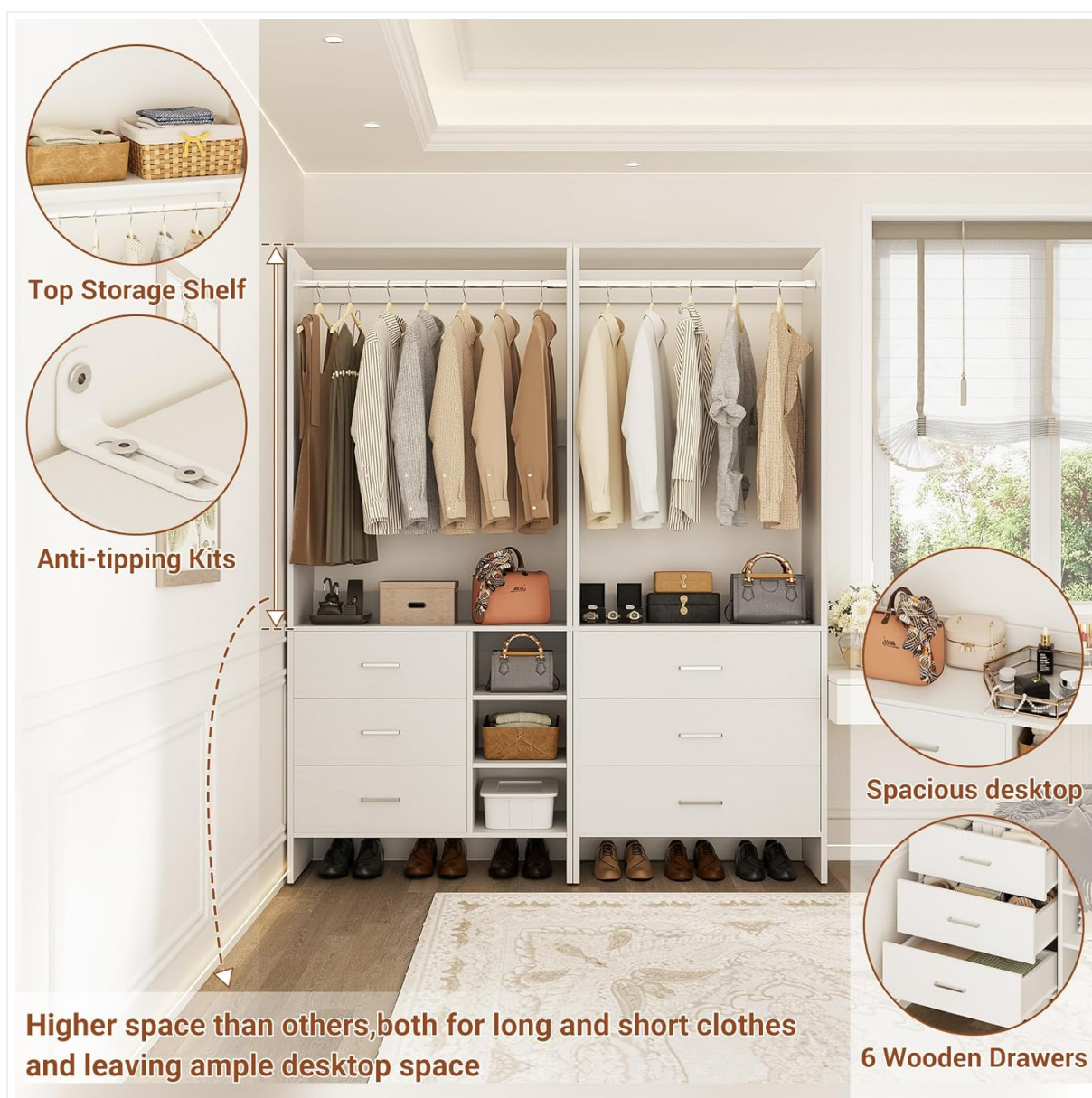
Image: Illustration of anti-tipping accessories installation for enhanced safety.