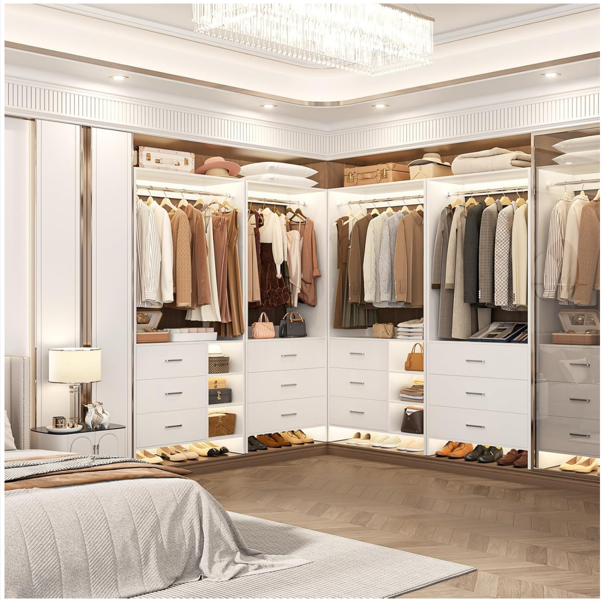
Image: The closet system positioned in a bedroom, illustrating its freestanding nature and flexibility.