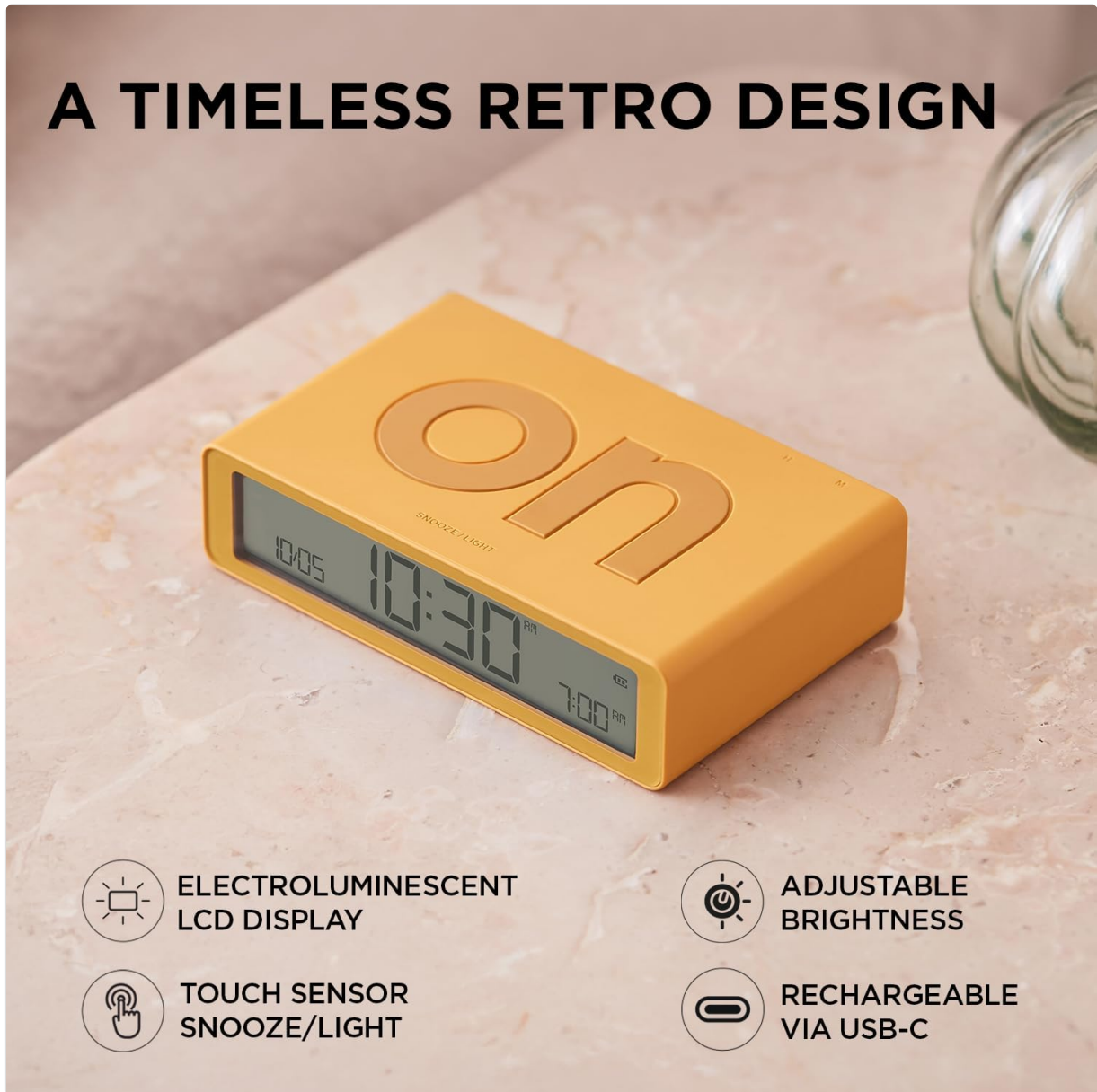
Image: The alarm clock's display and features, including the touch sensor for snooze and light.