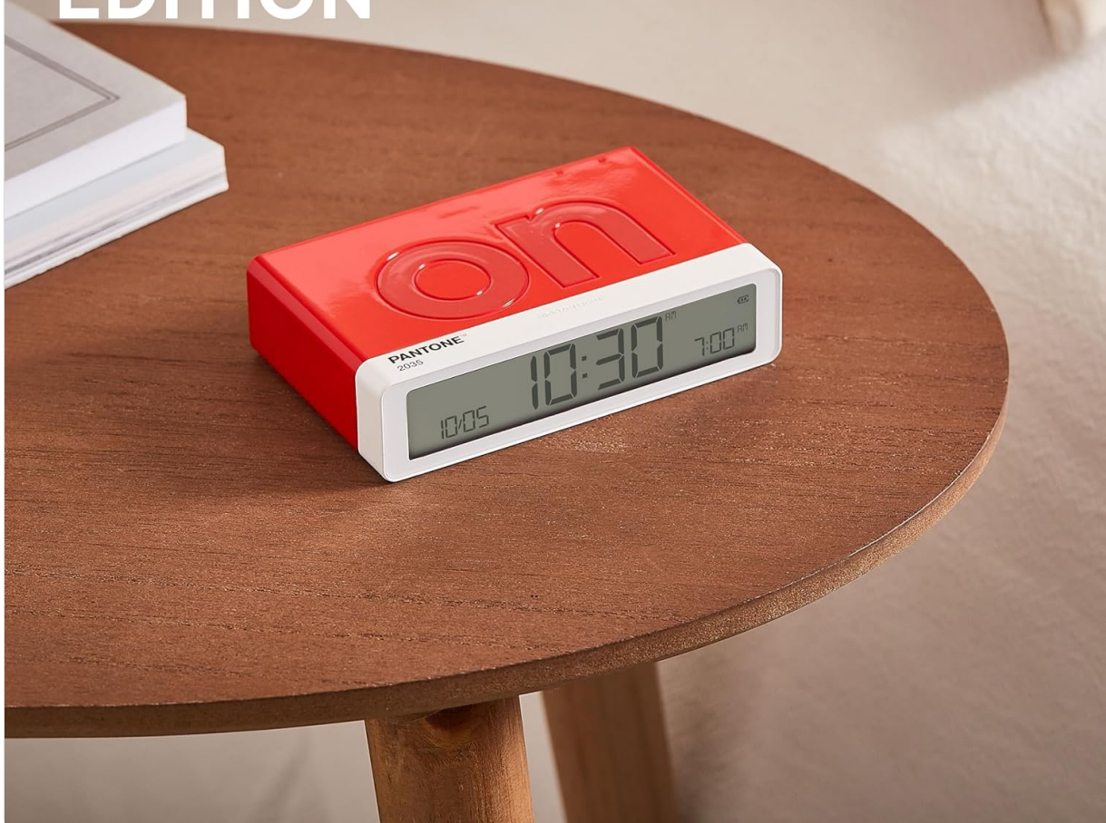
Image: Lexon Flip Classic Luminous Alarm Clock, showcasing its design and display.