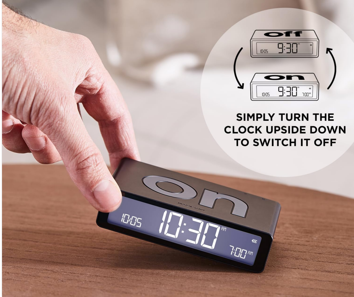
Image: Visual guide demonstrating the simple flip mechanism to switch the alarm on or off.