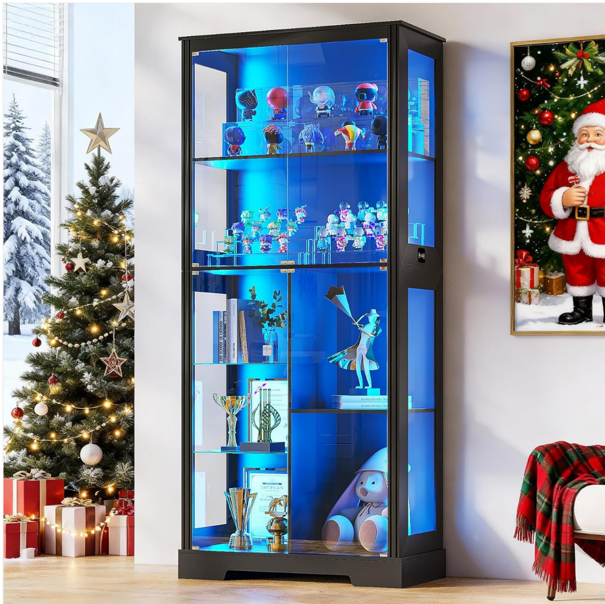
Image: The Lvifur 71-inch Display Cabinet, fully assembled and illuminated with blue LED lights, displaying various items in a modern living room environment.