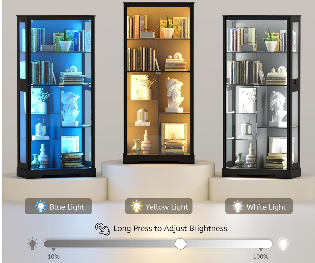
Image: Visual representation of the three LED light colors (Blue, Yellow, White) and the touch control interface for adjusting brightness.