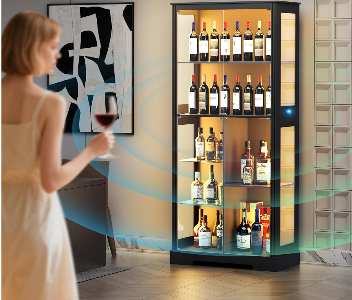
Image: The smart human body sensor in action, automatically illuminating the cabinet as a person approaches.

The light will automatically turn on / off when detects people approach