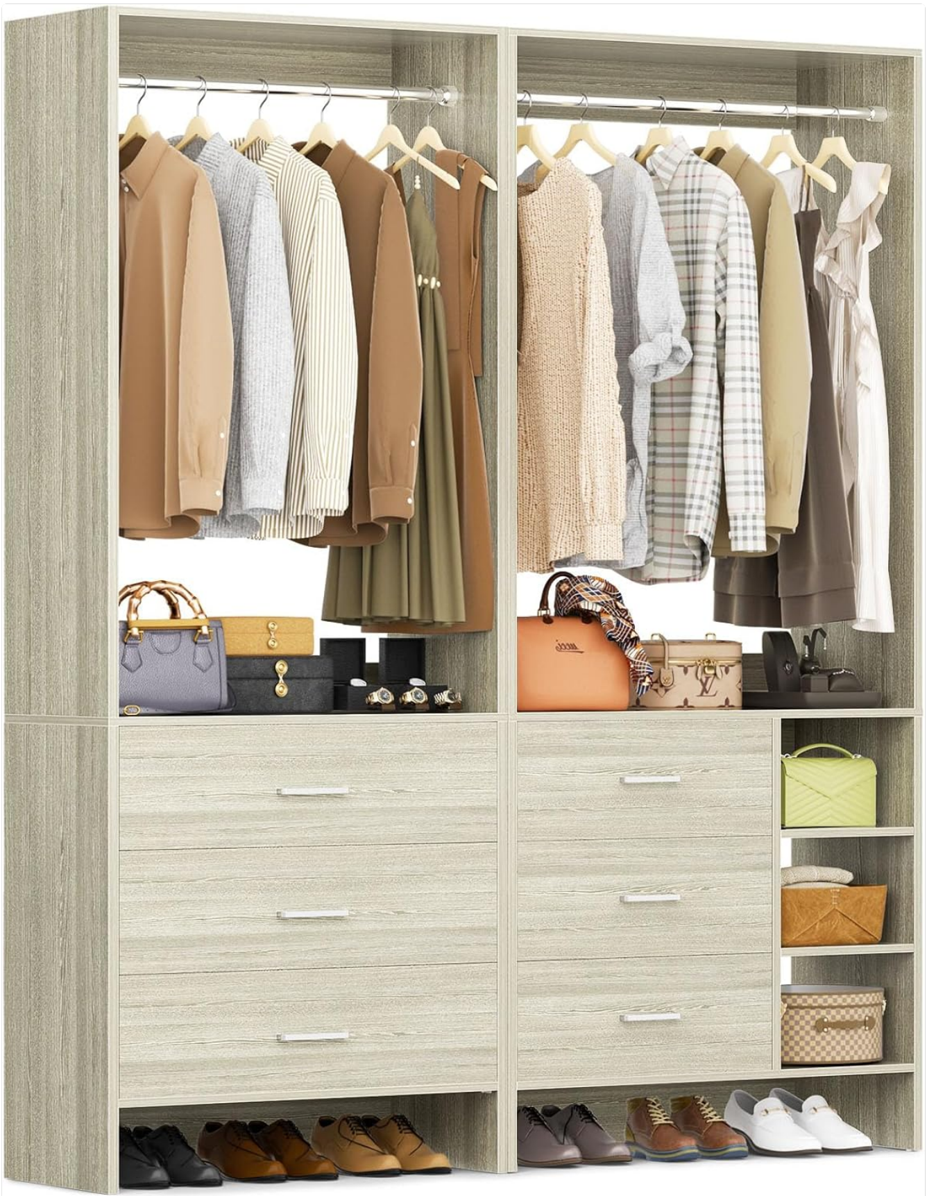
Image: The Aheaplus Closet System in White Oak, featuring two modular units with hanging rods, six drawers, and open shelves.