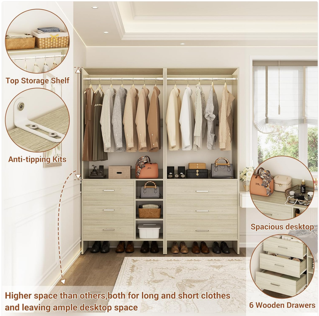
Image: Detail showing the anti-tipping kits for wall attachment.

Two anti-tip kits are included to secure the structure to the wall. This is a critical safety measure, especially in households with children or pets, to prevent accidental tipping. Install these kits as directed in the assembly guide.