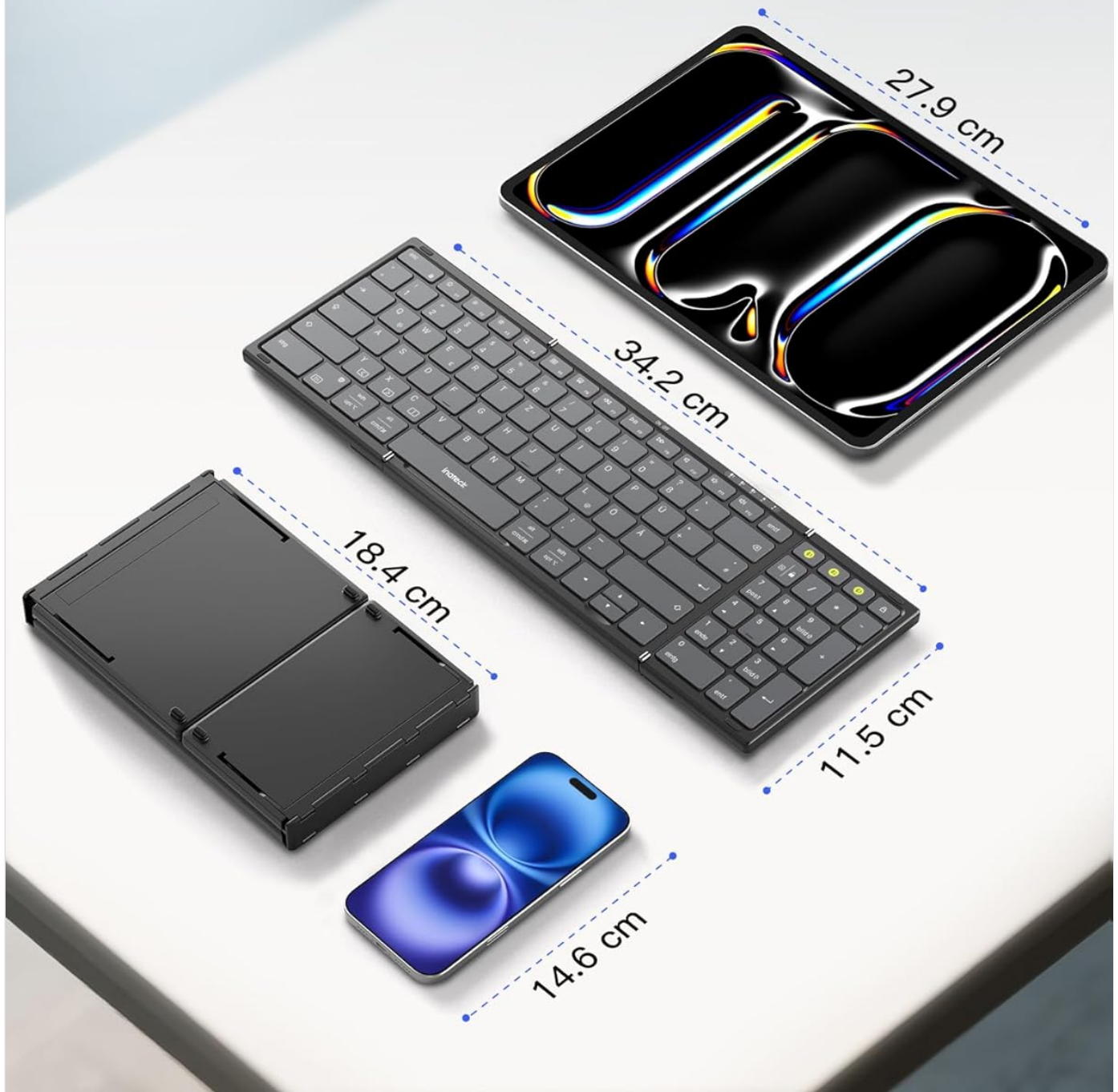
Image: Visual representation of the Inateck Nomad N0158 keyboard's dimensions when folded (18.4 cm) and unfolded (34.2 cm x 11.5 cm), alongside a tablet (27.9 cm) and smartphone (14.6 cm) for scale.