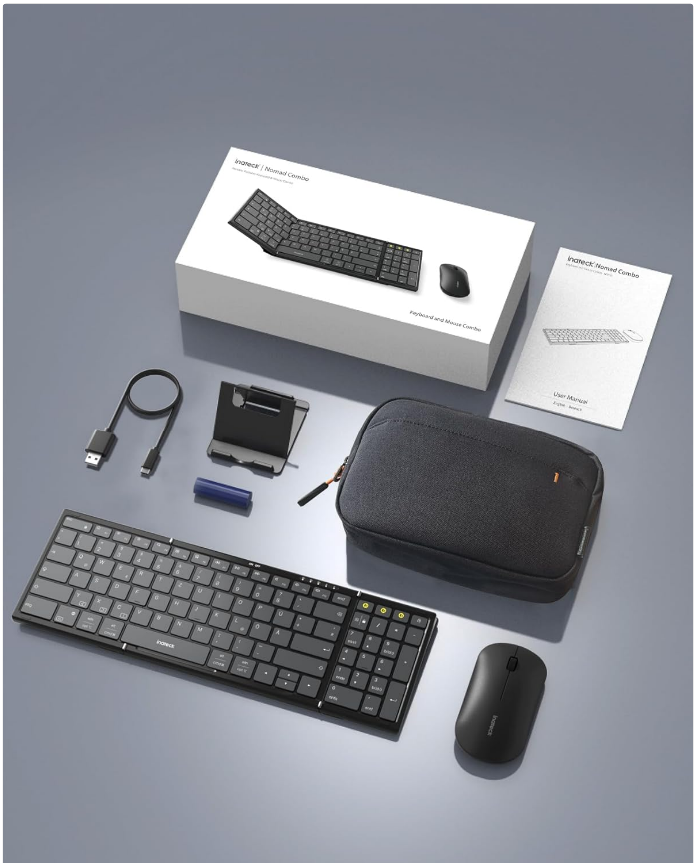
Image: All components included in the Inateck Nomad N0158 package: the foldable keyboard, wireless mouse, accessory bag, folding stand, and USB-C charging cable.