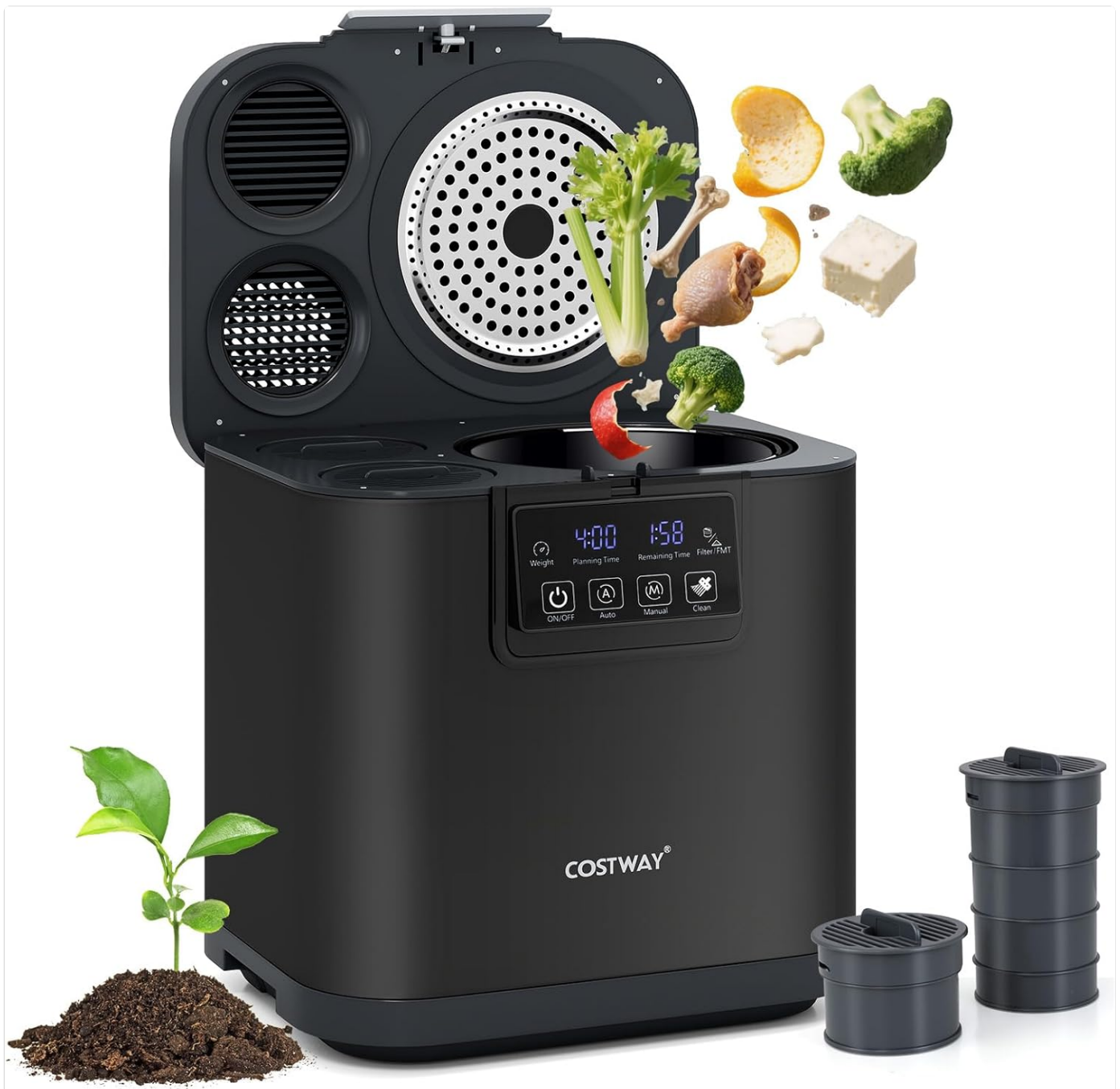
Image: The COSTWAY 4L Electric Composter with its lid open, illustrating the internal bucket and the process of adding various food scraps like vegetables, bread, and bones.