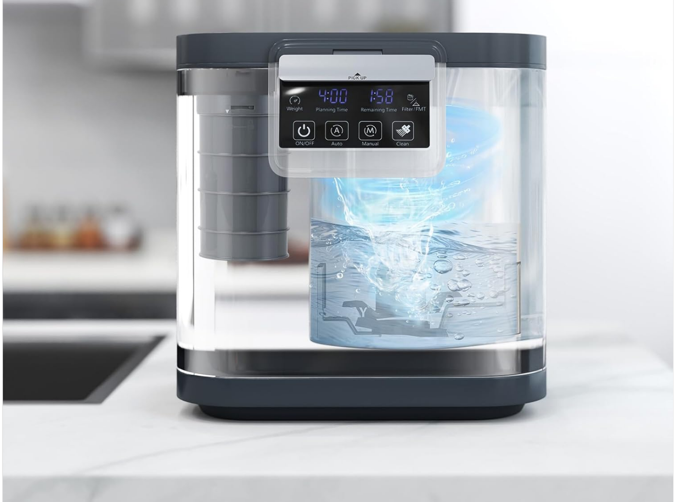
Image: A visual representation of the one-click self-cleaning mode, showing water being agitated inside the composter bucket to facilitate cleaning.

Note: Please add clear water into the bucket before