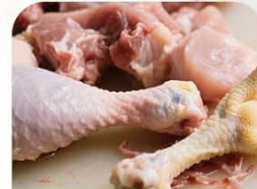
Meat and soft bones