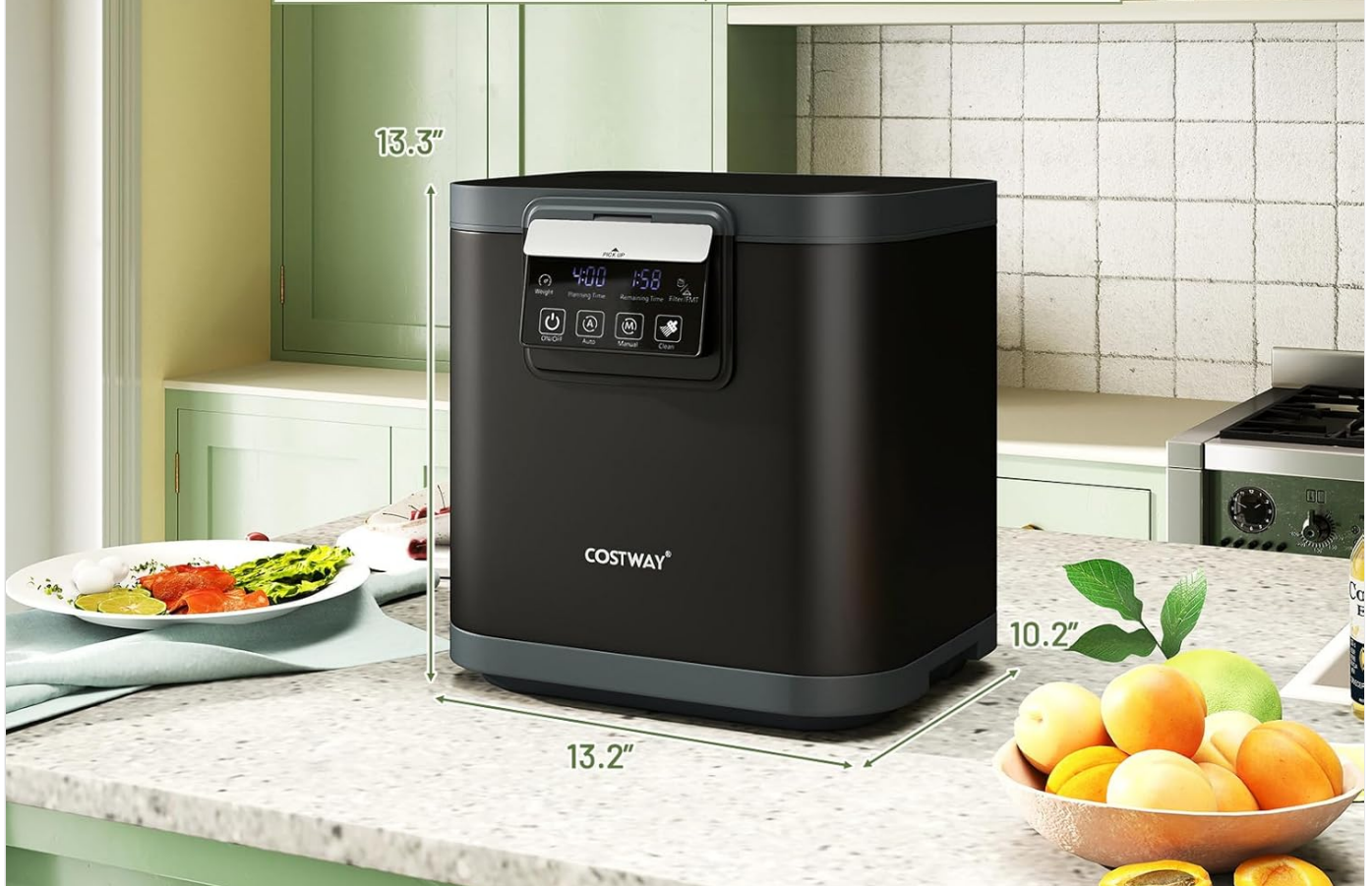
Image: The COSTWAY Electric Composter displayed on a kitchen countertop with its key dimensions (length, width, height) indicated.