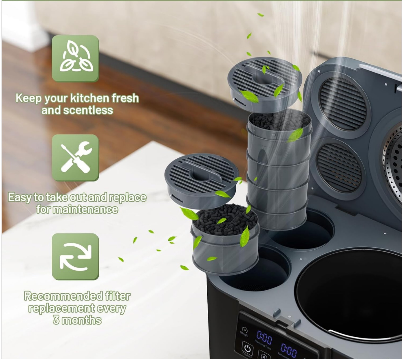
Image: A detailed view of the composter's lid, highlighting the two filter compartments and the process of inserting the activated carbon filters for odor control.

Recommended filter replacement every 3 months