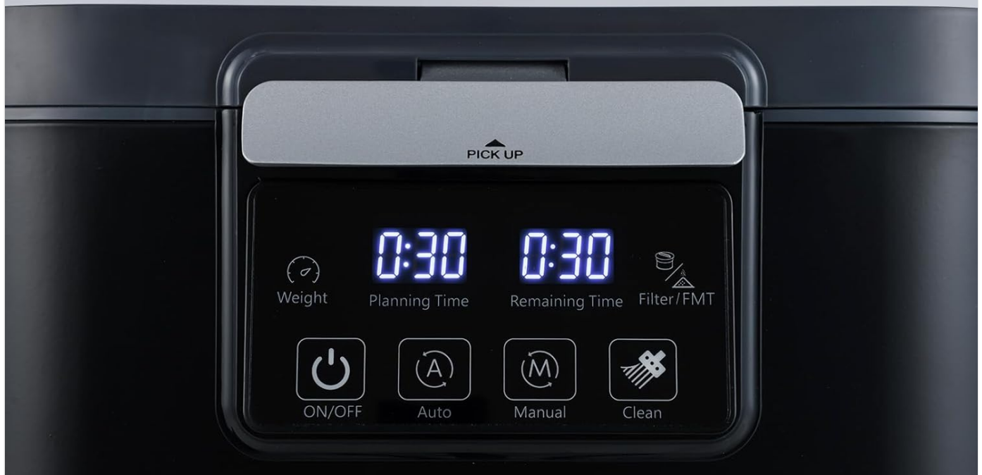
Image: A close-up of the composter's control panel, detailing the functions of each button and display indicator, including self-weighing, filter reminder, and various operating modes.

Takes about 10H to complete the composting process