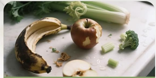
Vegetable and fruit scraps