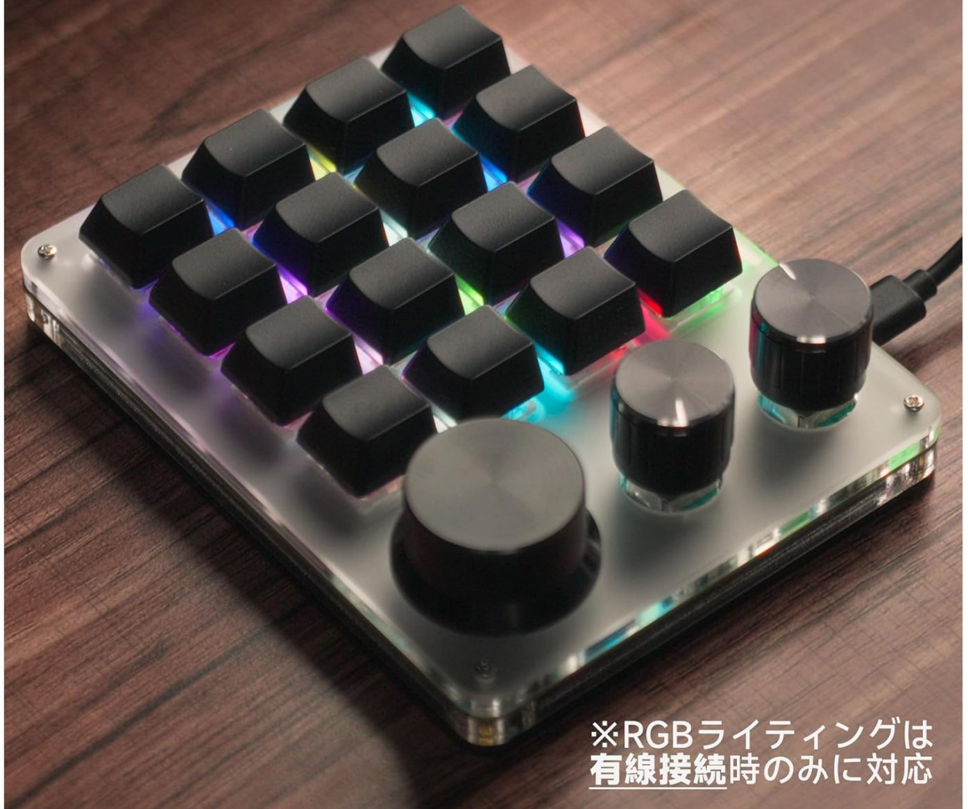
Image: The macro keyboard displaying its RGB illumination, showcasing the customizable lighting effects.