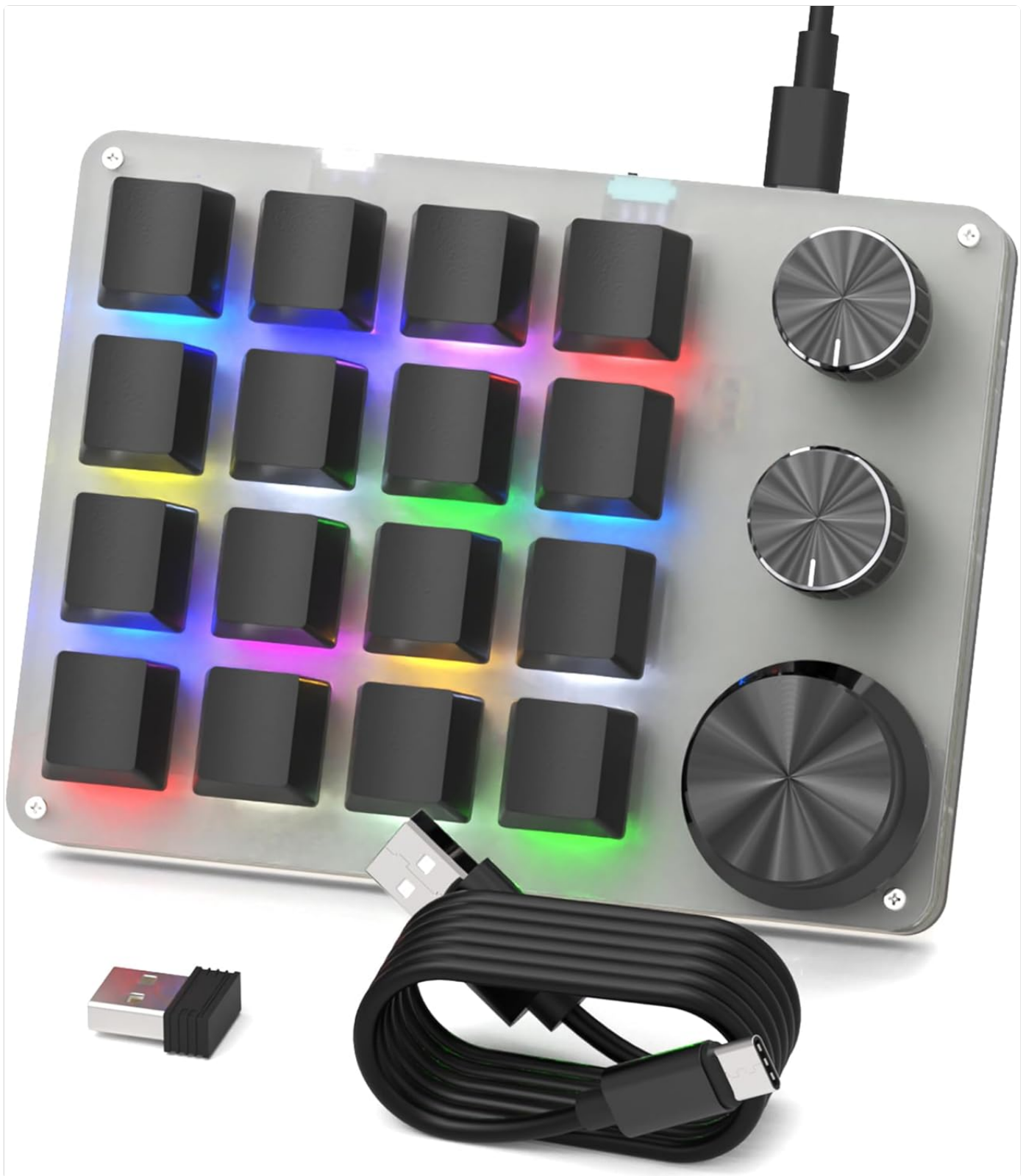
Image: The BRIMFORD Programmable Macro Keyboard, showing the 16 keys, 3 knobs, included USB Type-C cable, and 2.4G wireless dongle.