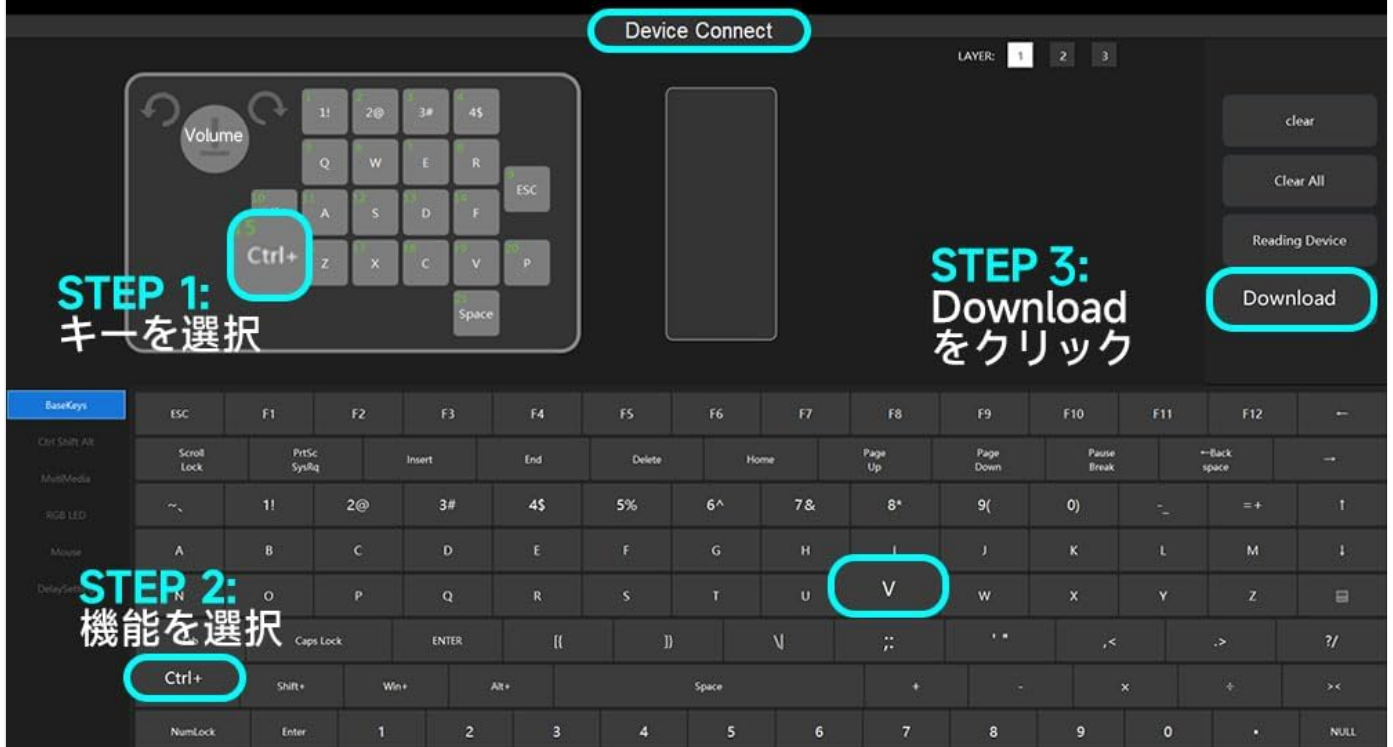
Image: Screenshot of the customization software interface, showing options for key assignment and function settings. The software allows for detailed configuration of the keyboard's capabilities.