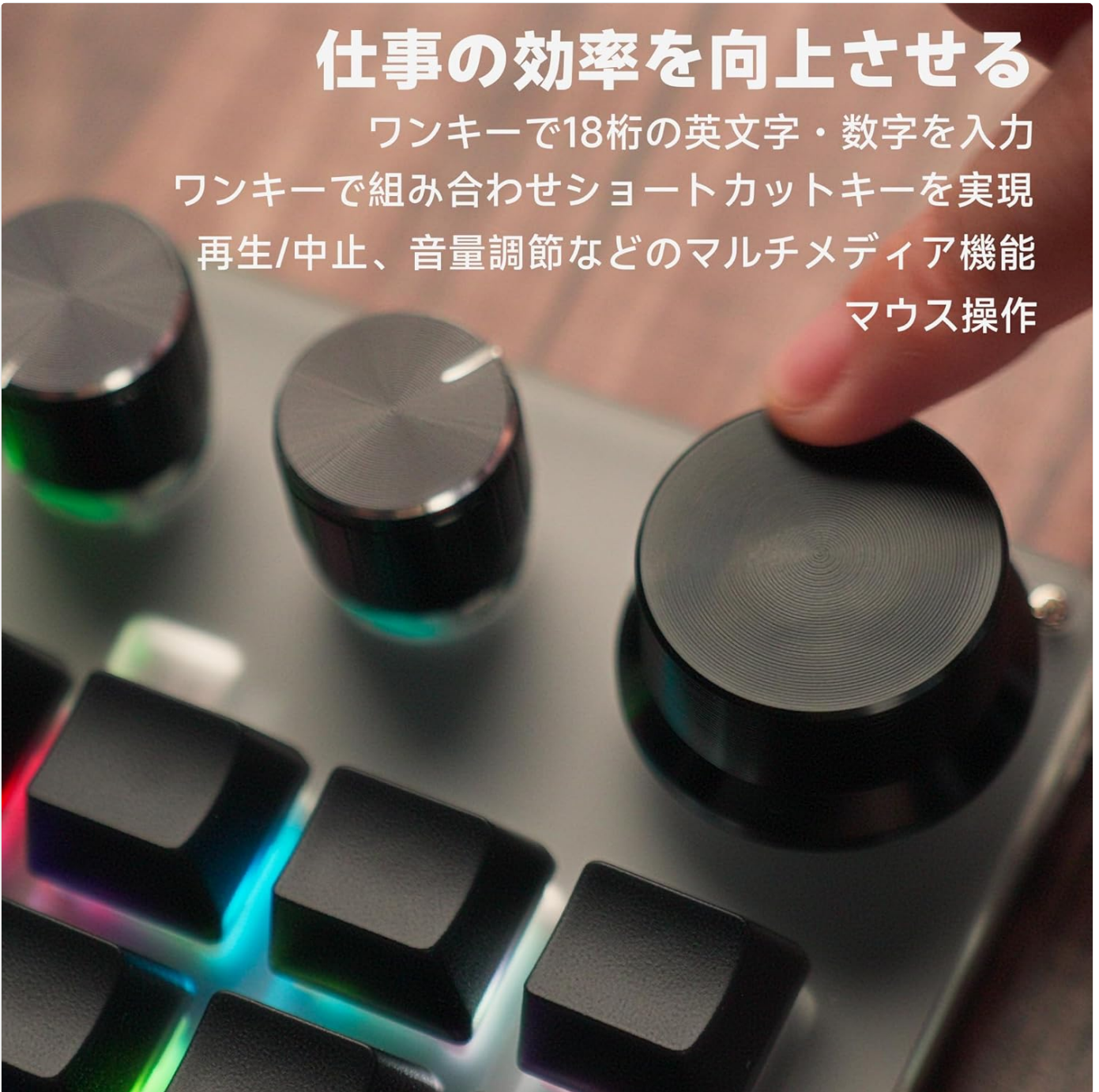
Image: A hand adjusting one of the knobs on the macro keyboard, illustrating its ease of use for functions like volume control or zooming.

ワンキーで18桁の英文字・数字を入力 ワンキーで組み合わせショートカットキーを実現 再生/中止、音量調節などのマルチメディア機能 マウス操作