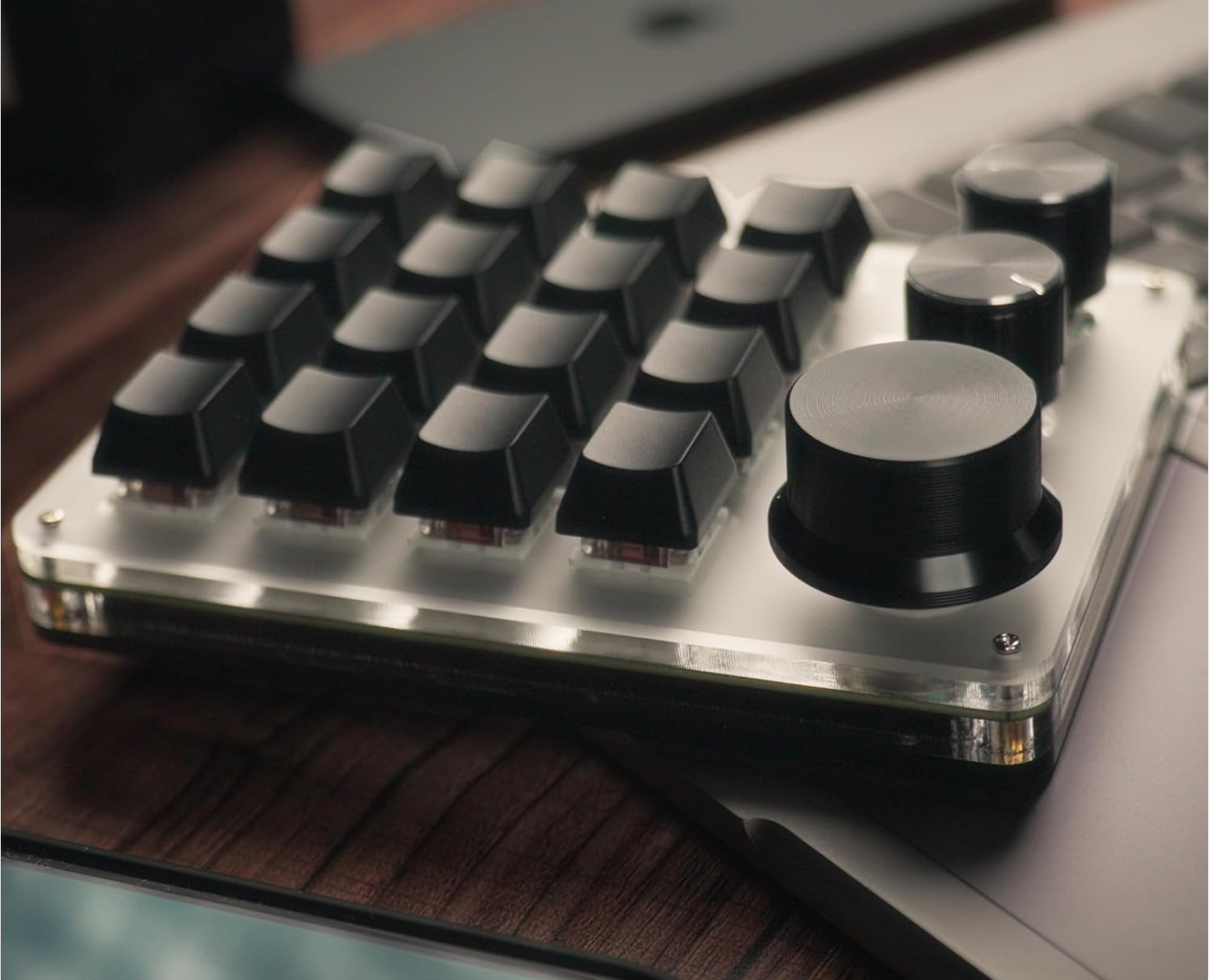
Image: The macro keyboard positioned next to a laptop, demonstrating its compatibility with various devices and connection types.

Windows/Mac OS/Android/iOSに対応 パソコン/ノートPC/タブレット/スマホなどに接続可能