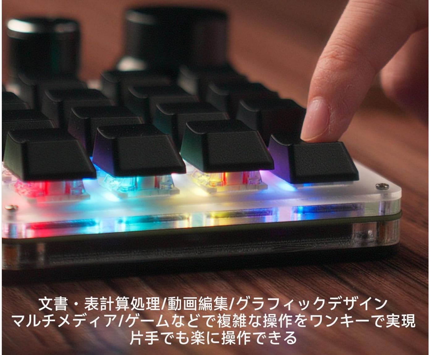
Image: A user's finger pressing a key on the macro keyboard, illustrating the comfortable and effortless input experience provided by the red mechanical switches.