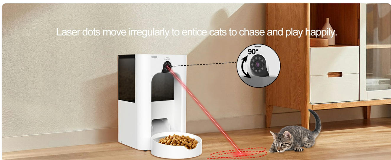
Image: SANSICO Automatic Pet Feeder demonstrating 2K/3MP camera pet motion detection, where the app sends push notifications when movement is detected, allowing real-time interaction.