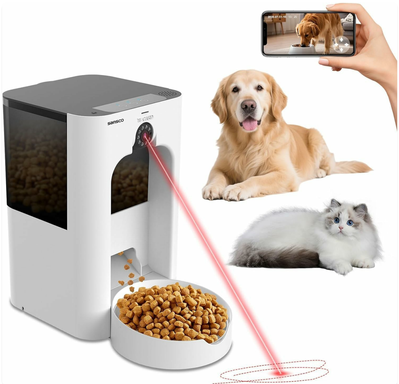
Image: SANSICO Automatic Pet Feeder with a dog, showcasing its main features like 2K/3MP resolution, real-time video, app control, and timed rationing.