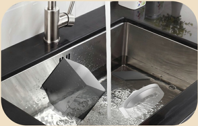
Image: SANSICO Automatic Pet Feeder cleaning instructions, showing how to clean the removable stainless steel bowl and food tank, and emphasizing not to wash the main unit with water.

Your browser does not support the video tag.