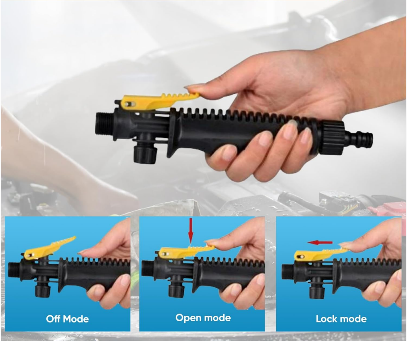
Image: Visual guide demonstrating the "Off Mode," "Open Mode," and "Lock Mode" positions of the watering wand's flow control switch.

- Effortless switch design, easier to turn on