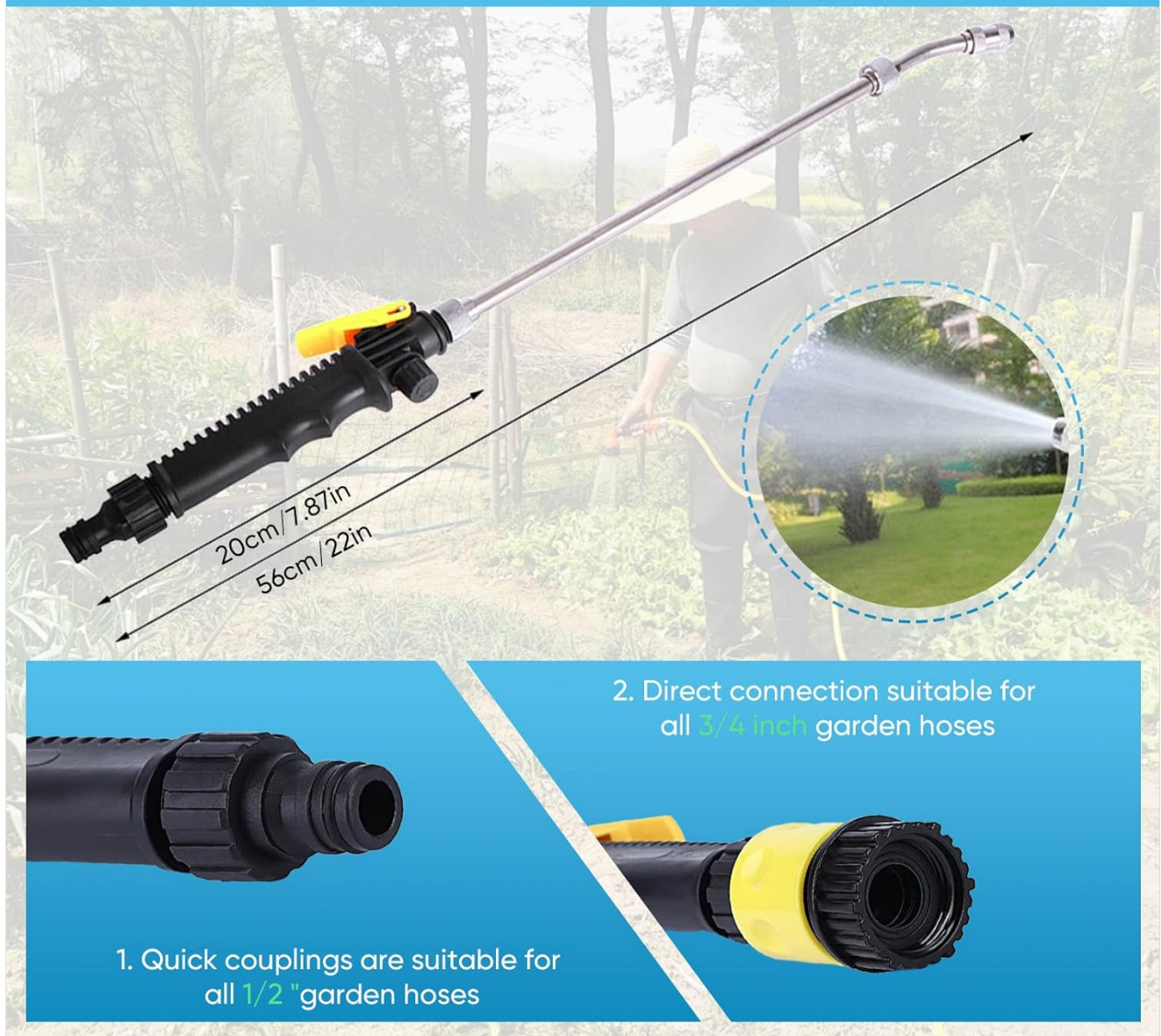
Image: Illustration showing the two connection methods for the Saker watering wand: quick couplings for 1/2" hoses and direct connection for 3/4" hoses.