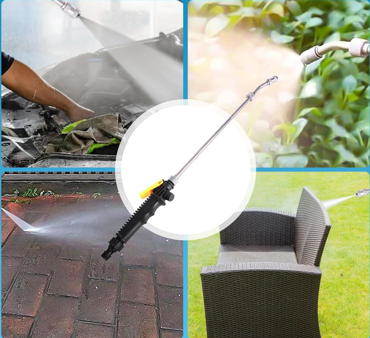
Image: Examples of the Saker watering wand in use for car washing and watering plants, demonstrating its versatility.