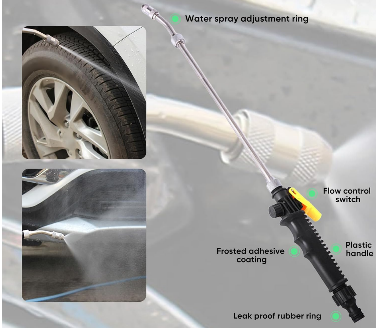
Image: Detailed view highlighting key components such as the water spray adjustment ring, flow control switch, plastic handle, frosted adhesive coating, and leak-proof rubber ring.