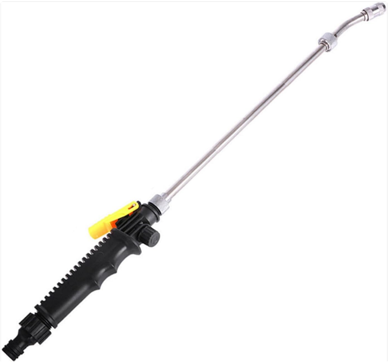
Image: The Saker High Pressure Water Spray Gun and Universal Watering Wand, showcasing its full length and design.