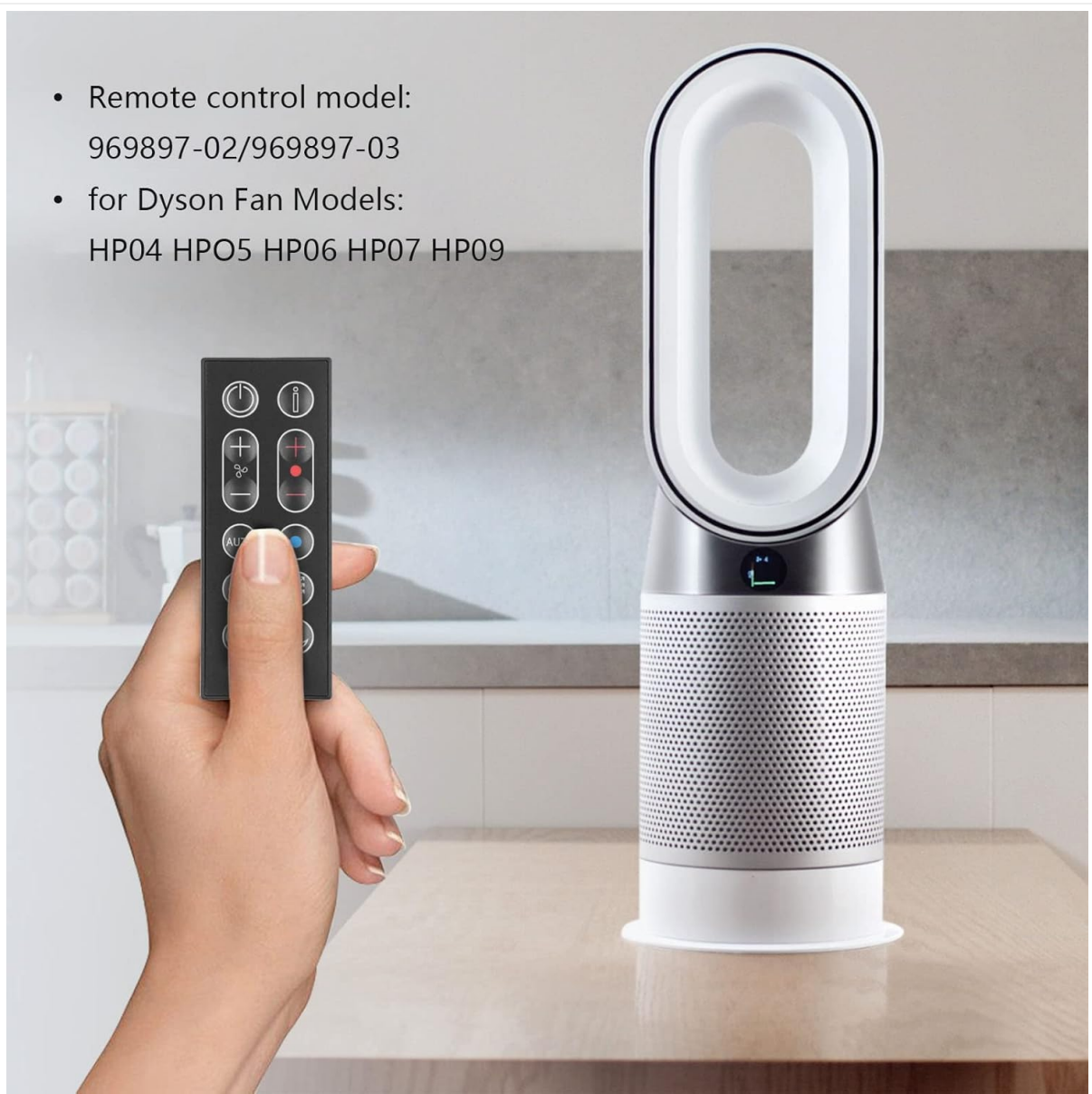
Image: The remote control displayed next to a Dyson Pure Hot+Cool unit, with text indicating compatibility with HP04, HP05, HP06, HP07, HP09 models.