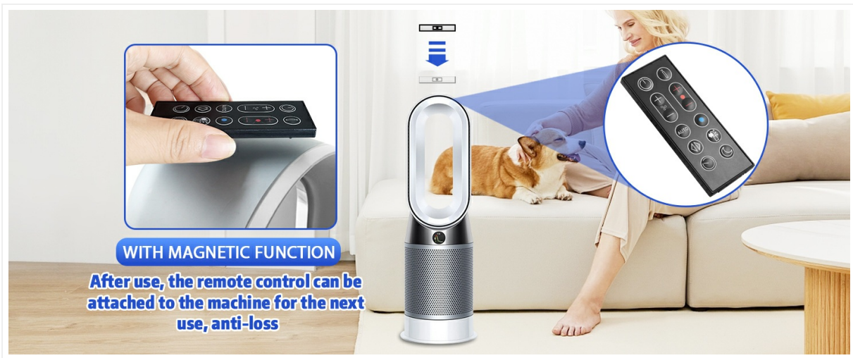
Image: A hand placing the remote control onto the top of a Dyson fan, demonstrating its magnetic attachment feature.