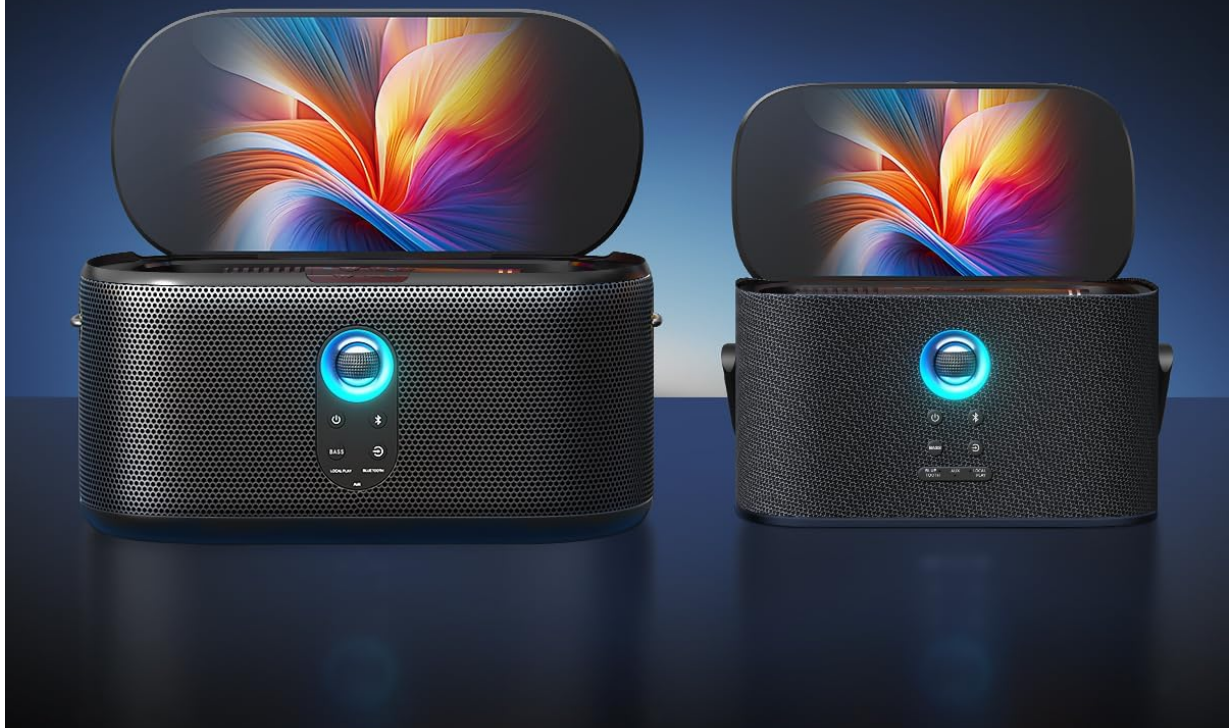
Image: The Ikarao Karaoke Machine with its 10.1-inch screen open, showing the user interface with icons for Media Player, YouTube, and other applications.