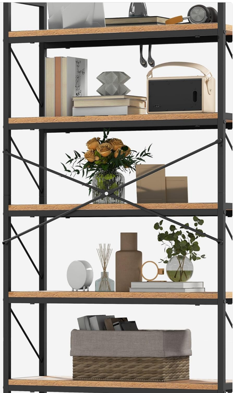
Figure 2: Close-up of the X-shaped back brace design, which contributes to the bookshelf's stable structure and helps prevent items from falling.