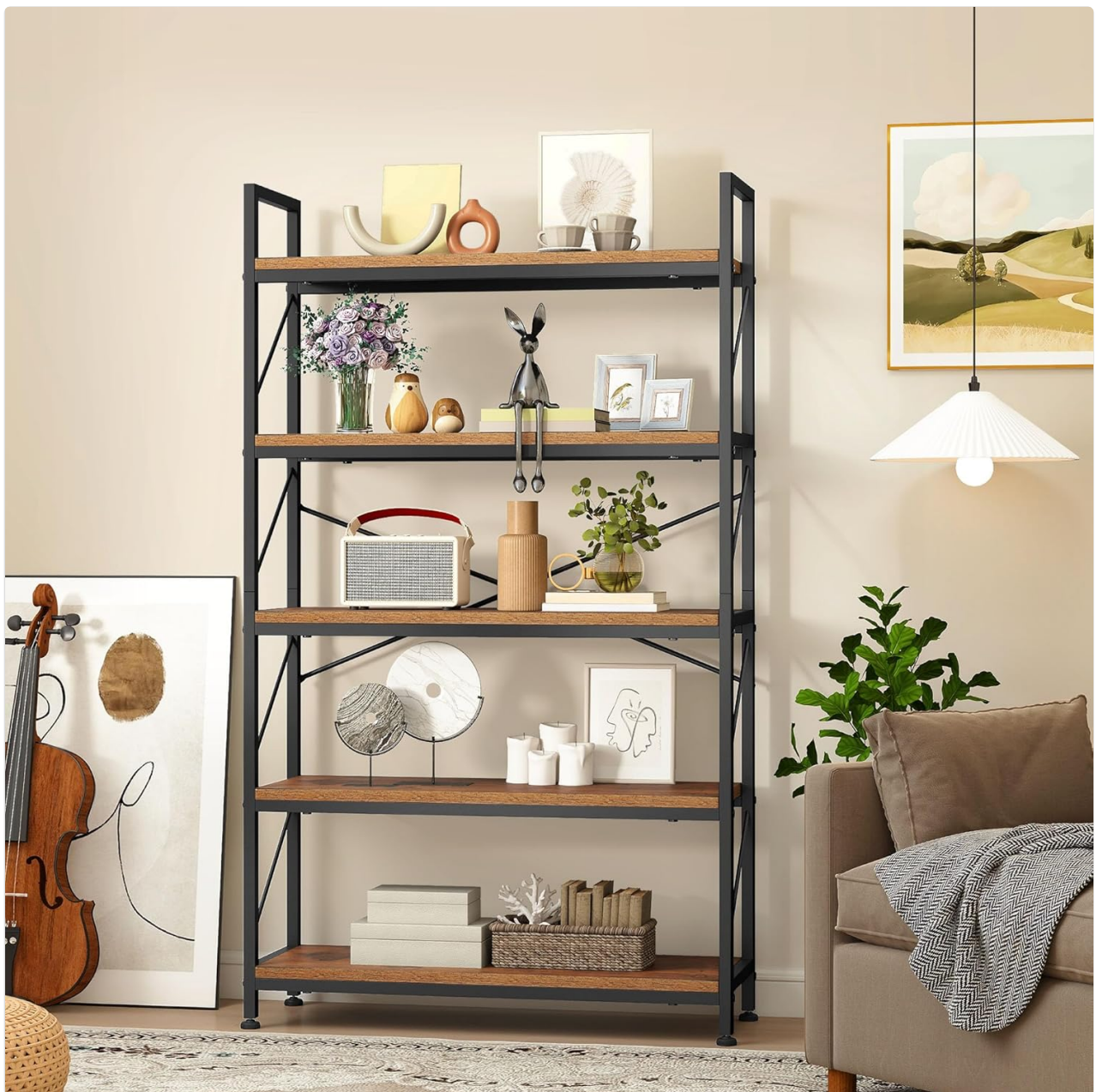
Figure 4: The bookshelf integrated into a living space, showcasing its capacity for various items.