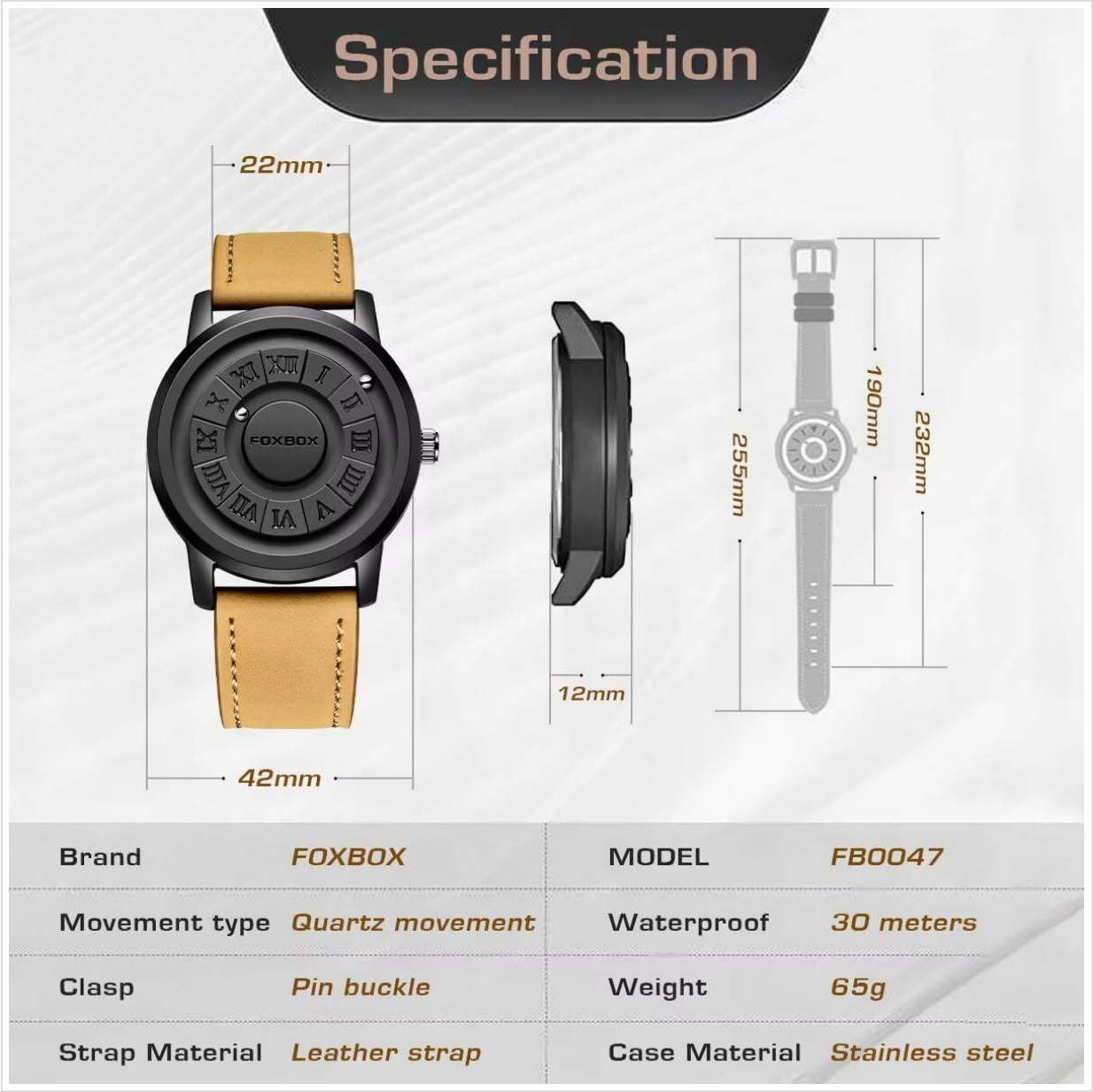
Image 5: A visual representation of the watch's dimensions and key specifications.