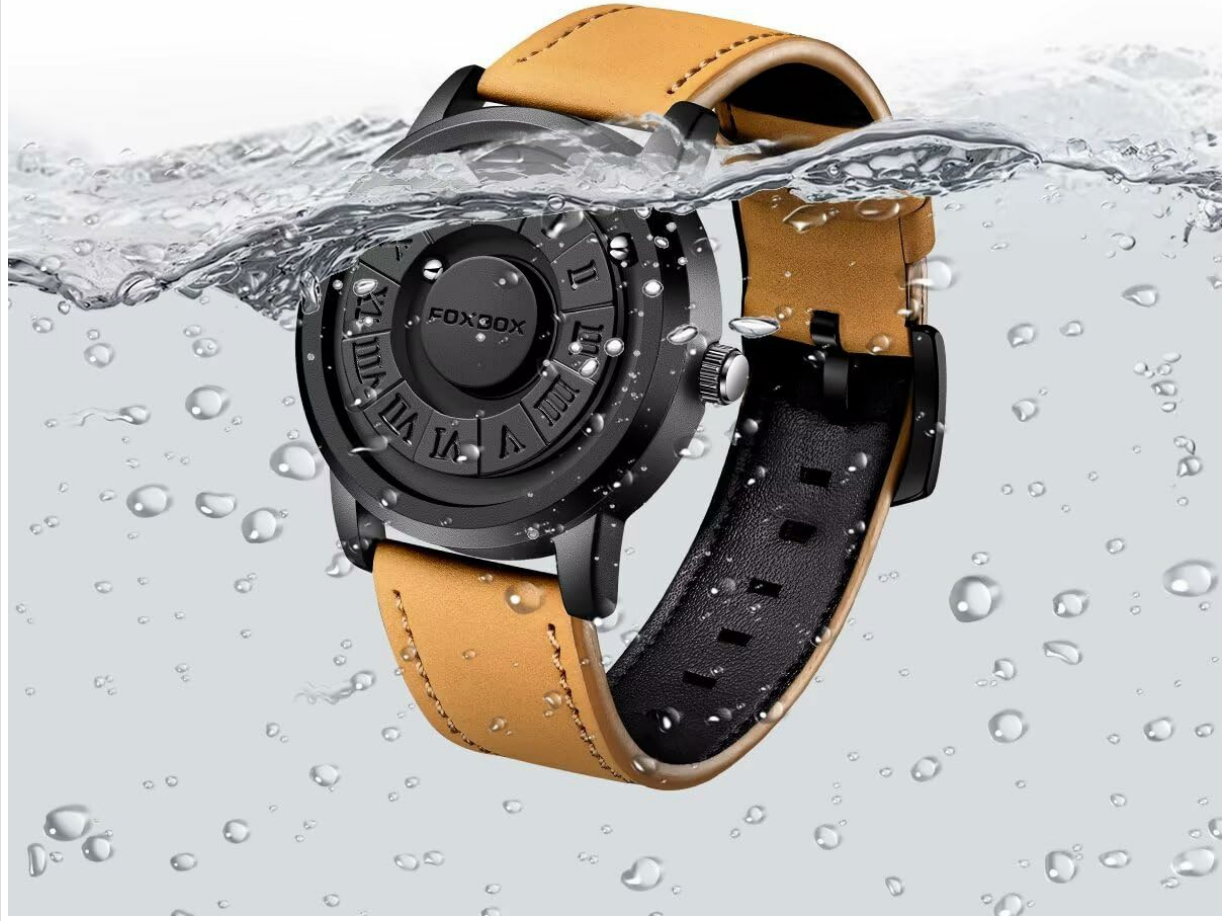
Image 4: The watch partially submerged in water, demonstrating its 30-meter water resistance for splashes and rain.

With sealed waterproof ring, easy to deal with the challenge of water splash (all watches can not be protected from warm water, hot water)