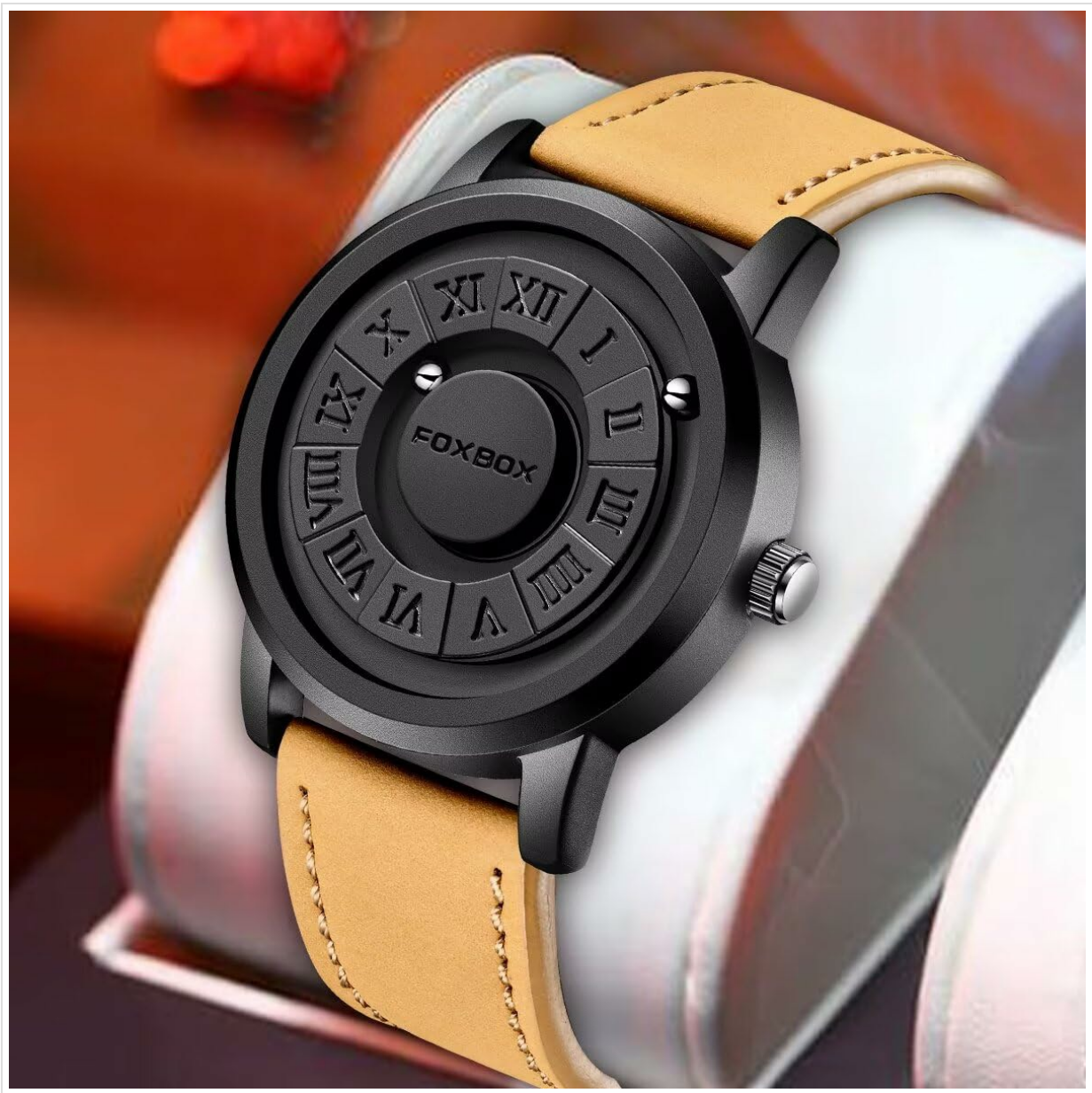
Image 2: The watch displayed on a stand, showcasing the black dial and orange leather strap.