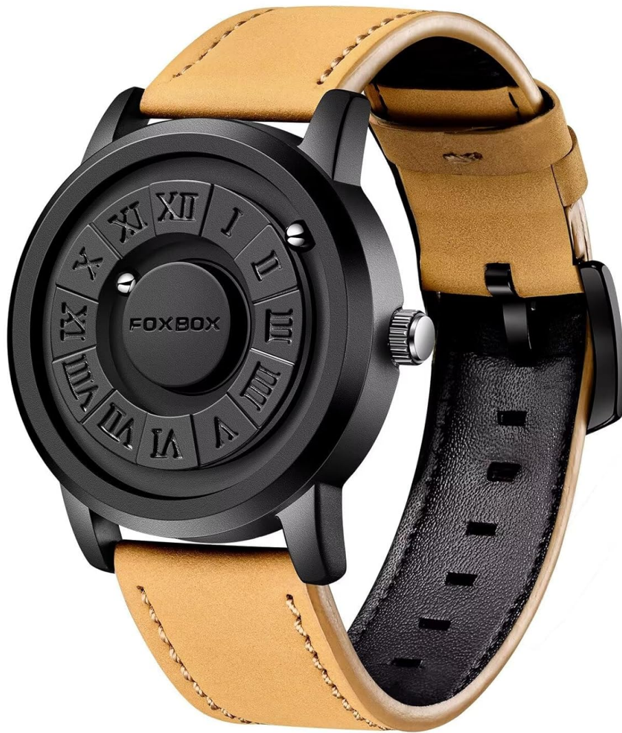
Image 1: Front view of the SACOSDING Magnetic Floating Ball Pointer Quartz Analog Watch, featuring a black dial with Roman numerals and an orange leather strap.