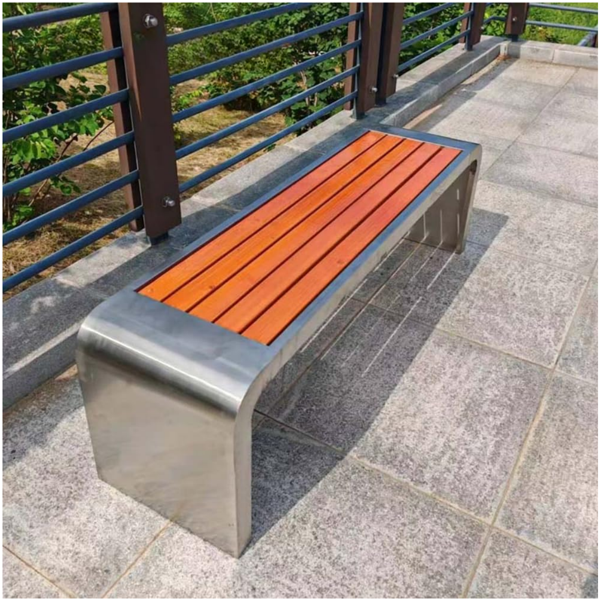
Image 3: The LITFAD Park Bench positioned in an outdoor area, demonstrating its intended use.