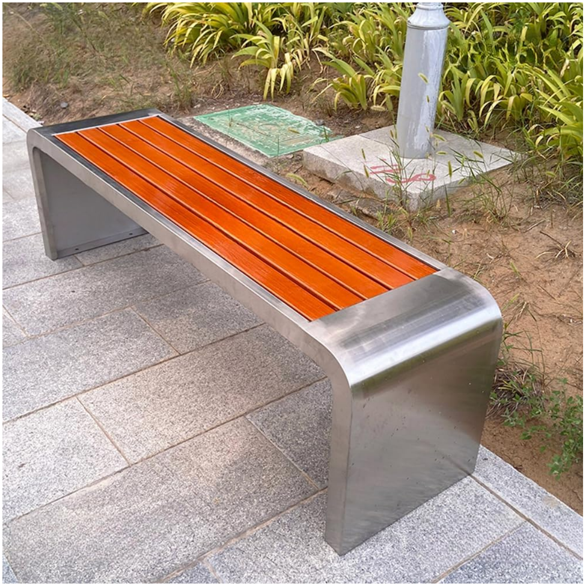
Image 1: Main view of the LITFAD Park Bench, showcasing its stainless steel frame and plastic wood seating.