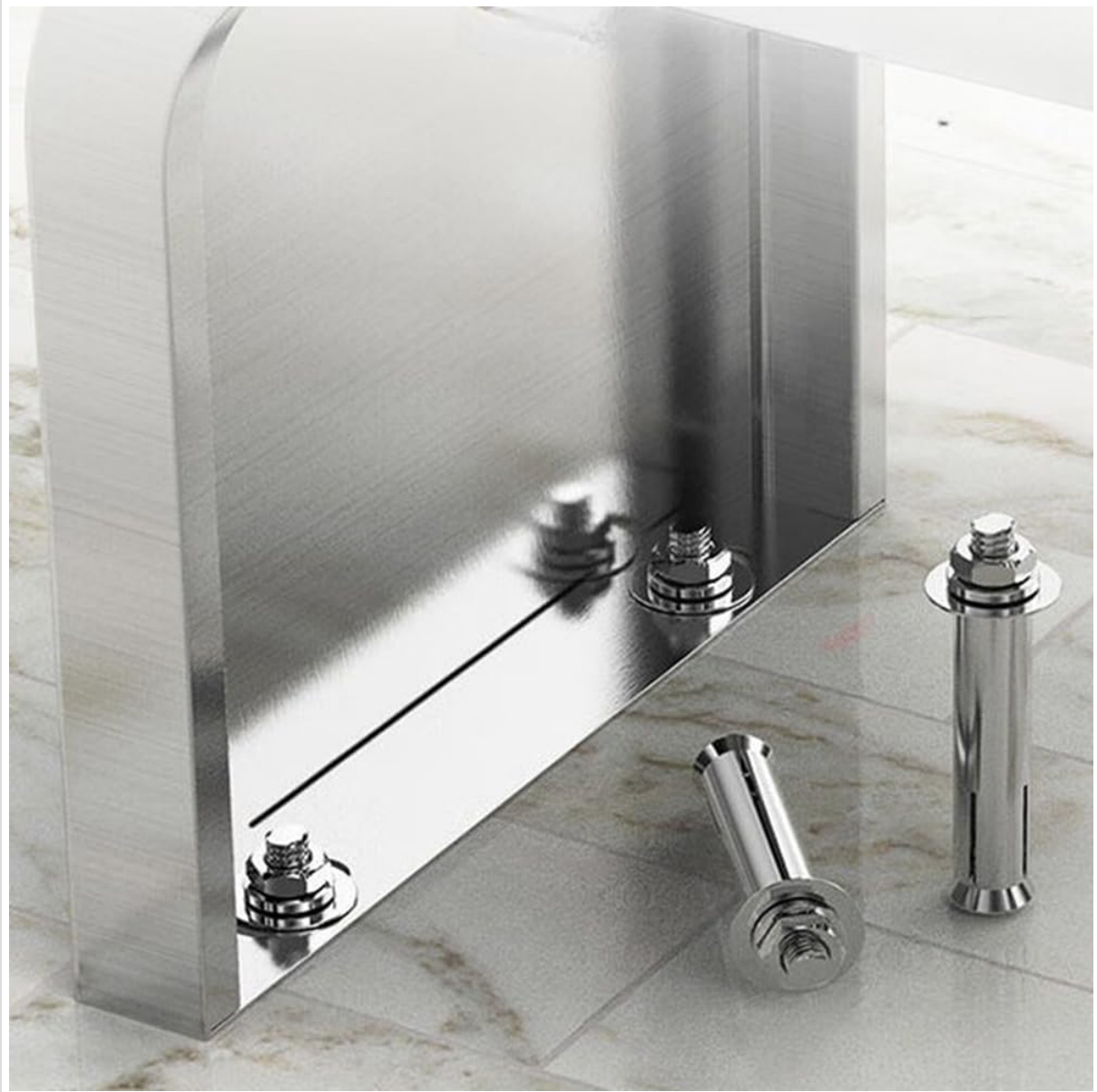
Image 2: Detail of the expansion screws used to secure the bench to the ground for added stability and security.