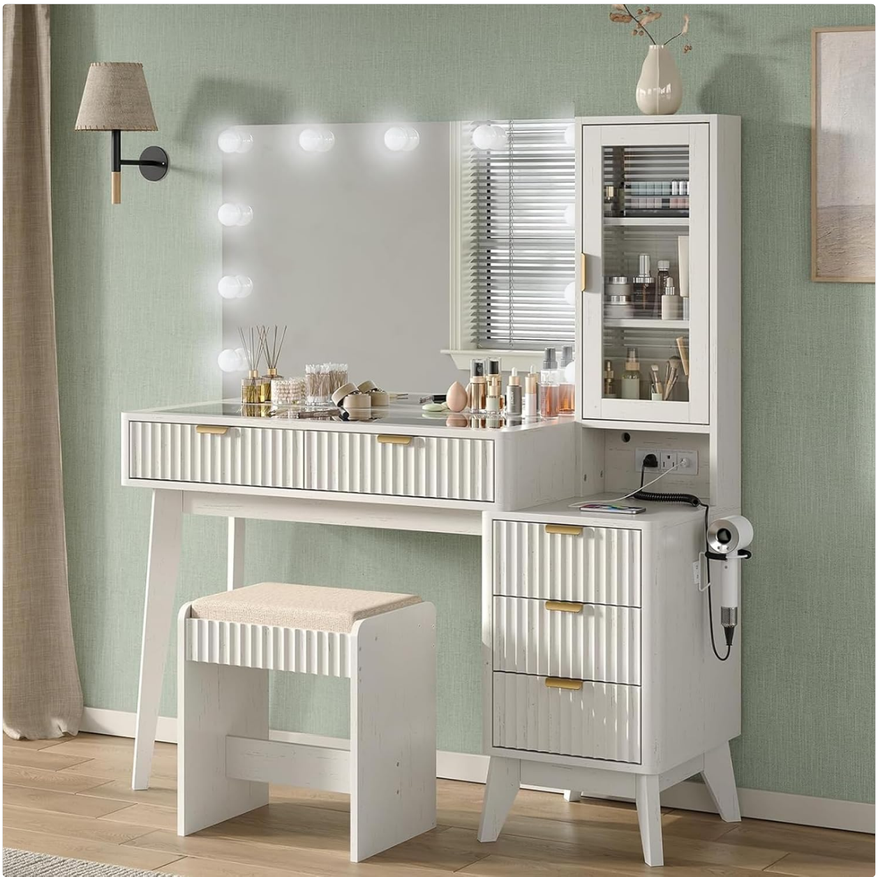
Image 1.1: CollaredEagle Fluted Makeup Vanity Desk with LED mirror and stool.