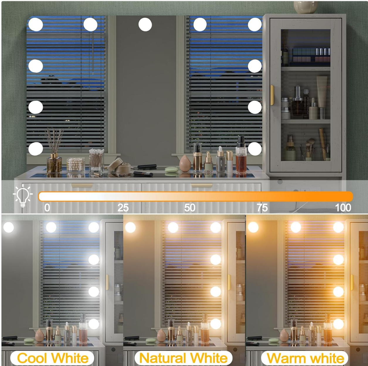
Image 5.1: Illustration of the three adjustable LED lighting modes.