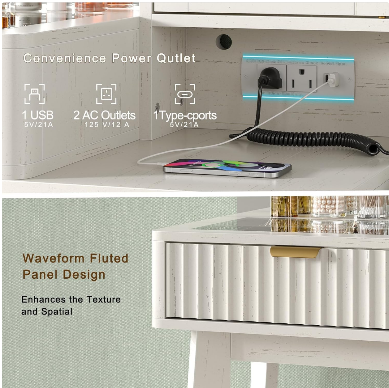
Image 5.2: Close-up of the integrated power outlet for electronic devices.