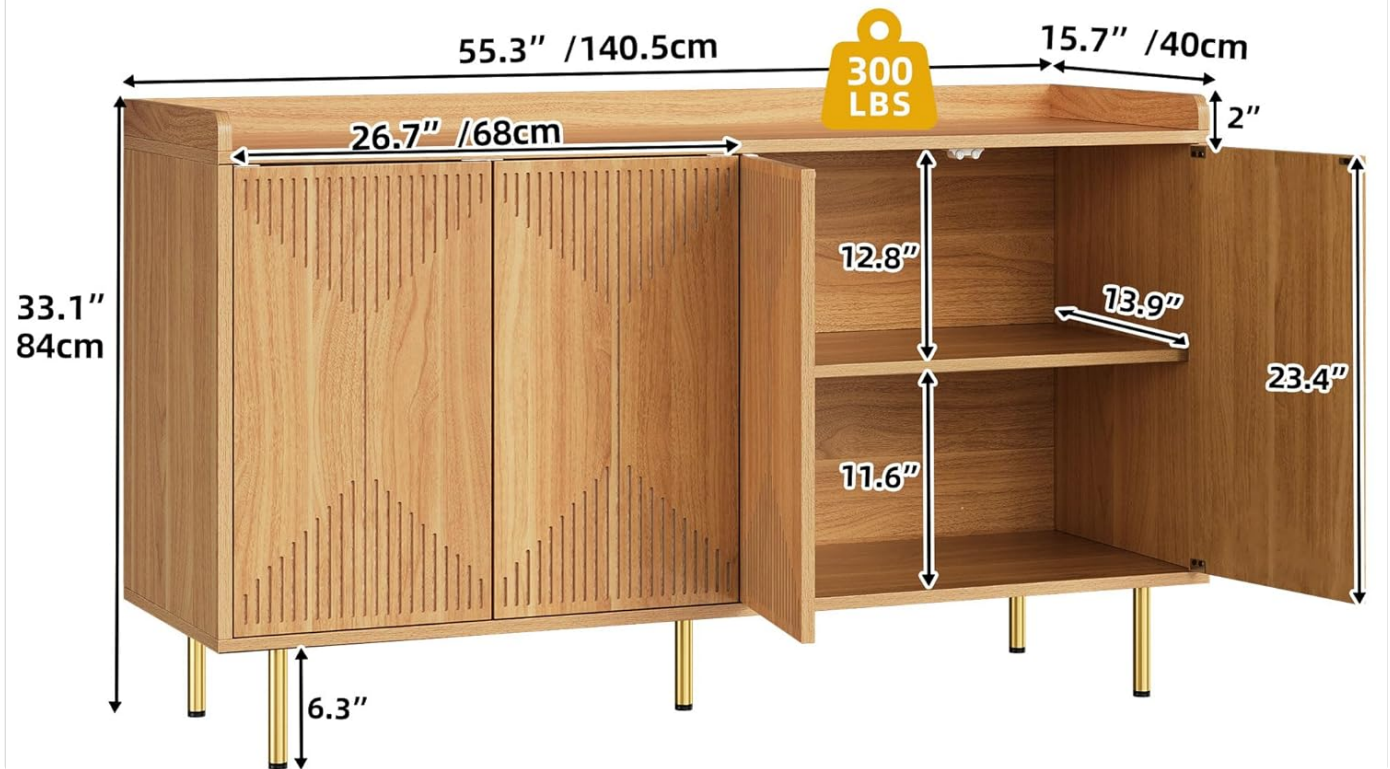
Image: Detailed product dimensions, showing the overall width, height, depth, and internal shelf measurements of the cabinet.