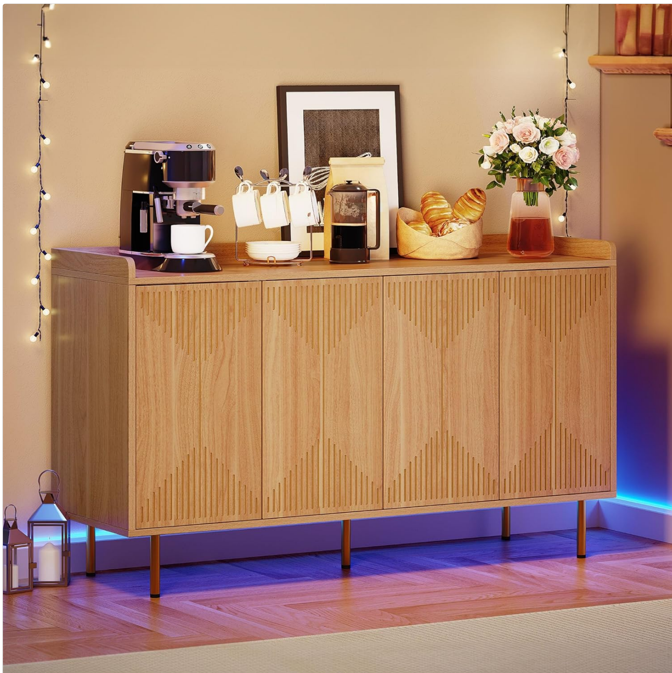
Image: The DWVO 55" Kitchen Storage Cabinet, showcasing its natural wood finish and carved doors, integrated into a modern living space with a coffee bar setup.