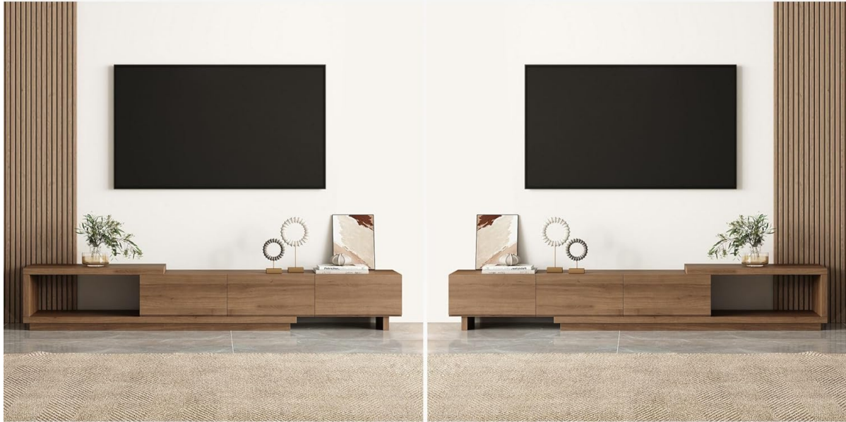
Image 3.1: Demonstrates the flexible left-right layout options for the extendable TV stand.