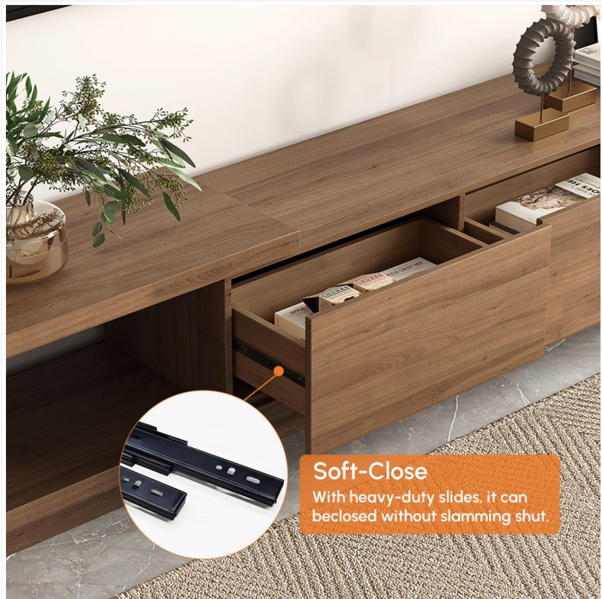
Image 4.1: Detail of the soft-close drawer mechanism, ensuring quiet operation.

The three drawers are equipped with soft-close slides for quiet and smooth operation.