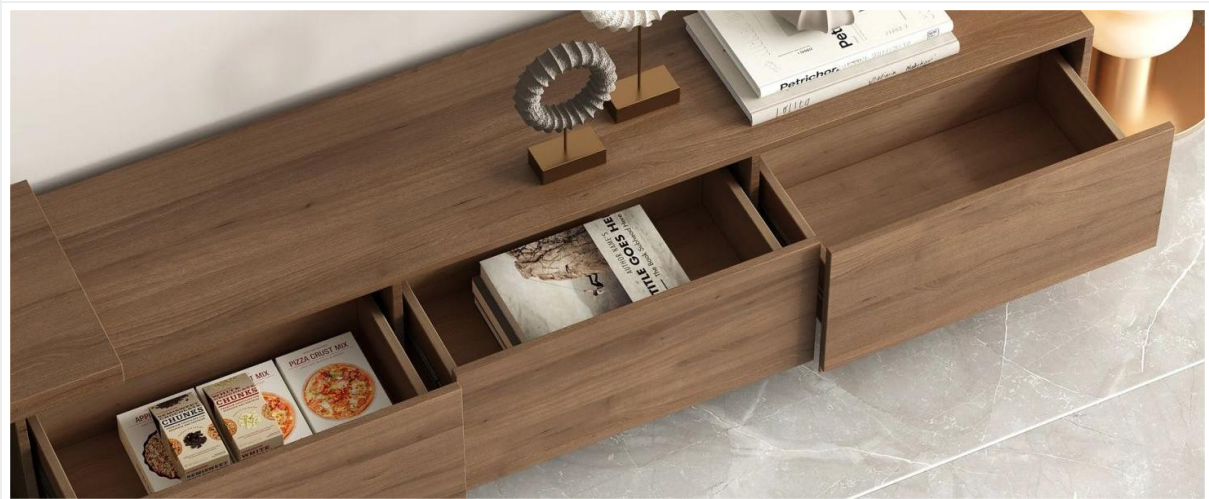
Image 7.2: Information on the E1 Grade MDF Board material used in the TV stand construction.