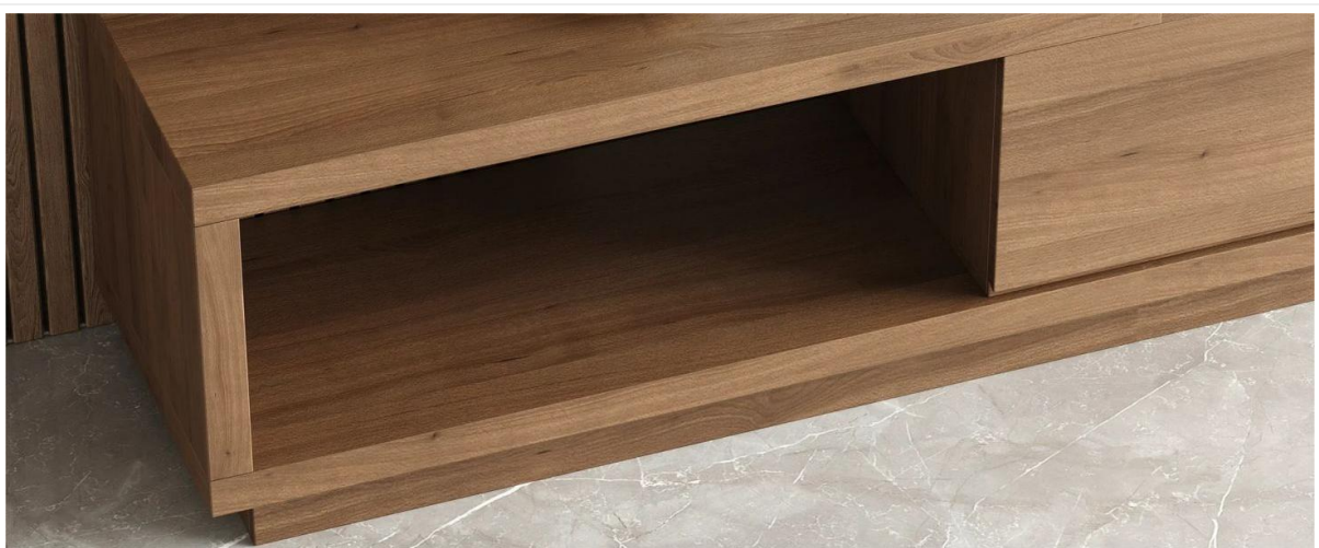
Image 2.2: Key features of the TV stand, including its extendable design and three spacious drawers for storage.