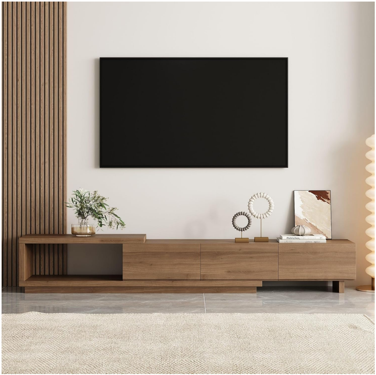
Image 2.1: The Homary Extendable Walnut TV Stand, showcasing its modern design and functionality in a living room environment.