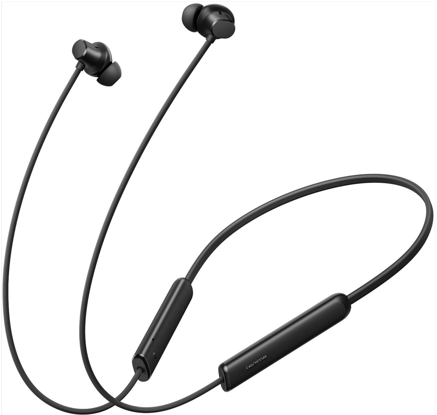
Image: The realme Buds Wireless 5 Lite neckband, USB Type-C charging cable, and various sizes of ear tips.