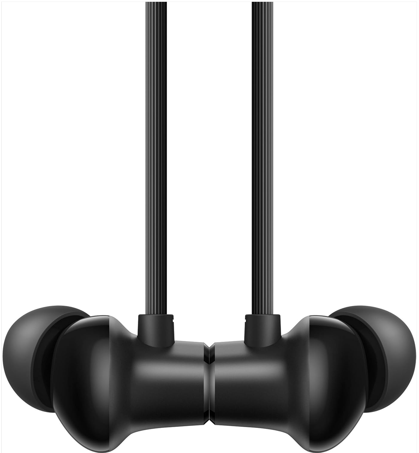
Image: Close-up of the magnetic earbuds, demonstrating how they connect for secure storage.