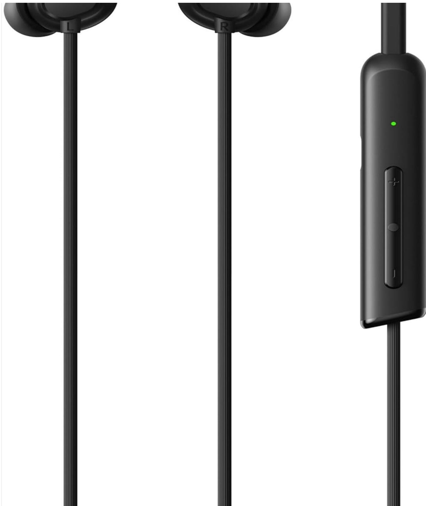
Image: Detailed view of the in-line control module, showing the volume up/down buttons and the multi-function button.