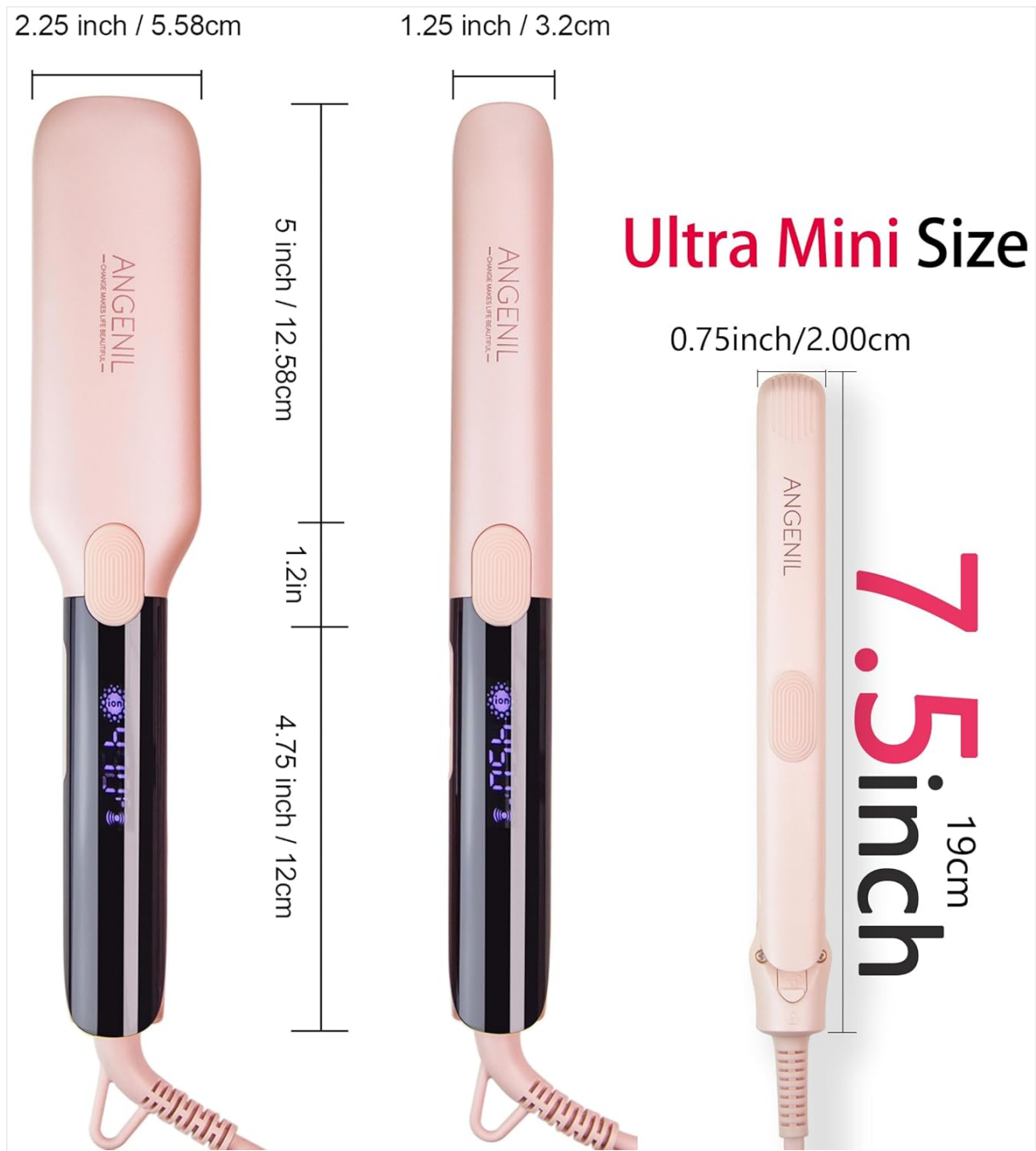
Figure 2: Detailed dimensions of the flat iron, showing its 0.7-inch plate width and overall length for precise styling.