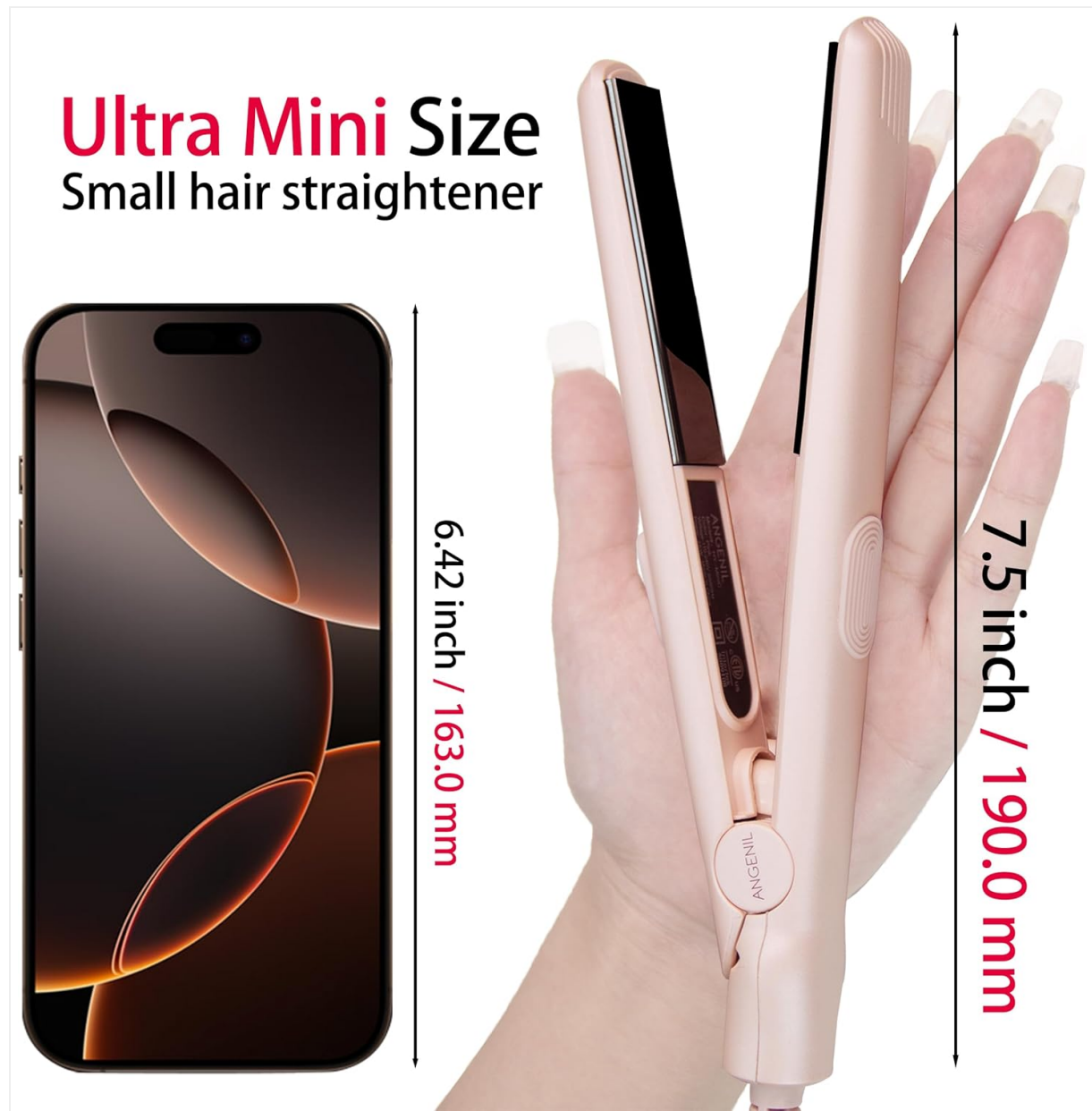
Figure 1: Size comparison of the ANGENIL Ultra Mini Flat Iron, highlighting its compact design for portability.