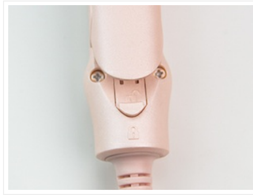
Figure 7: The safety lock ensures the flat iron remains closed, protecting the plates and making it compact for storage.