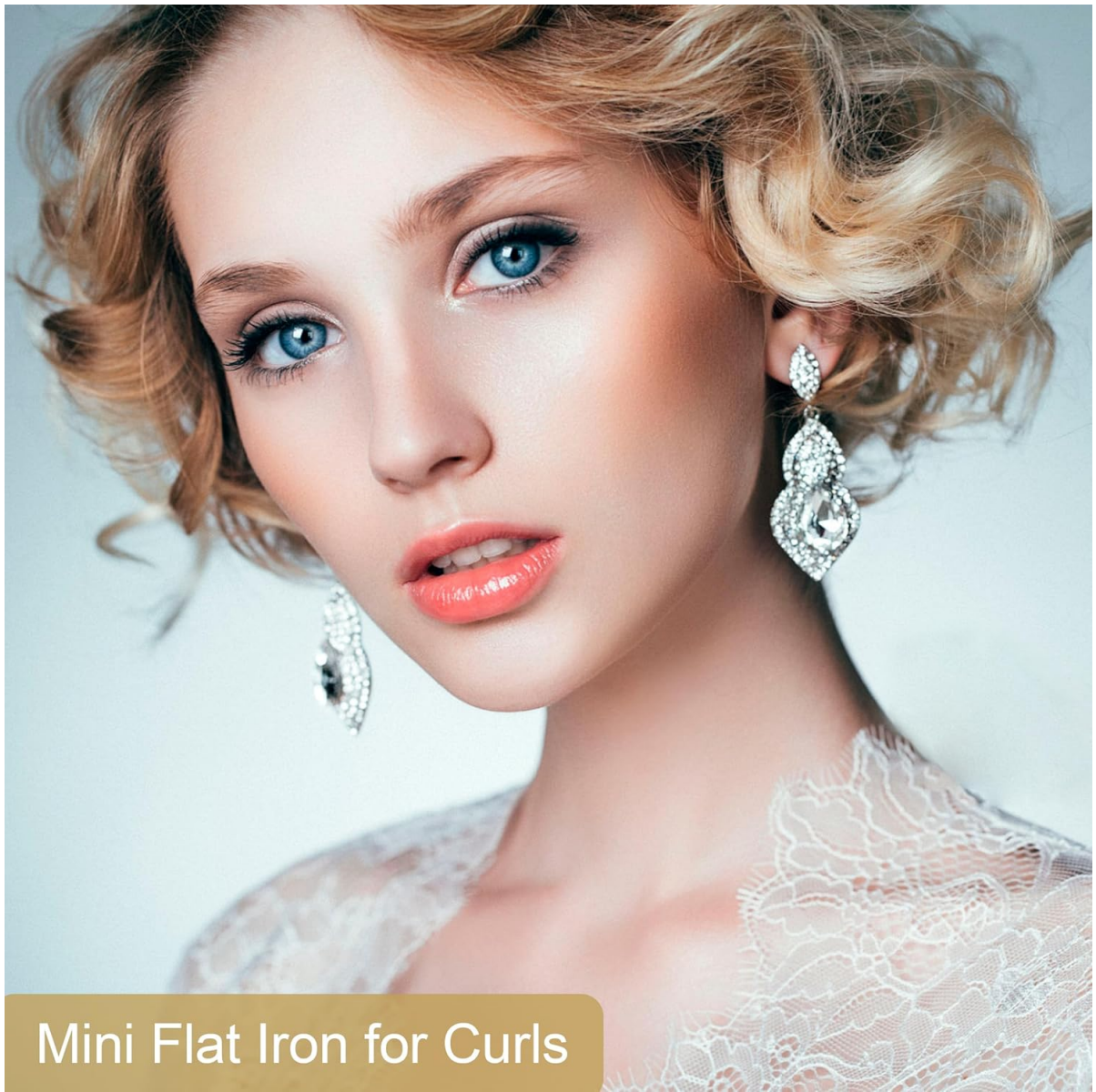
Figure 6: A user curling hair, showcasing the versatility of the mini flat iron for creating waves and curls.