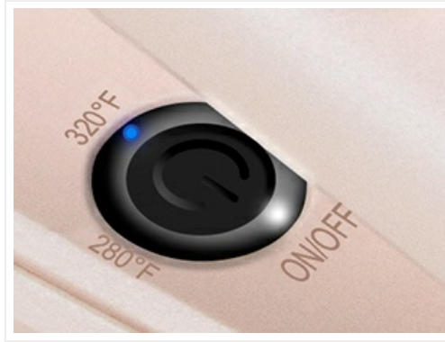
Figure 4: The power button and temperature indicators for easy selection of desired heat level.