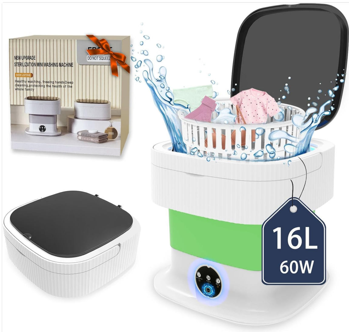
Figure 1: YLTIMER 16L Portable Folding Washing Machine, illustrating its compact folded state and expanded operational state.

The YLTIMER 16L Portable Folding Washing Machine is designed for washing small clothing items such as underwear, socks, baby clothes, and towels. Its foldable design allows for convenient storage and portability.