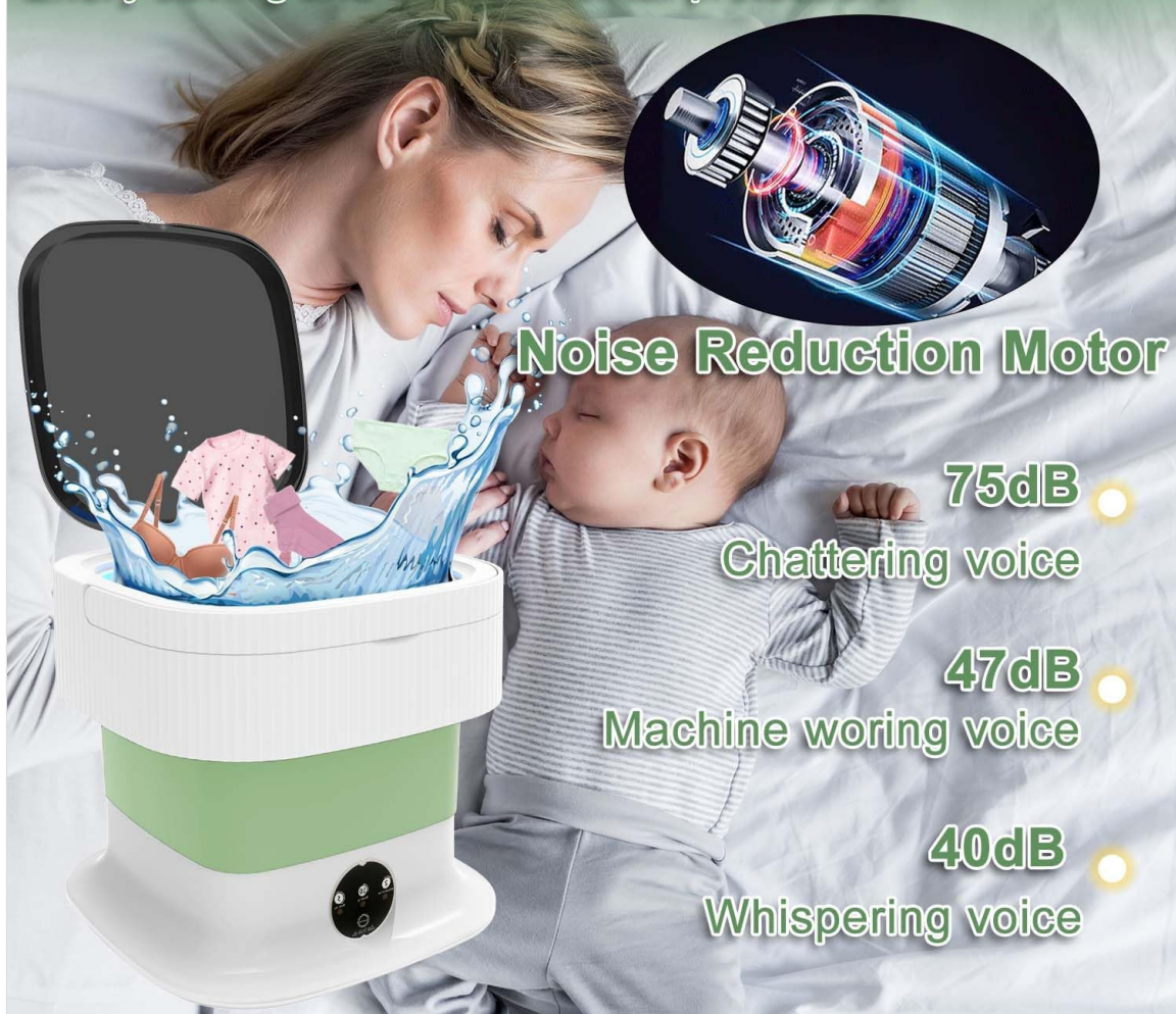
Figure 5: The machine features a noise reduction motor, operating at low decibel levels (e.g., 47dB for machine working voice, compared to 75dB chattering voice and 40dB whispering voice), ensuring quiet operation suitable for use near sleeping individuals.

Energy saving and environmental protection