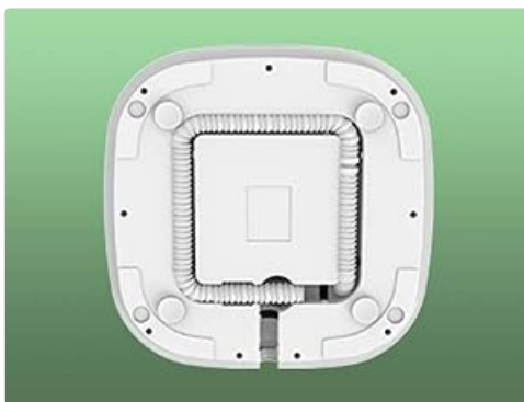
Figure 7: The bottom of the washing machine, revealing the neatly stored drain hose, which can be easily pulled out for use and tucked away for storage.