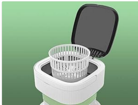
Figure 8: The interior of the washing machine, showing the removable spin basket in place for dehydration.