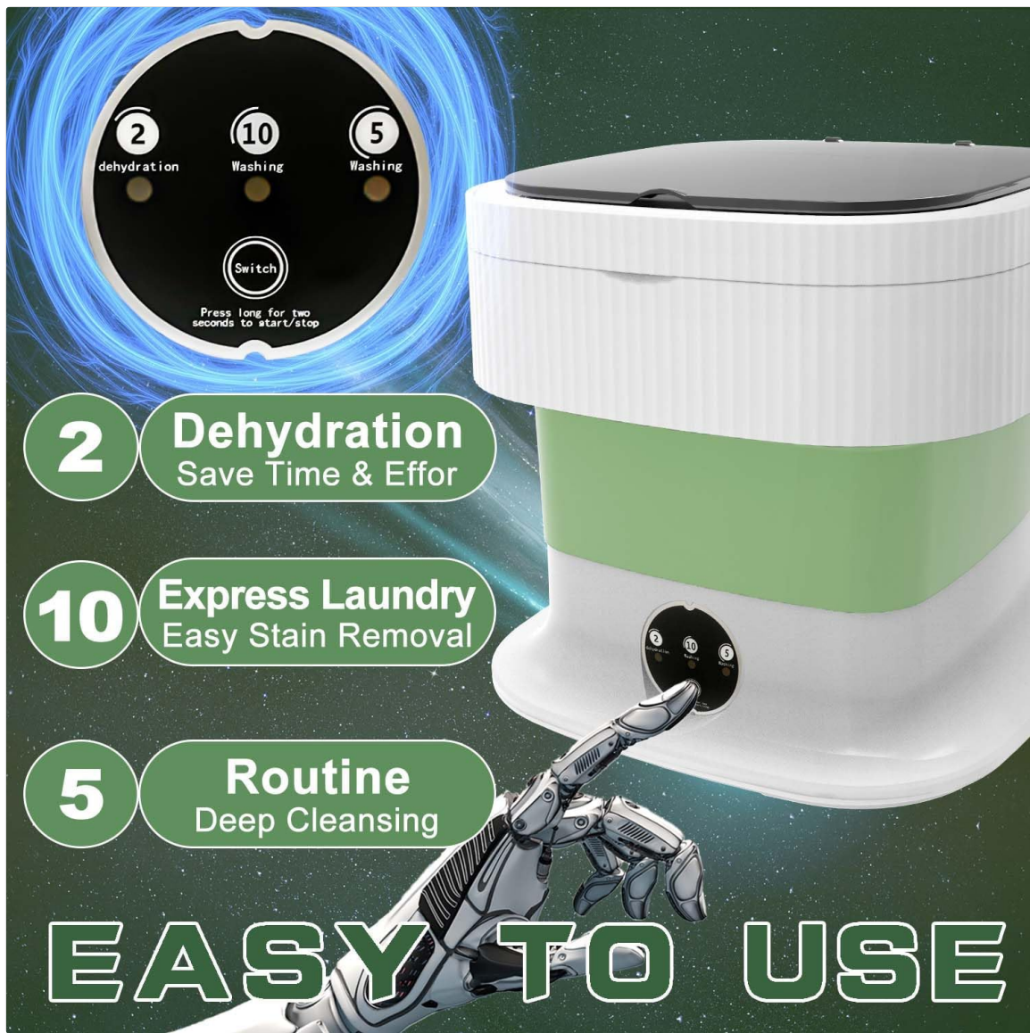
Figure 3: The intuitive electronic control panel, offering three distinct cleaning modes: 2-minute dehydration, 10-minute express laundry, and 5-minute routine deep cleansing. A long press on the 'Switch' button initiates or stops the operation.