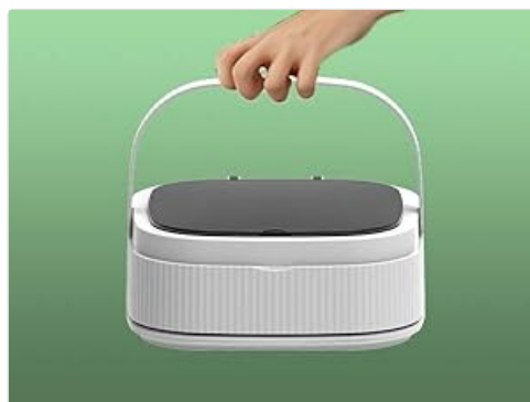
Figure 6: The washing machine in its compact, folded state, equipped with a handle for easy transport.