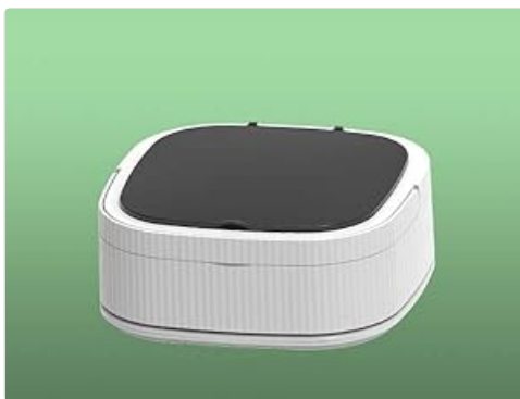
Figure 9: The washing machine fully folded, ready for compact storage.