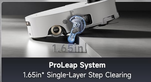
ProLeap System 1.65in* Single-Layer Step Clearing