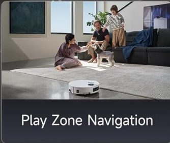
Play Zone Navigation