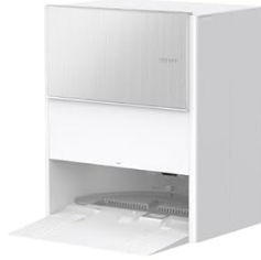
Base Station x1