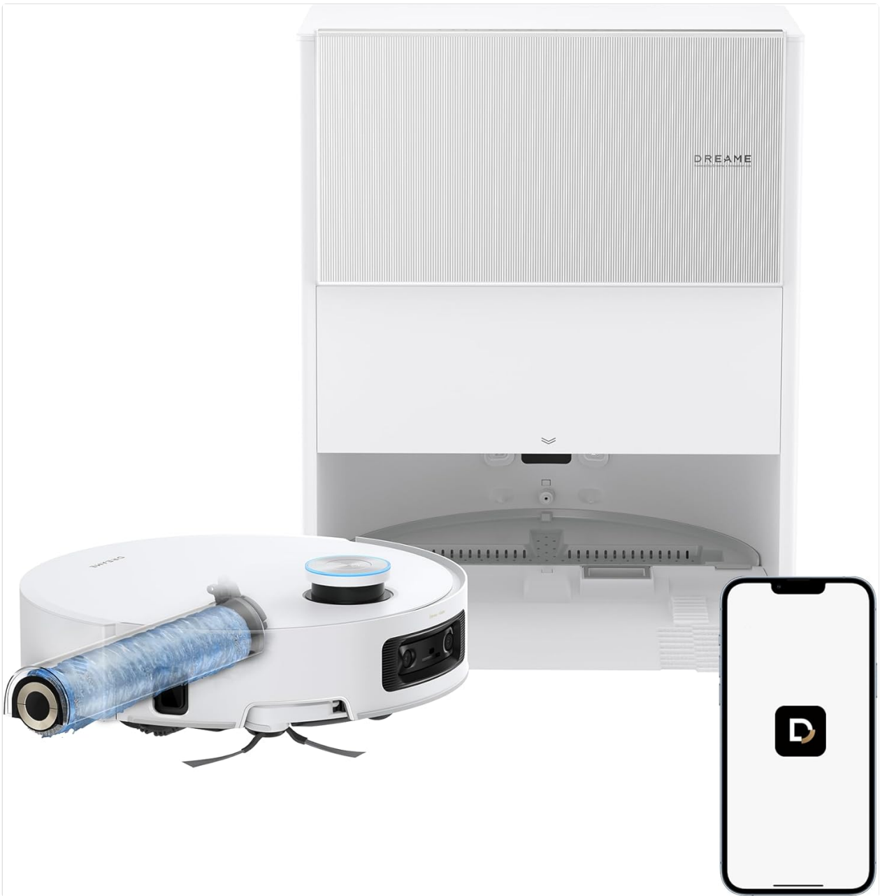
Image: The DREAME Aqua10 Ultra Roller Robot Vacuum and Mop, shown with its self-cleaning base station and a smartphone displaying the control application.