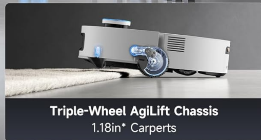
Triple-Wheel AgiLift Chassis 1.18in* Carpets

*Tread pattern of the drive wheels may vary due to batch differences. Please refer to the actual item received. *3.15in, 1.57in, 1.65in: 3.15in refers to the double-layer step's height where the top surface of the lower step is over 3.15in wide. The maximum height for a single step is 1.65in. Based on our in-house lab data. *World's 1st robotic retractable legs: Frost & Sullivan confirmed this based on global robotic vacuum market research. The robotic retractable legs are a dual-joint swing-arm system that simulates the coordinated movement of the human thigh and calf, allowing the robot to overcome obstacles easily. Survey completed in December 2024.