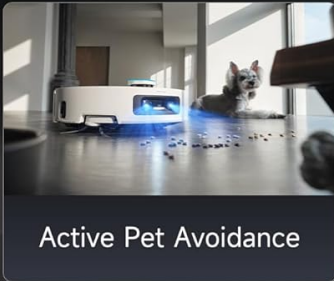
Active Pet Avoidance