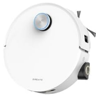
Robot Vacuum x1