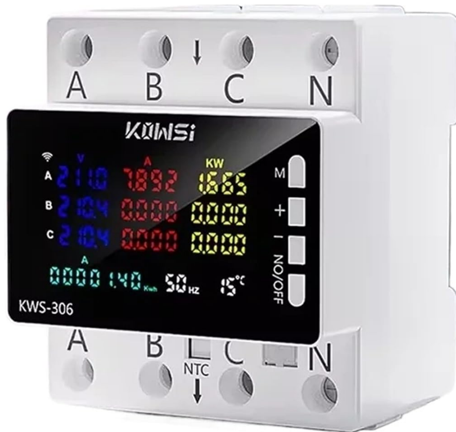
Figure 3.1: KWS-306 Power Meter Front View. This image displays the main unit of the KWS-306, highlighting its vibrant color screen which shows real-time voltage, current, and power readings for three phases (A, B, C). The top and bottom terminals for phase and neutral connections are clearly visible, along with the model number KWS-306 on the lower left of the screen.