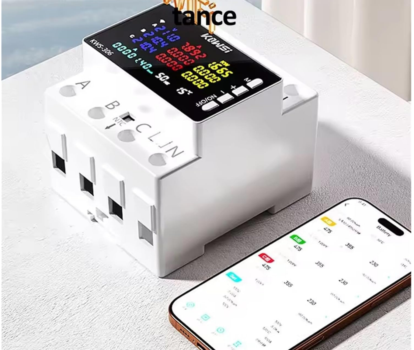
Figure 3.4: Mobile Remote Control Capability. This image shows the KWS-306 meter next to a smartphone displaying an application interface, indicating its capability for mobile remote control over an unlimited distance. Note: This feature is typically available only with the KWS-306WF (Wi-Fi) version, not the standard KWS-306 model.