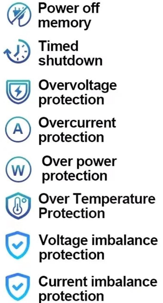
Figure 3.3: Multifunctional Rail Meter Capabilities. This image emphasizes the KWS-306 as a multifunctional rail meter. It reiterates the protection features such as Power off memory, Timed shutdown, Overvoltage protection, Overcurrent protection, Over power protection, Over Temperature Protection, Voltage imbalance protection, and Current imbalance protection, presented with clear icons for each function.