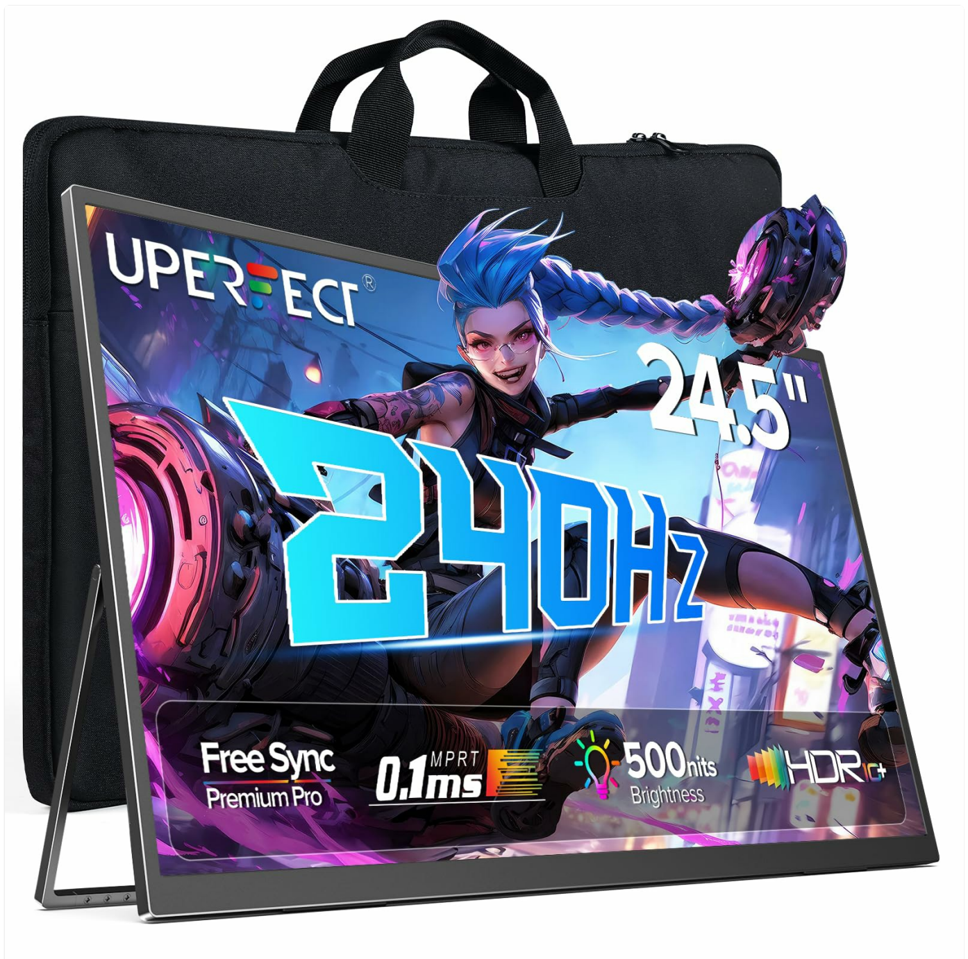
Figure 1: UPERFECT 24.5" Portable Monitor (Model MT03)