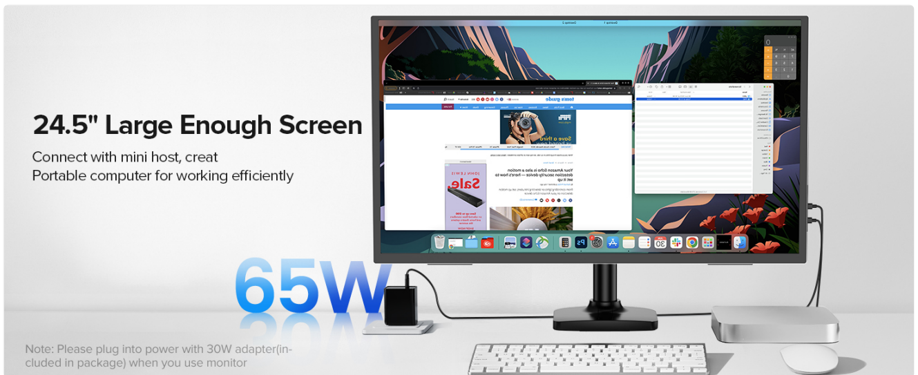
Figure 3: UPERFECT monitor mounted on a VESA-compatible arm.