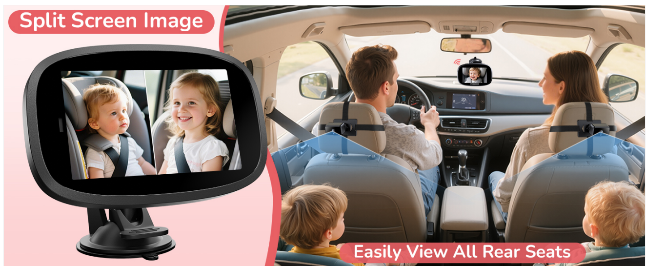
Image: Demonstrates switching between single and split-screen display modes on the monitor.