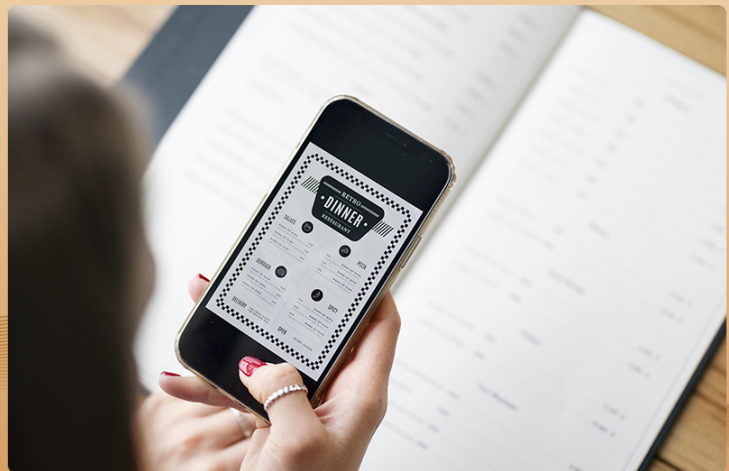
Image: A user translating a menu with their smartphone camera, showcasing the Photo Translation Mode.

La modalità fotocamera traduce istantaneamente testi rilevati tramite obiettivo.