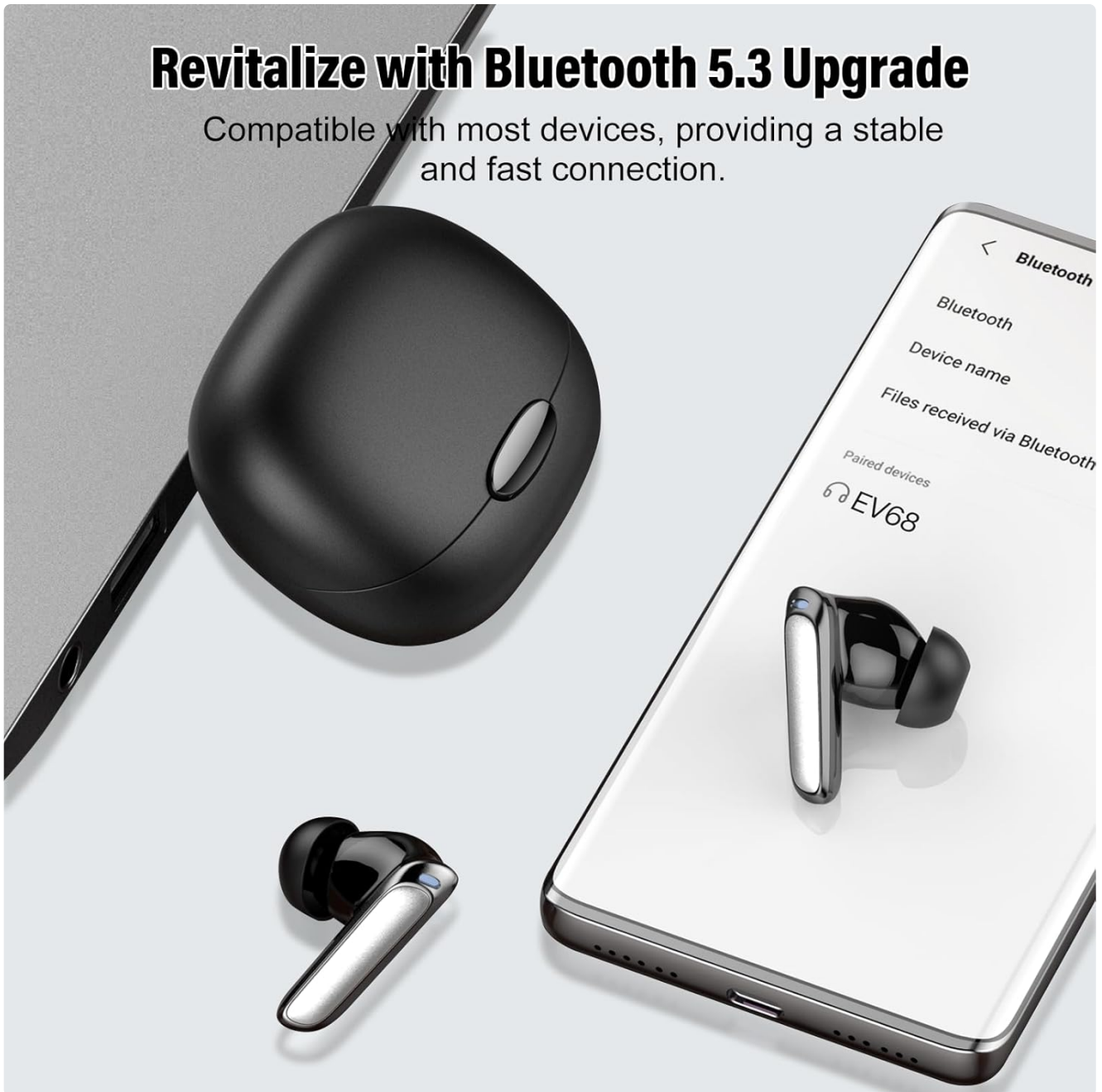
Image: A smartphone screen showing the Bluetooth pairing process, with the EV68 earbuds and their case nearby.

Compatible with most devices, providing a stable and fast connection.