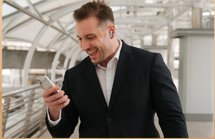
Image: A man engaging with his smartphone, representing the AI Conversation Mode for receiving intelligent answers.

Attiva la "Modalità Conversazione AI" nell'app per risposte immediate a domande quotidiane o professionali.