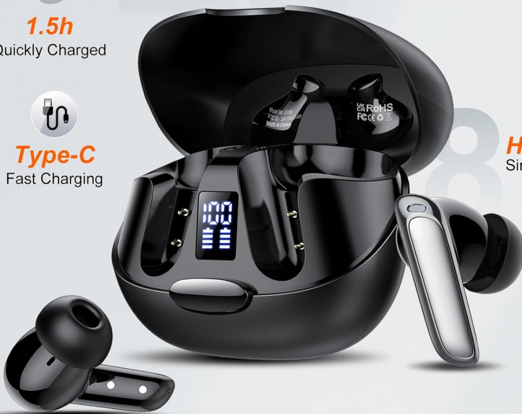
Image: Visual representation of the battery life: 8 hours on a single charge, up to 48 hours with the charging case, and 1.5 hours for a full USB-C charge.