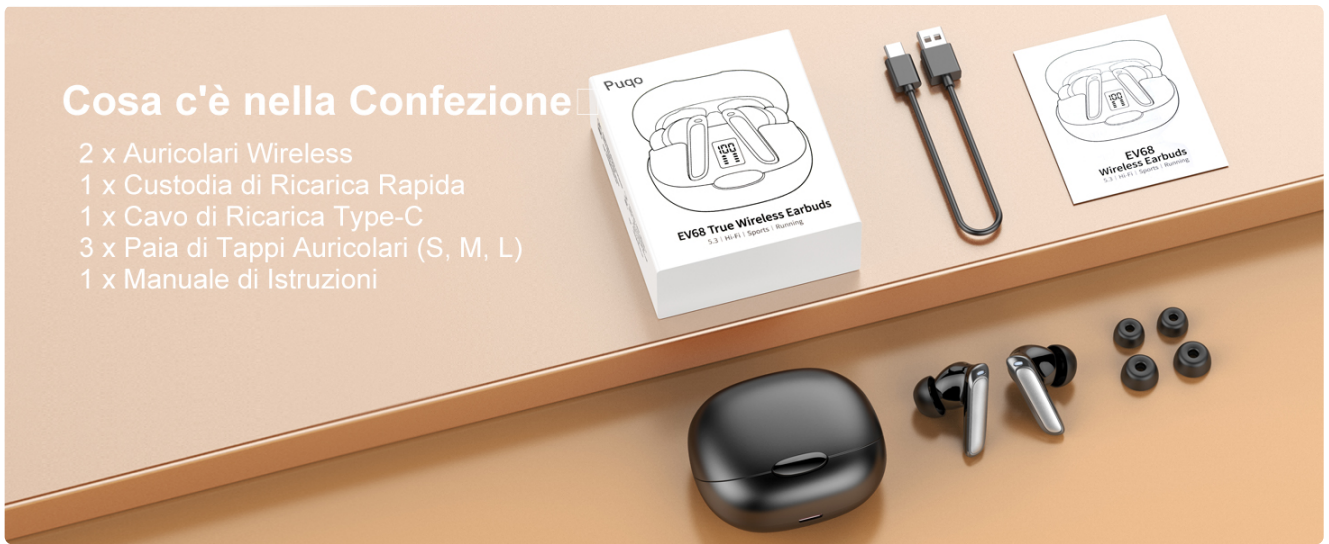
Image: The package contents, showing the earbuds, charging case, USB-C cable, three sizes of eartips, and the instruction manual.