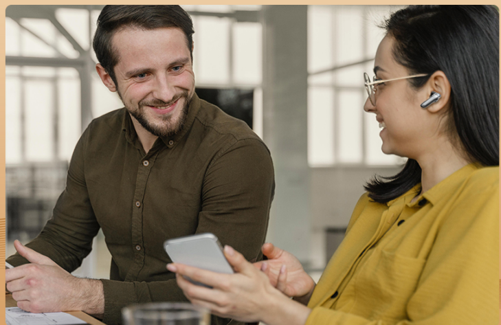
Image: A scenario depicting the Earbud + Smartphone Mode, where one person uses an earbud and the other interacts via a smartphone for translation.

Un utente fa doppio clic sull'auricolare, l'altro tocca il pulsante sull'app: conversazione bidirezionale semplice e veloce.