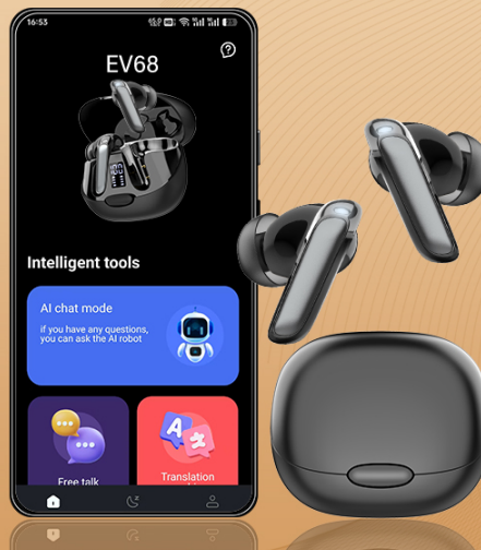
Image: Instructions for downloading the 'Ear Dance' app and connecting the earbuds, showing the app interface and the earbuds.