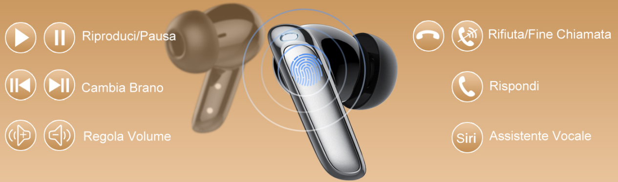
Image: A visual guide to the touch controls on the earbuds, detailing actions for music playback, call management, and voice assistant activation.