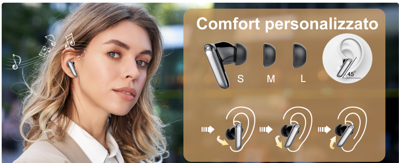
Image: A woman wearing an earbud, accompanied by diagrams illustrating the different eartip sizes and the correct 45-degree insertion for personalized comfort.