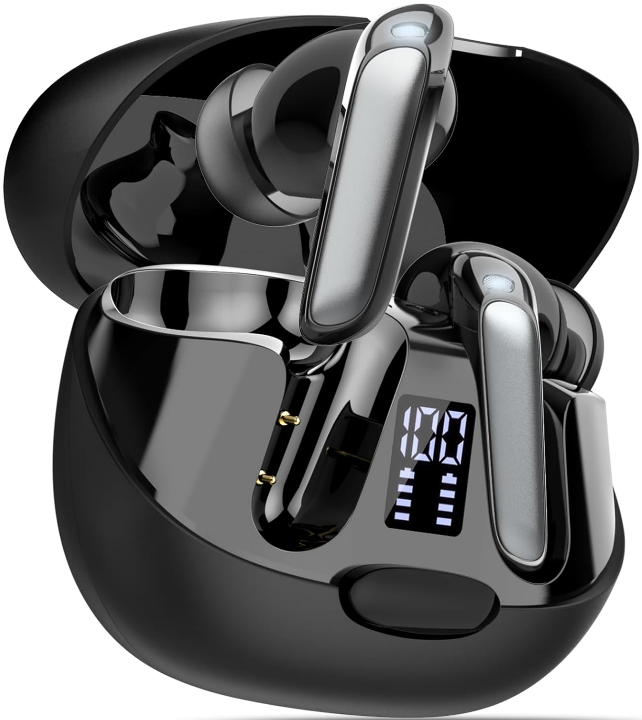
Image: The Puqo EV68 earbuds resting in their charging case, which shows a digital battery percentage display.