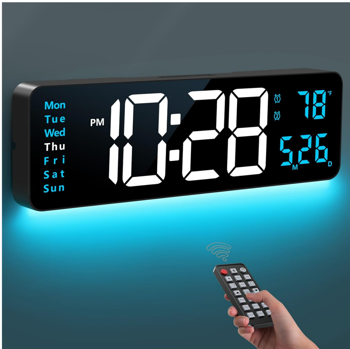
Image: The Hournor Digital Wall Clock Model 6658 displaying time, day, date, and temperature, with a remote control in the foreground.