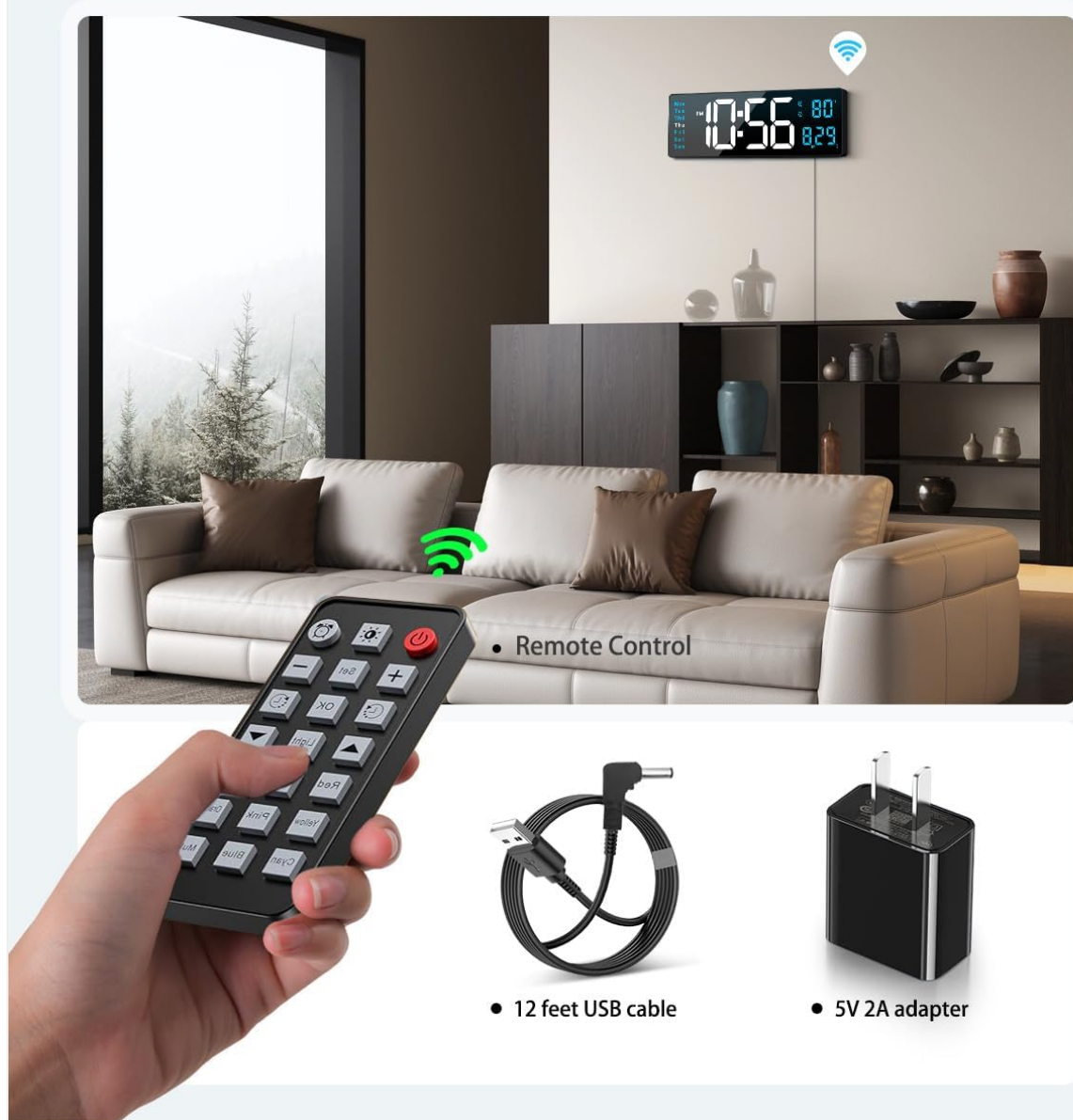
Image: The digital wall clock, its remote control, a USB cable, and a power adapter, representing the package contents.

Operate all settings effortlessly from your seat - no need to touch the clock. Includes a 12 feet USB cable and an 5V2A adapter.