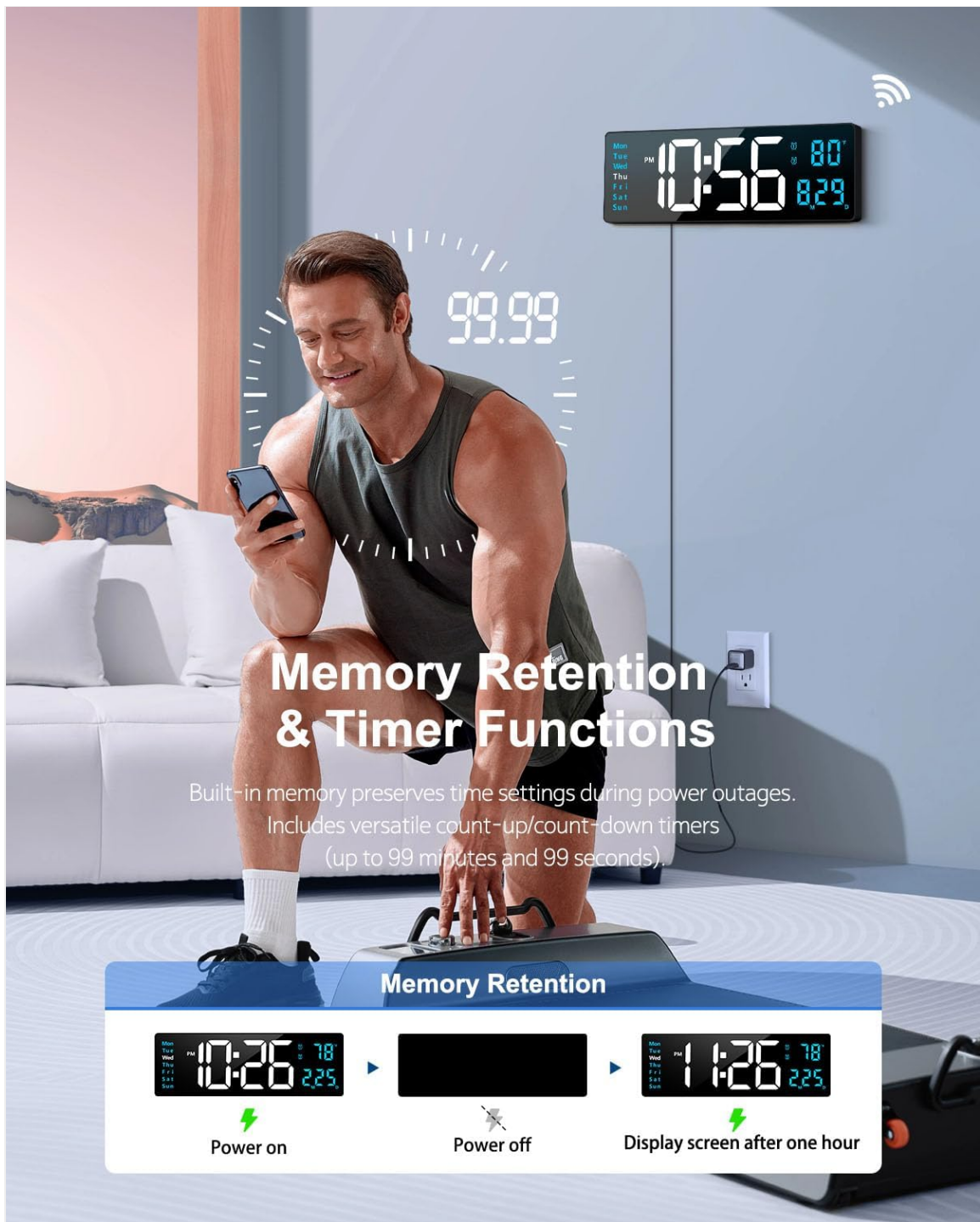
Image: A person using the clock's timer function during exercise. An inset shows the clock's memory retention feature: displaying time, then off during power loss, then displaying time again after power is restored.