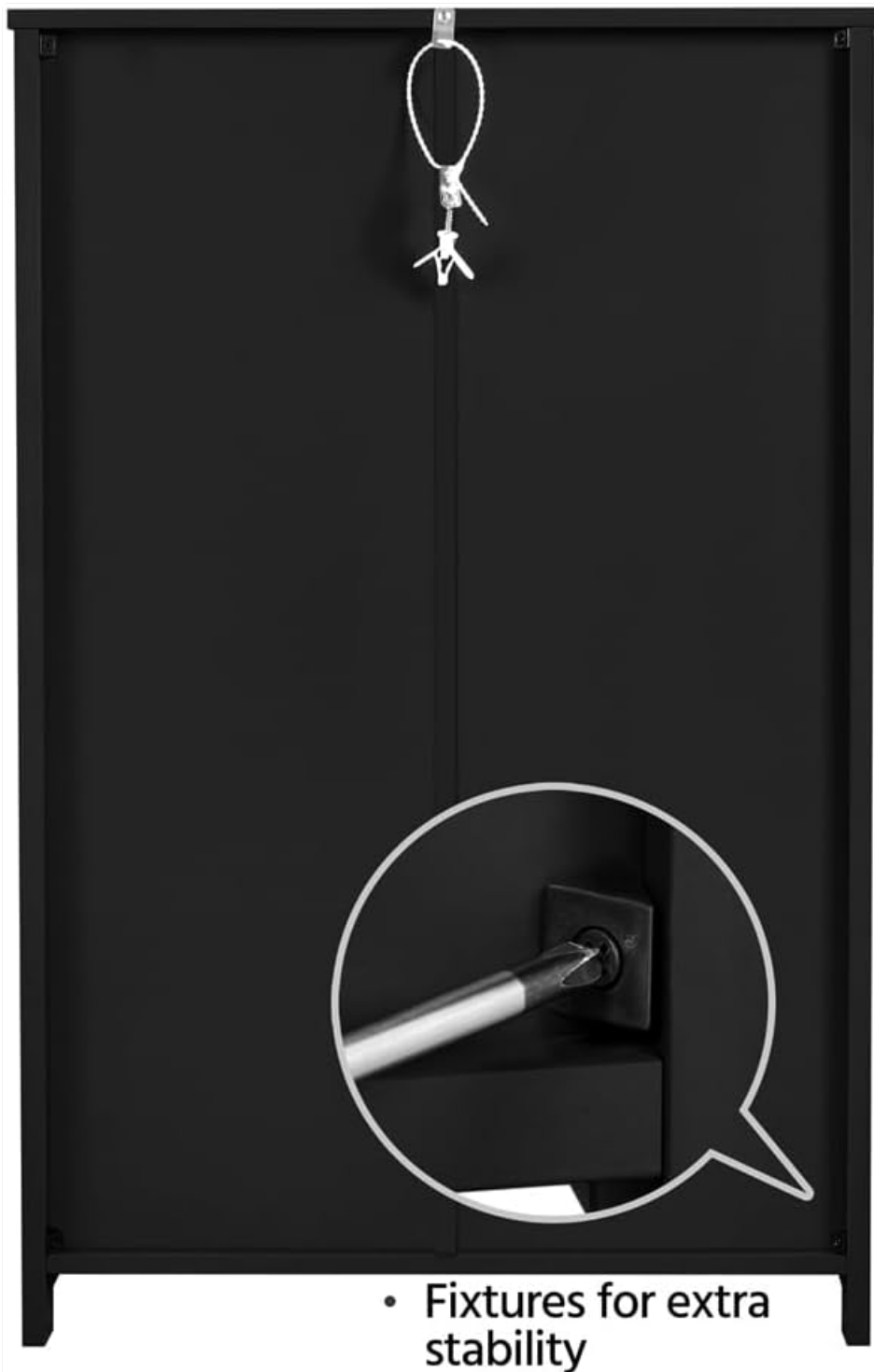
Image: Detail of the fixtures used to secure the back panel, contributing to the overall stability of the cabinet.