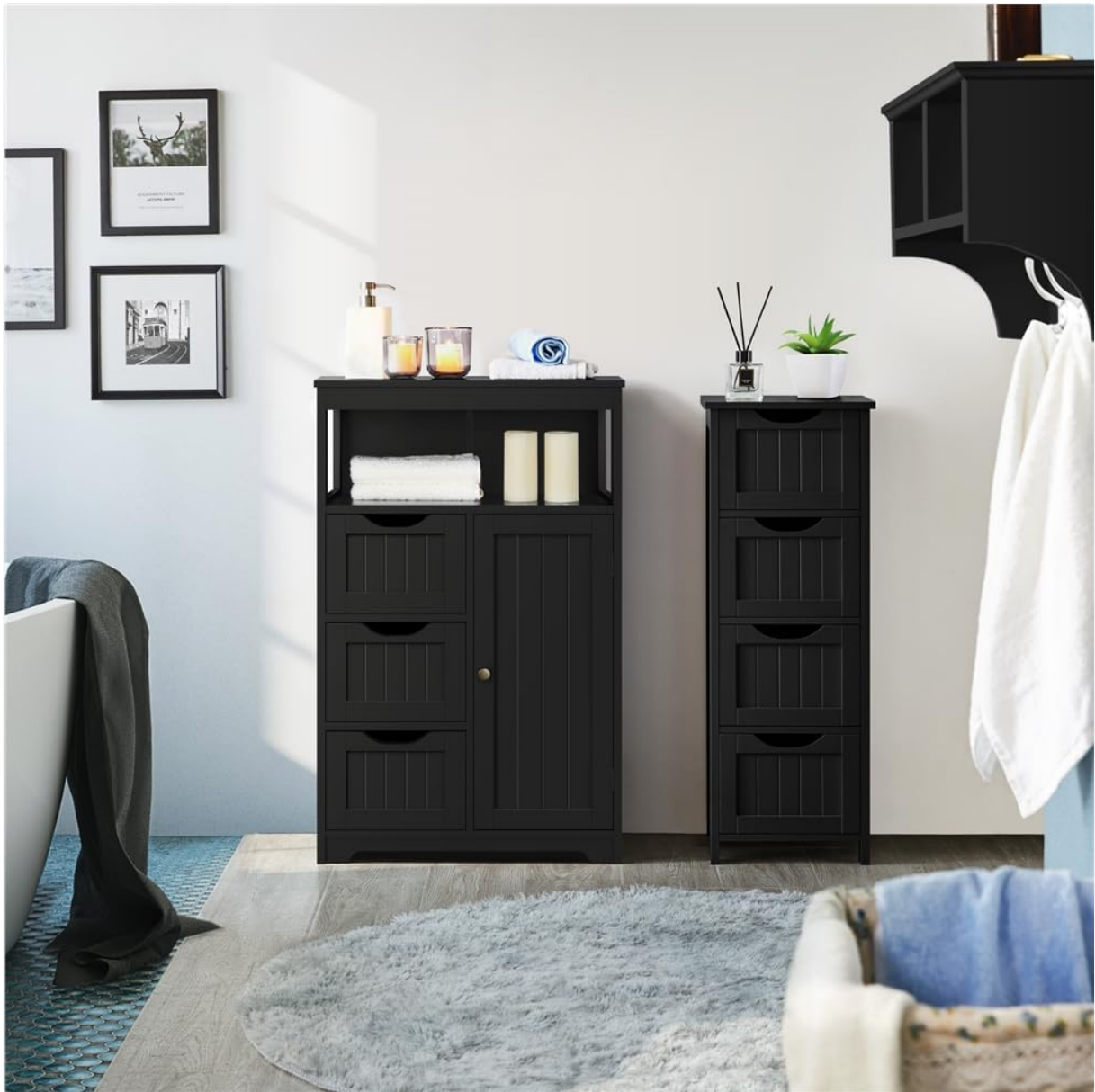
Image: The Yaheetech Bathroom Cabinet (left) and a matching narrow cabinet (right) in a modern bathroom setting, showcasing its design and potential placement.