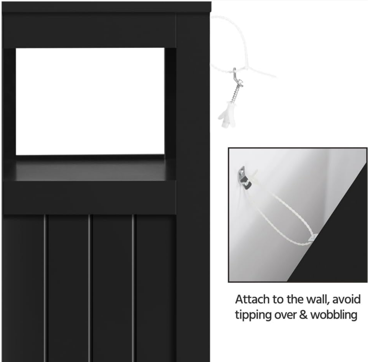
Image: Illustration showing how to attach the anti-tipping strap to the wall to prevent the cabinet from wobbling or tipping over.