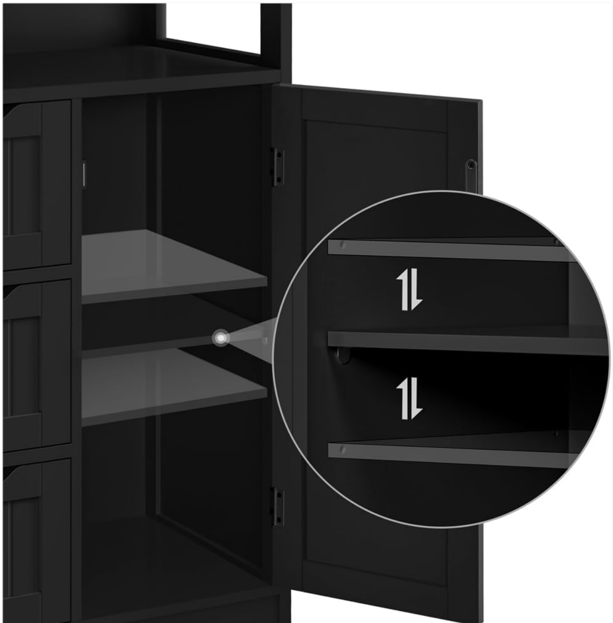
Image: Detail showing the adjustable shelf within the cabinet, highlighting the different height options for flexible storage.