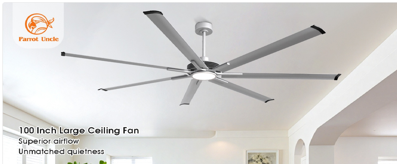
Image: The 100-inch ceiling fan installed in a spacious living area, highlighting its high efficiency and powerful 11,500 CFM airflow for optimal air circulation.

This 100-inch ceiling fan is designed for large spaces, featuring 7 aerodynamic aluminum blades that deliver a powerful 11,500 CFM airflow. It includes an energy-saving DC motor, a dimmable LED light with 3 color temperatures, and a multi-functional remote control for convenient operation. The fan also offers reversible airflow for year-round comfort.