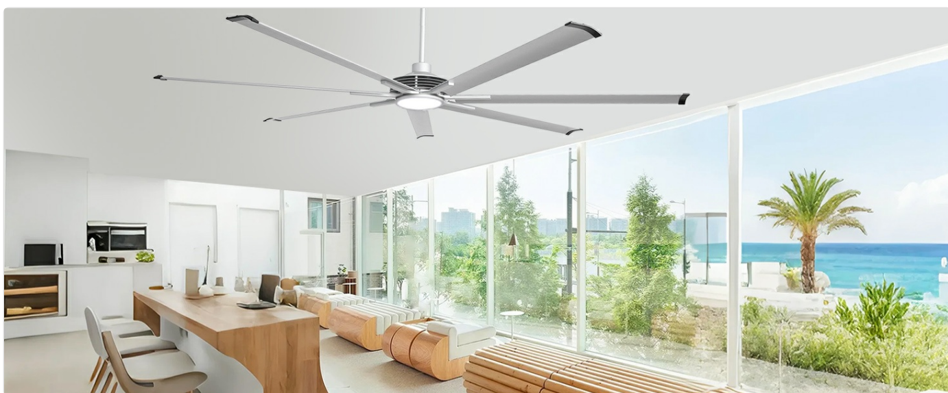
Image: A visual representation of the fan's reversible motor, showing counter-clockwise rotation for a summer breeze and clockwise rotation for winter warmth, contributing to energy savings.