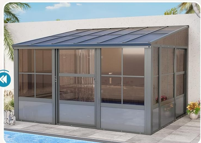
Image: Illustrates the sunroom in fully open (ventilated), half-open (sun protection), and fully closed (privacy) configurations, showcasing its versatility.