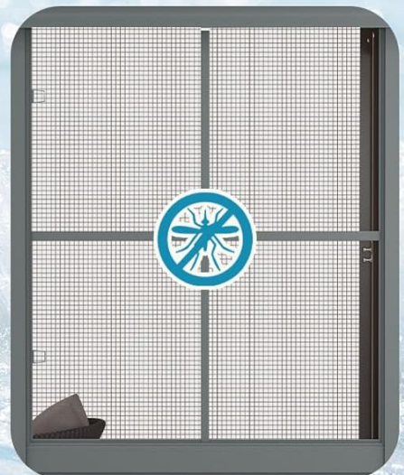
Image: Shows the movable window panels and fixed mesh screens, highlighting their function in providing ventilation while keeping insects out. The windows can be adjusted to suit different environmental conditions.