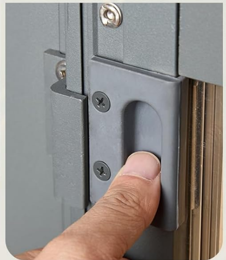
Image: Illustrates the sliding door mechanism with a close-up of the locking feature. The doors provide secure access and allow for seamless indoor-outdoor flow.