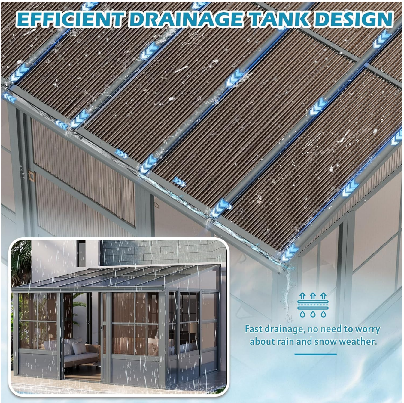
Image: Depicts the efficient drainage tank design of the sunroom roof, showing how water is channeled away to prevent accumulation. This system is integrated into the roof structure for effective water management.