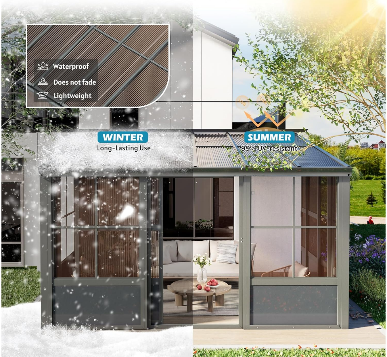
Image: Demonstrates the polycarbonate roof's performance in both winter (snow resistance) and summer (UV resistance). The panels are waterproof, do not fade, are lightweight, and 99% UV-resistant.