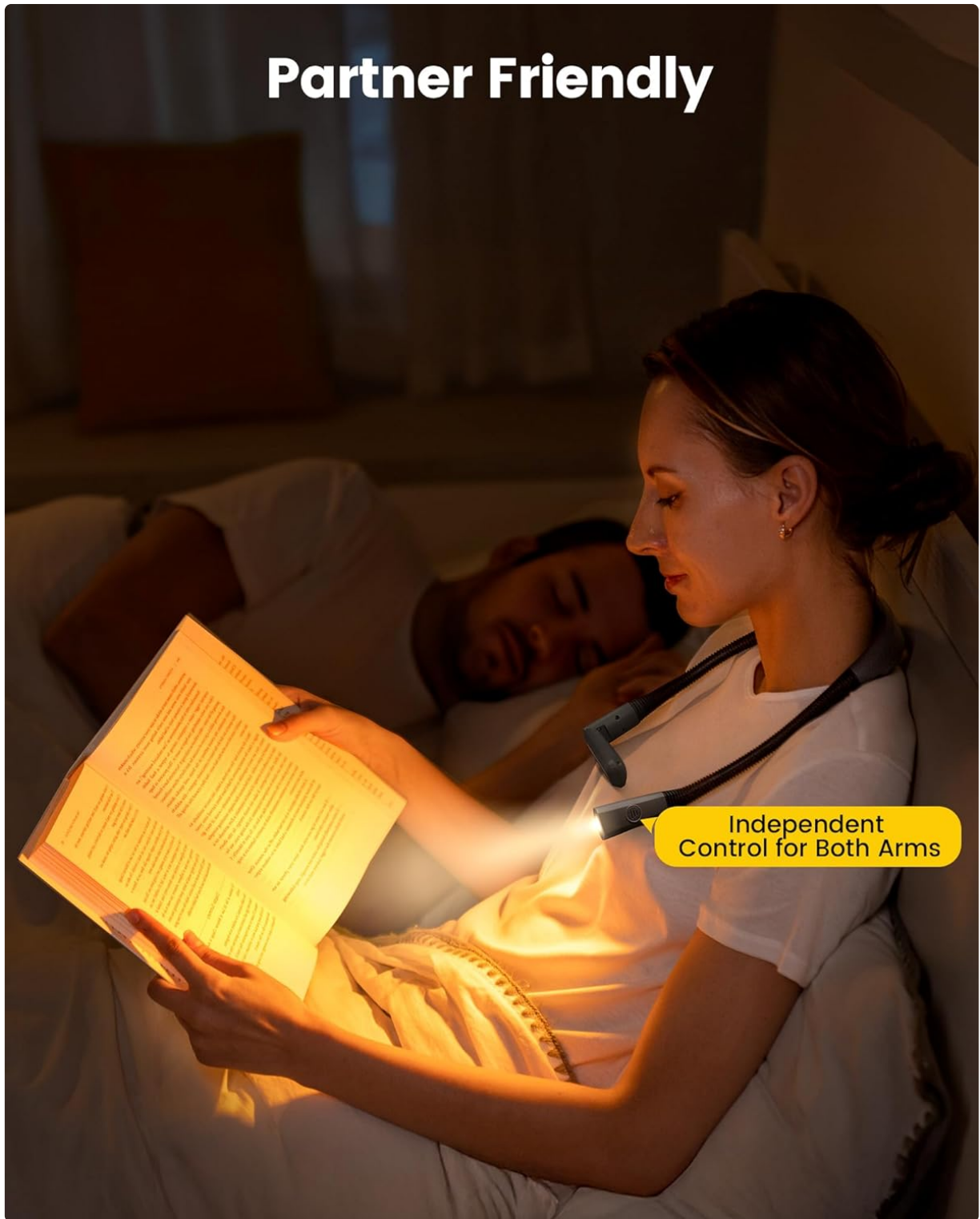
Image: A person wearing the neck light, showcasing its ergonomic and hands-free design.