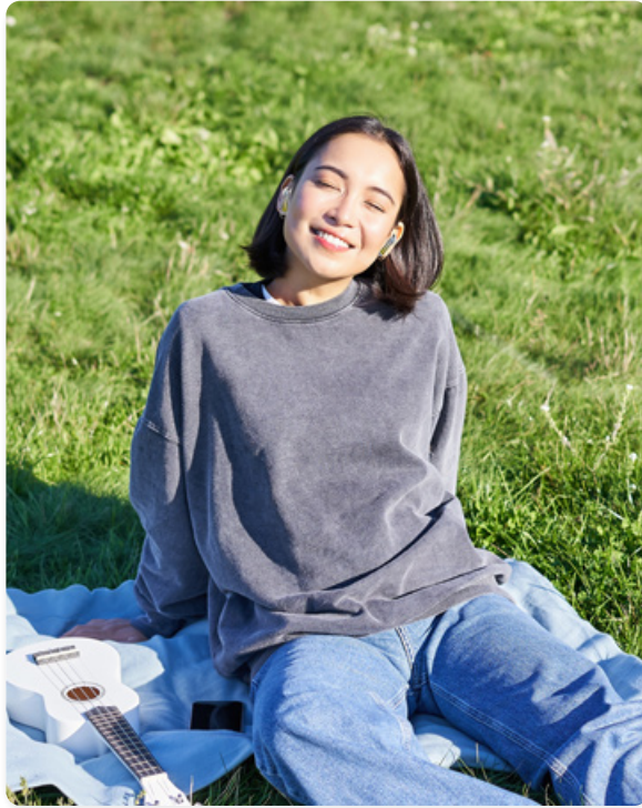
Image: Touch control functions for DUCOCUB J59 Earbuds.

The DUCOCUB J59 earbuds feature intelligent touch controls on each earbud for various functions.