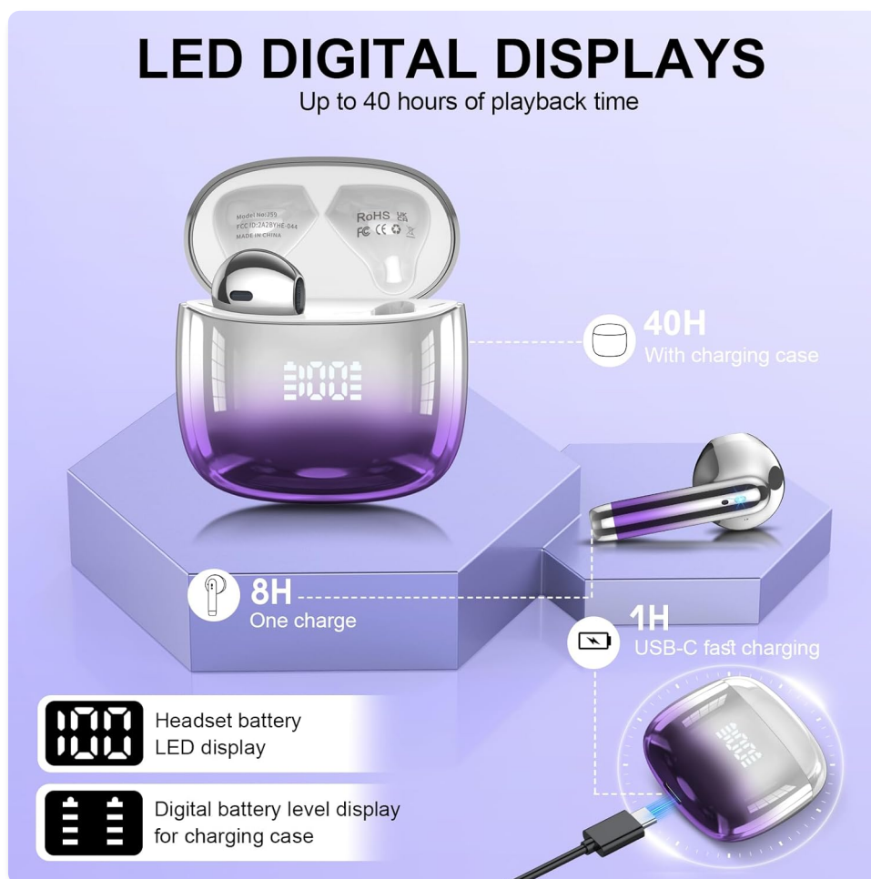
Image: LED digital display and charging information.