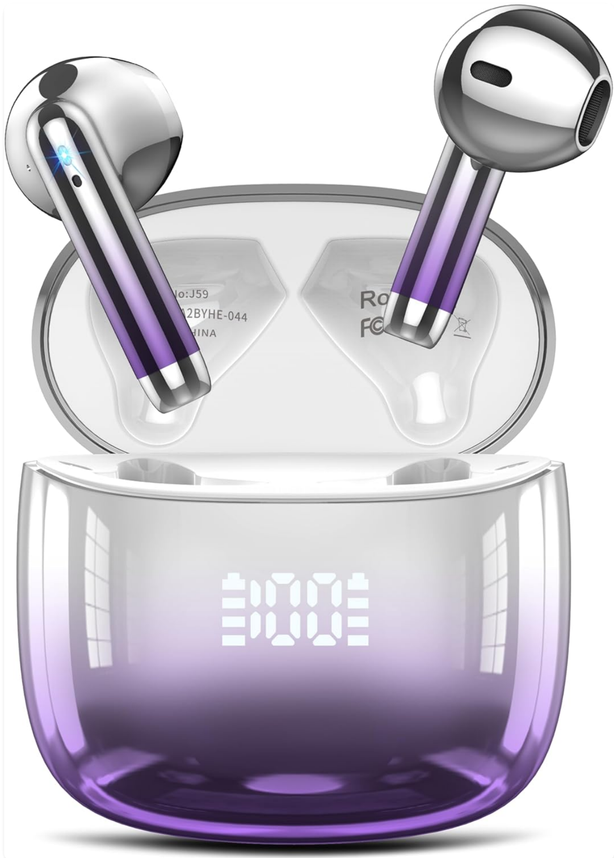
Image: DUCOCUB J59 Wireless Earbuds and charging case.

The DUCOCUB J59 Wireless Earbuds feature an ergonomic design for comfortable wear, a charging case with an LED power display, and intuitive touch controls.