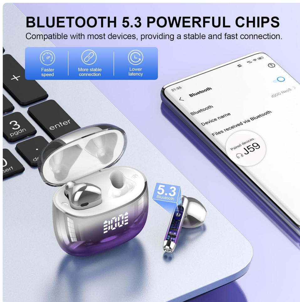
Image: Bluetooth pairing process for DUCOCUB J59 Earbuds.