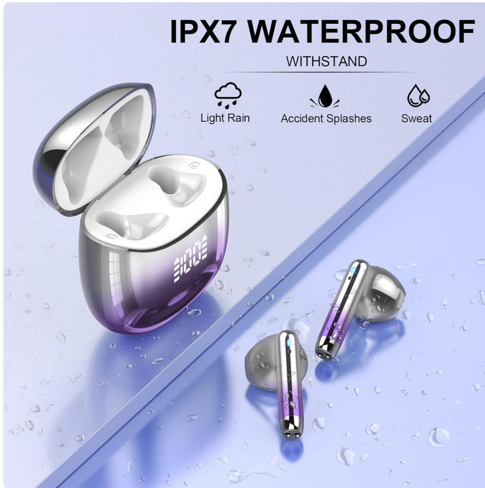
Image: IPX7 Waterproof feature of the earbuds.

up to 1 meter for 30 minutes. This protects them from sweat and light rain.