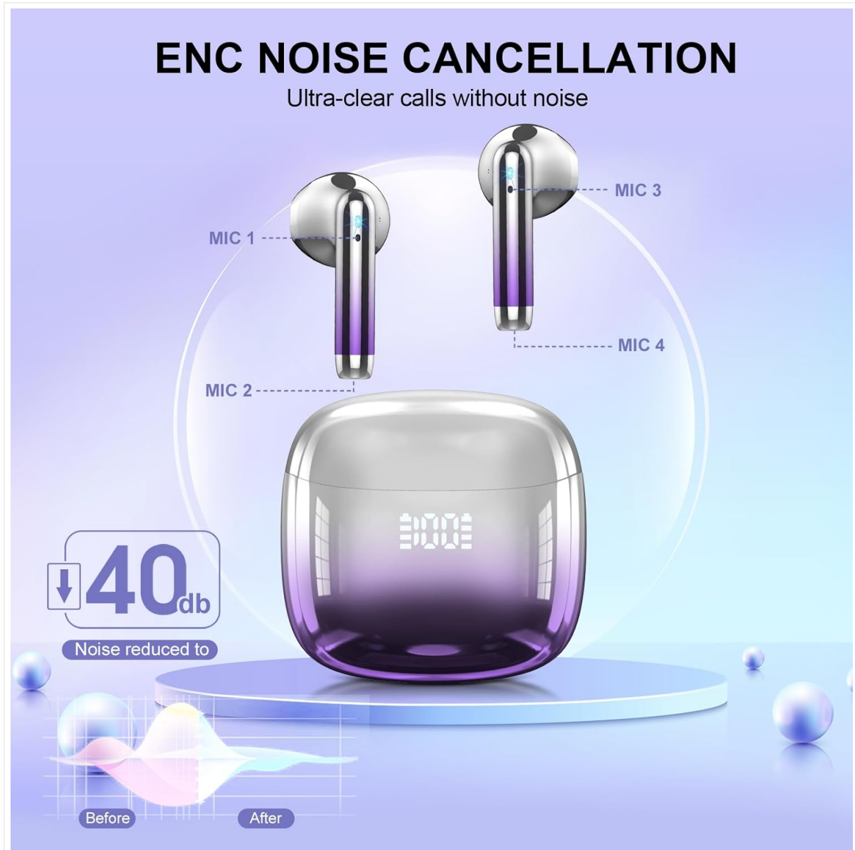
Image: Diagram showing the placement of four microphones on the earbuds, illustrating how ENC (Environmental Noise Cancellation) technology reduces background noise for clearer calls.