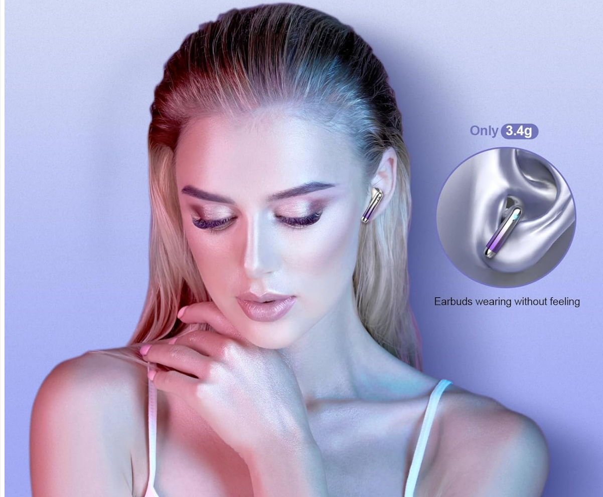
Image: A person wearing the earbuds, demonstrating their secure and comfortable fit. An inset shows a close-up of an earbud with "Only 3.4g" indicating its lightweight design.

Make the wireless earbuds sit comfortably and securely in your ears.