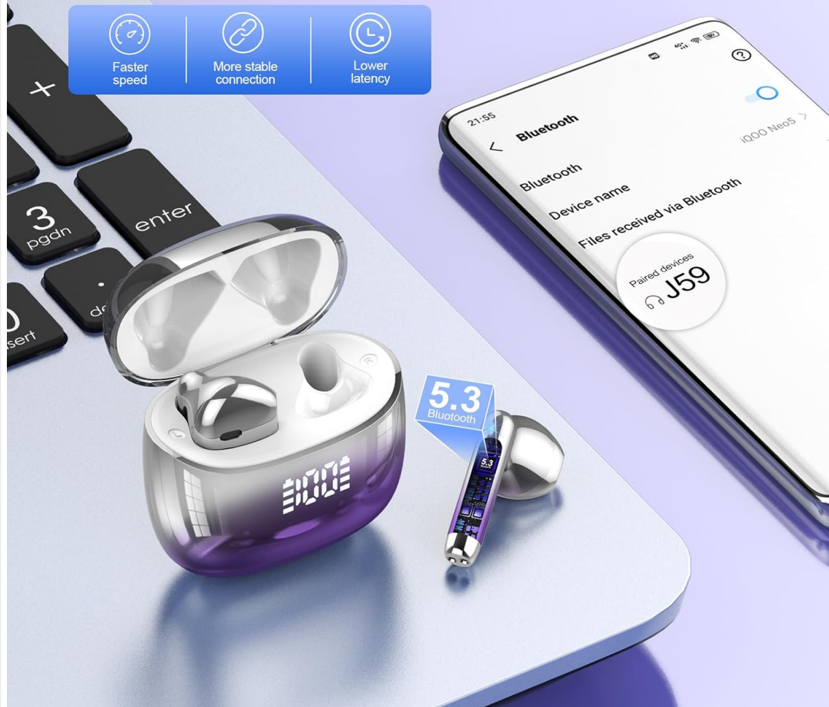
Image: A smartphone screen showing Bluetooth settings with "J59" listed as a paired device. The earbuds and charging case are visible, illustrating the connection process.

Compatible with most devices, providing a stable and fast connection.