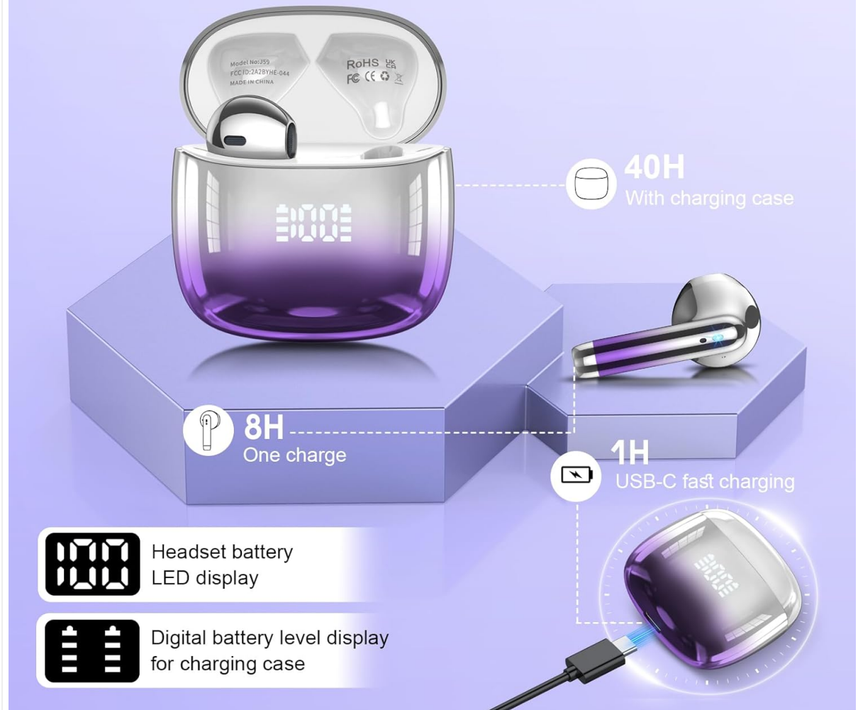
Image: The charging case and earbuds displaying LED battery indicators. The case shows a percentage, and individual earbud icons indicate their charge level. A USB-C cable is shown connected for charging.