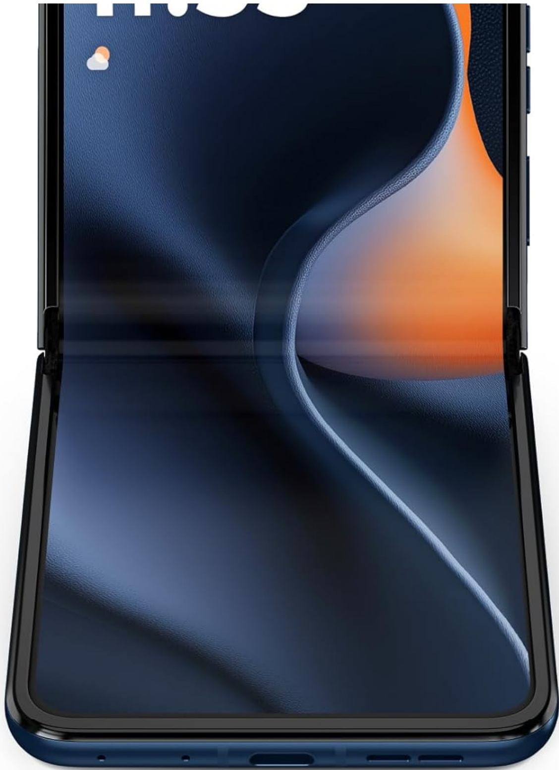
Figure 2: The Motorola Moto Razr 5G 2025 fully unfolded, highlighting its expansive 6.9-inch main display. The 3.6-inch external pOLED display provides quick access to essential information and applications without needing to open the phone. You can check notifications, control music, view weather, and even take selfies using the main camera directly from this external screen.