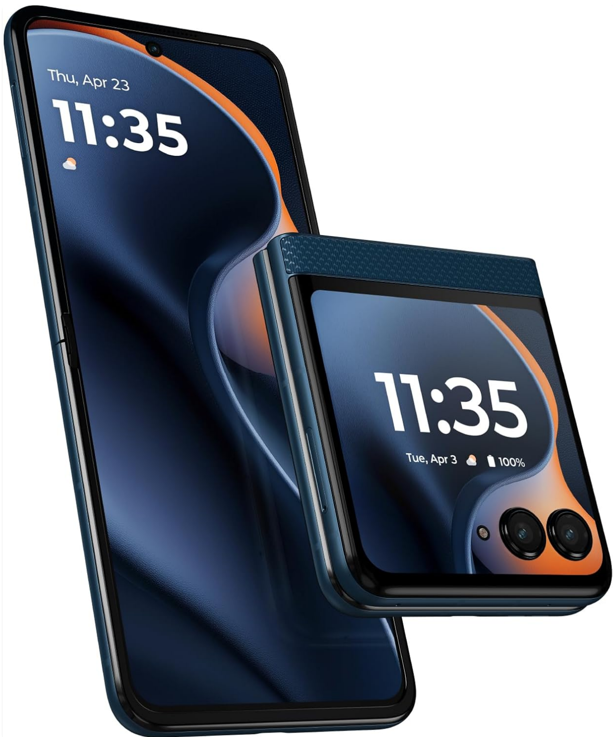
Figure 1: Motorola Moto Razr 5G 2025 in both unfolded and folded states, showcasing its dual-screen design.