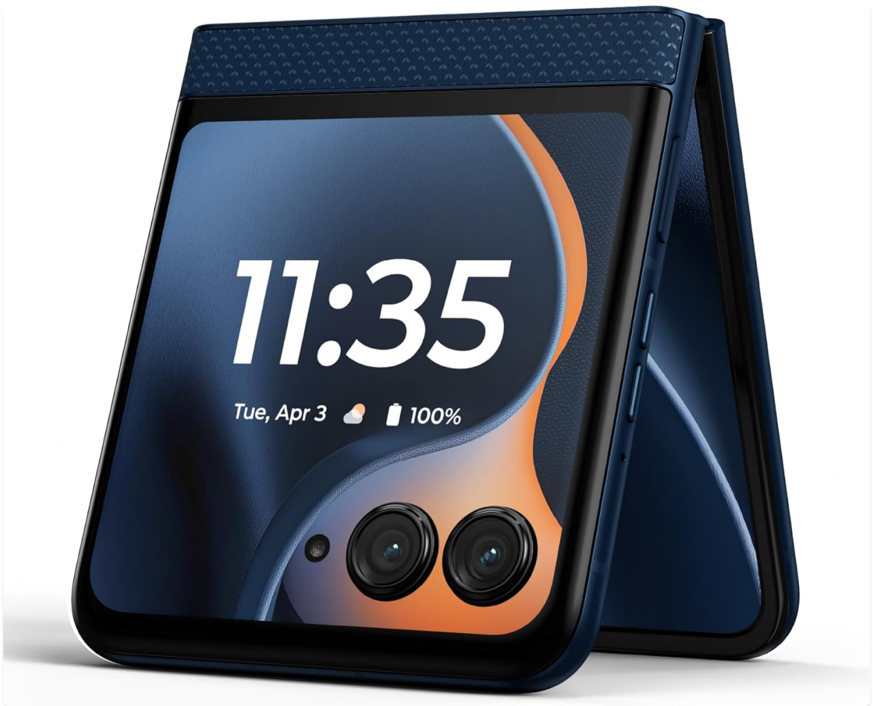
Figure 3: The Motorola Moto Razr 5G 2025 in its folded state, displaying the interactive external screen.