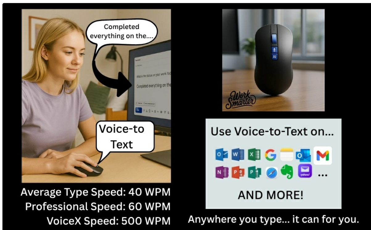
Figure 4: A user demonstrating the Voice-to-Text feature, speaking into the mouse to type on a laptop screen.