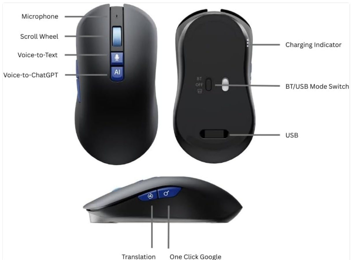
Figure 2: Labeled diagram highlighting the microphone, scroll wheel, Voice-to-Text button, AI button (Voice-to-ChatGPT), Translation button, One-Click Google Search button, Charging Indicator, BT/USB Mode Switch, and USB port.