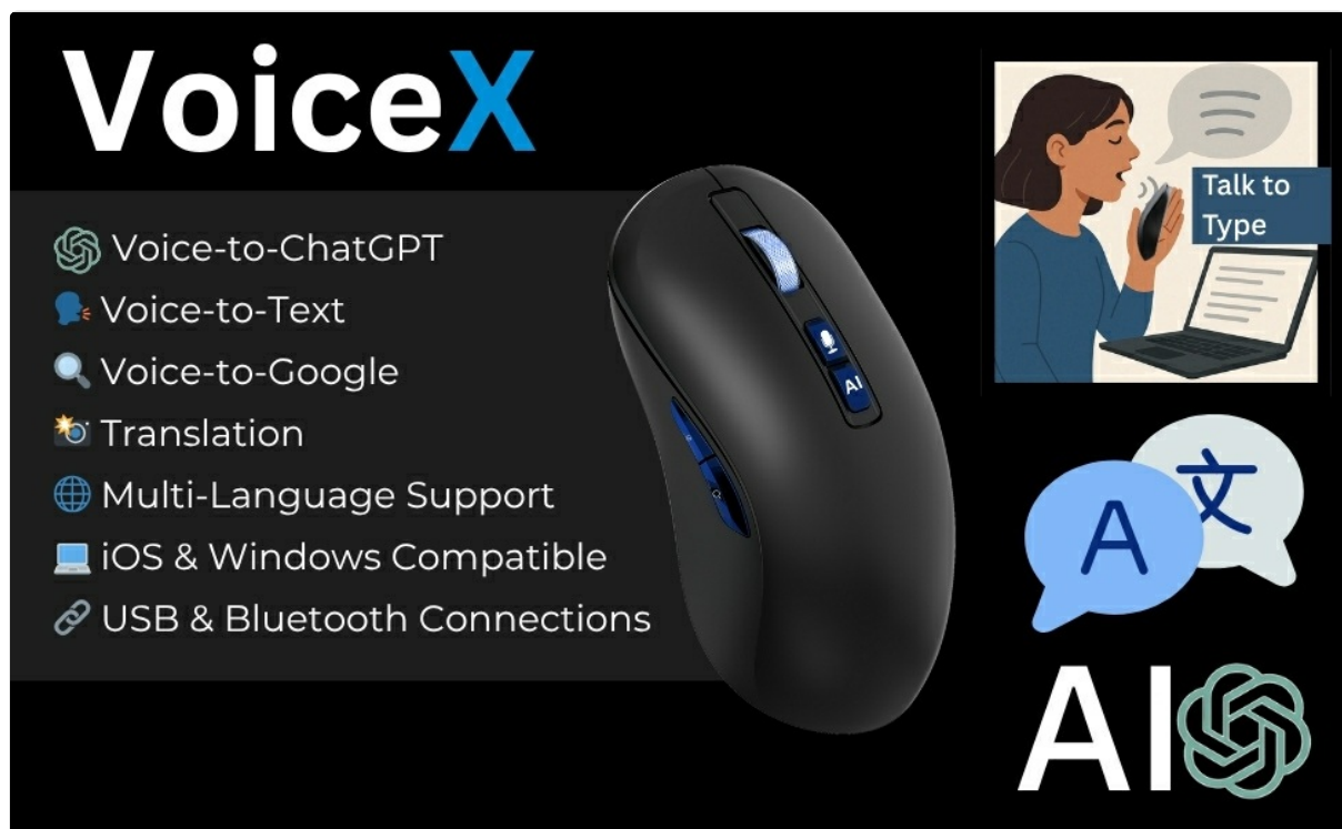
Figure 3: Diagram illustrating the VoiceX AI Mouse features including Voice-to-ChatGPT, Voice-to-Text, Voice-to-Google, Translation, Multi-Language Support, and compatibility.

The Azpen AI Wireless Mouse M191-Pro is equipped with several intelligent features to streamline your workflow.