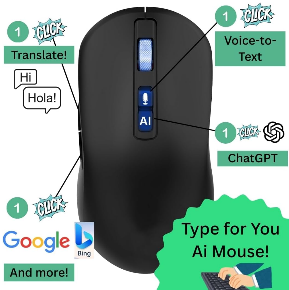
Figure 1: Front view of the Azpen AI Wireless Mouse M191-Pro.