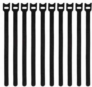
Hook-and-Loop Fastening Cable Ties (9-Inch x 1/2-Inch, 10-Pack)