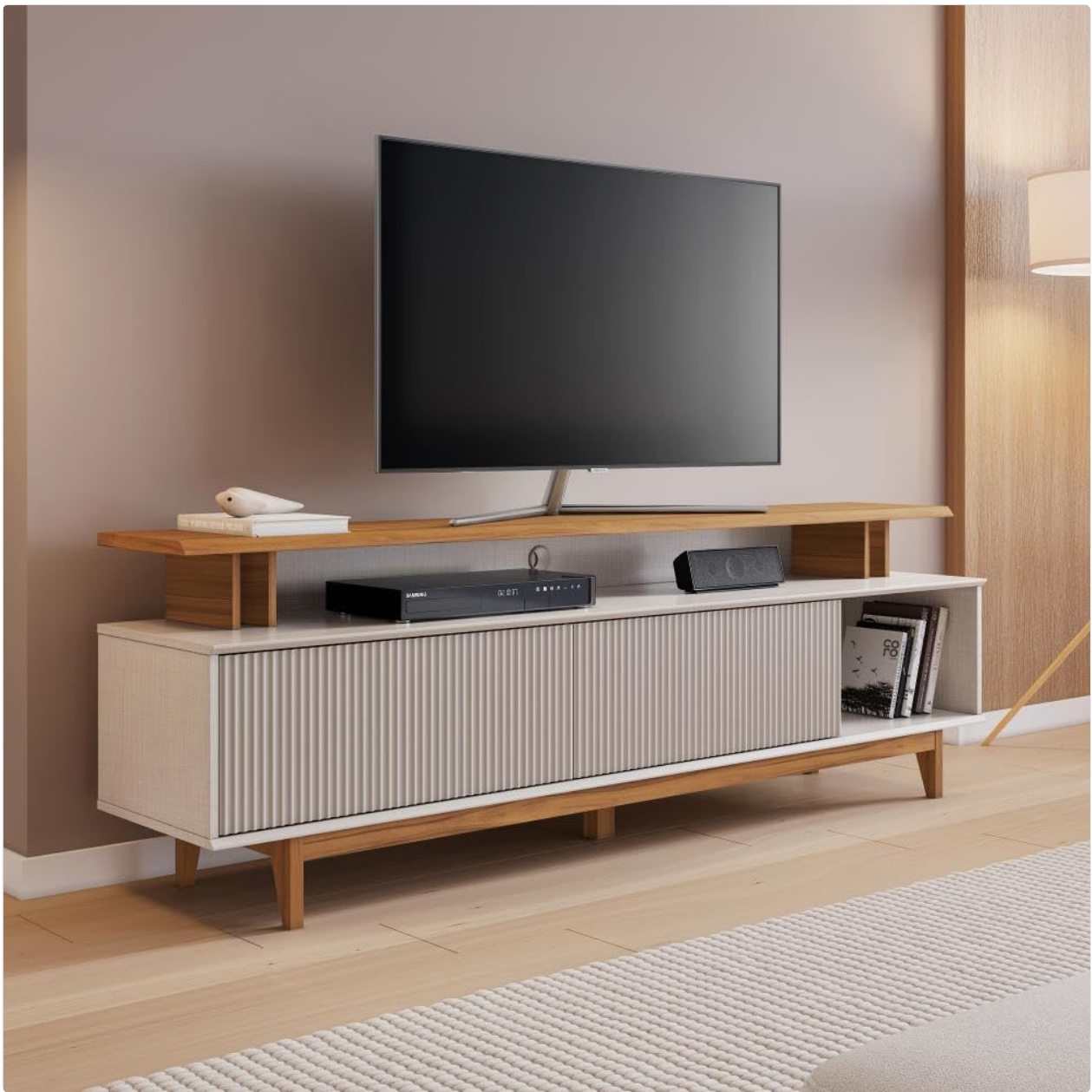
Image 5.1: The NT1385 TV Rack integrated into a living room environment, demonstrating its functional use.