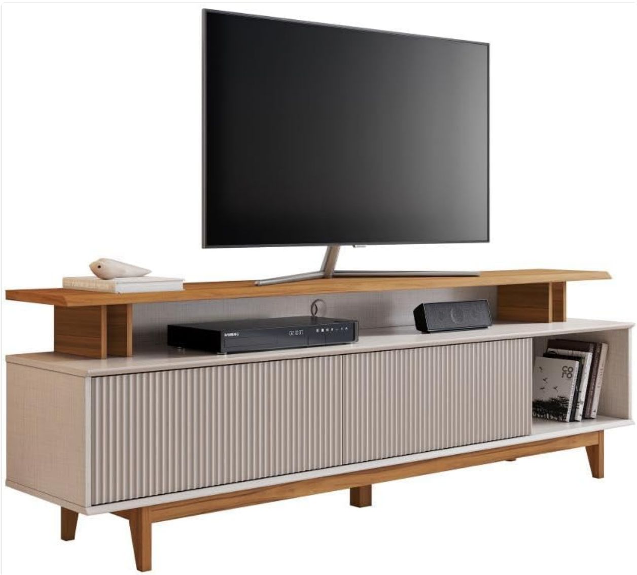
Image 1.1: The Notável Móveis NT1385 TV Rack, showcasing its design and capacity for a television.