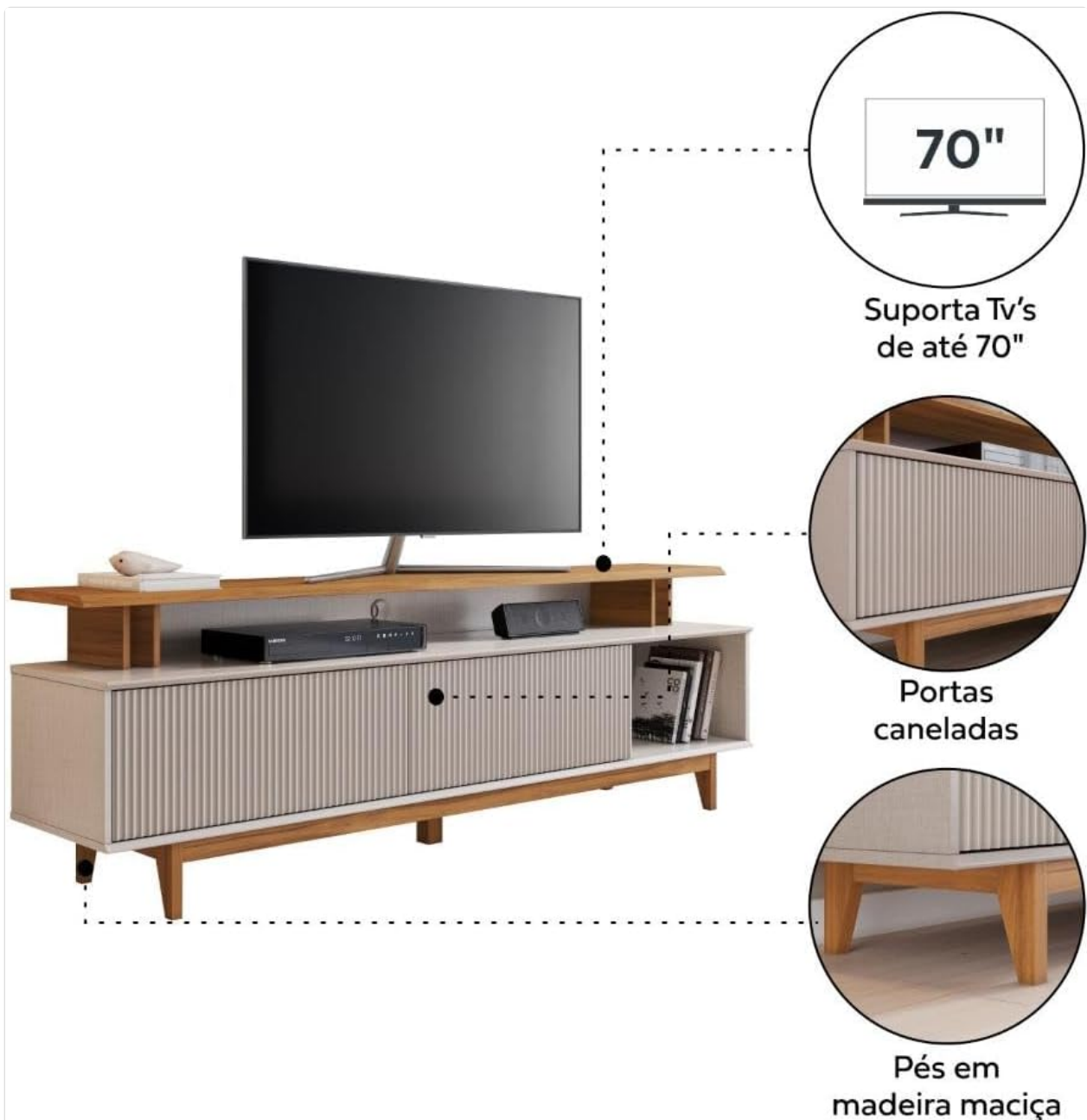
Image 4.1: Key features of the NT1385 TV Rack, including TV size compatibility, door style, and feet material.