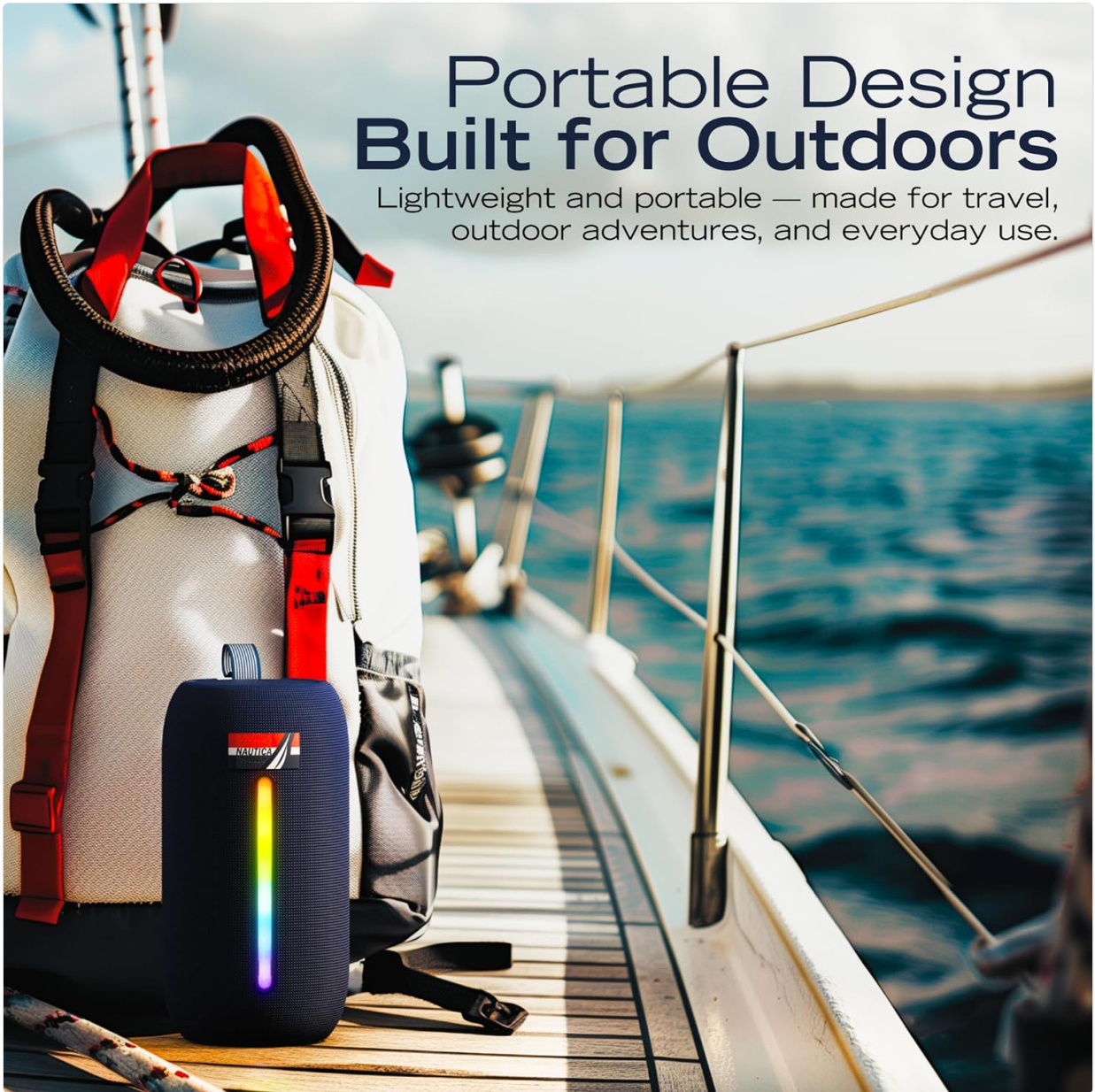
Image: The Nautica Urban SP600 speaker shown on a boat, emphasizing its portable design suitable for outdoor adventures.

Lightweight and portable — made for travel, outdoor adventures, and everyday use.