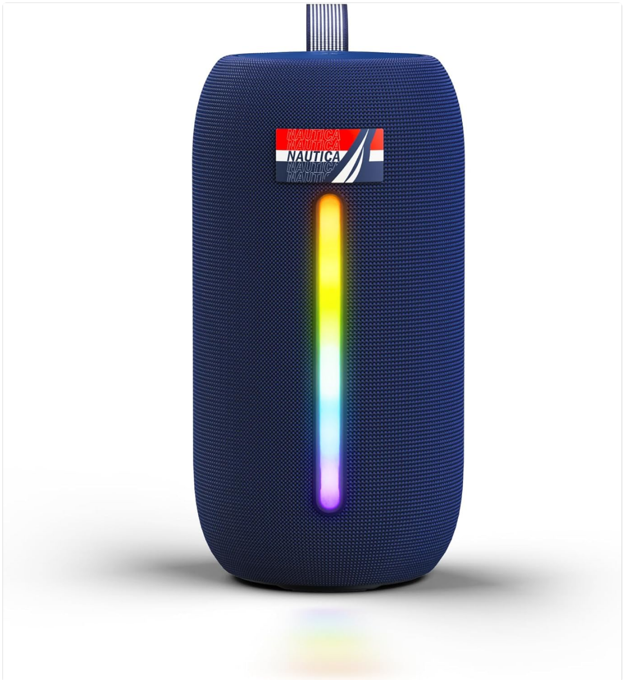
Image: The Nautica Urban SP600 speaker showcasing its illuminated ambient light bar, which can display various colors and patterns.