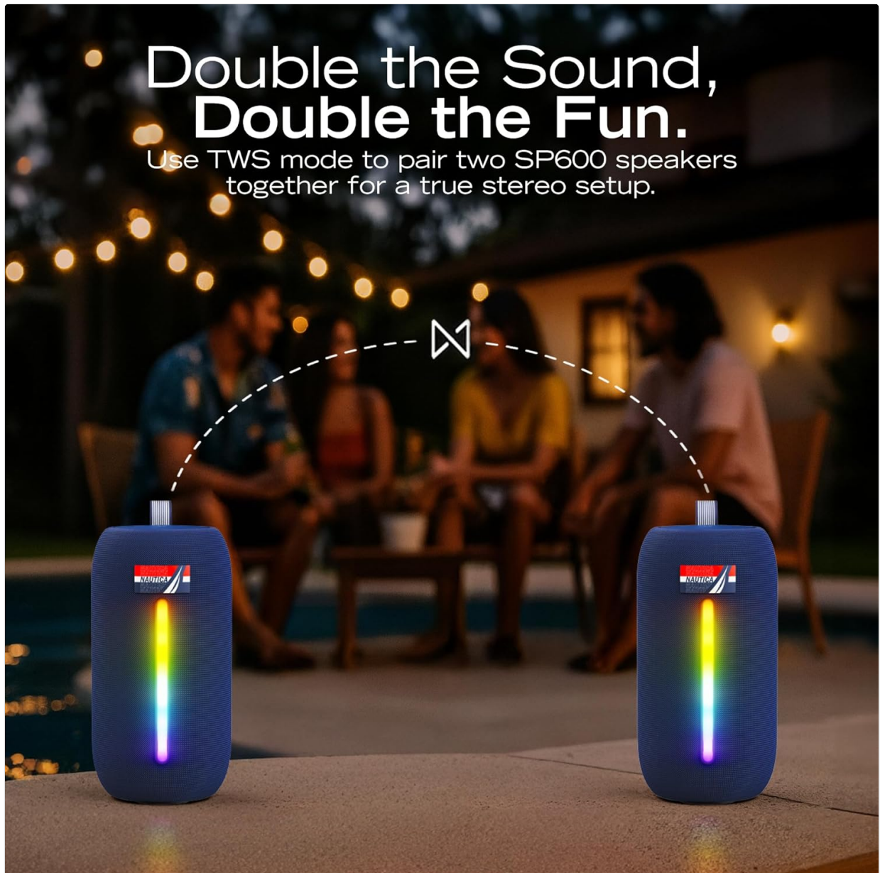
Image: Two Nautica Urban SP600 speakers positioned side-by-side, illustrating their True Wireless Stereo (TWS) pairing capability for a synchronized audio experience.