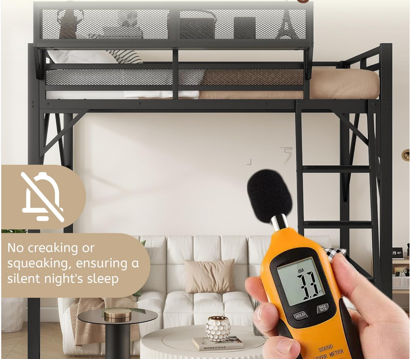
Image: Illustration of the bed's noise-free design, emphasizing a silent sleeping experience.