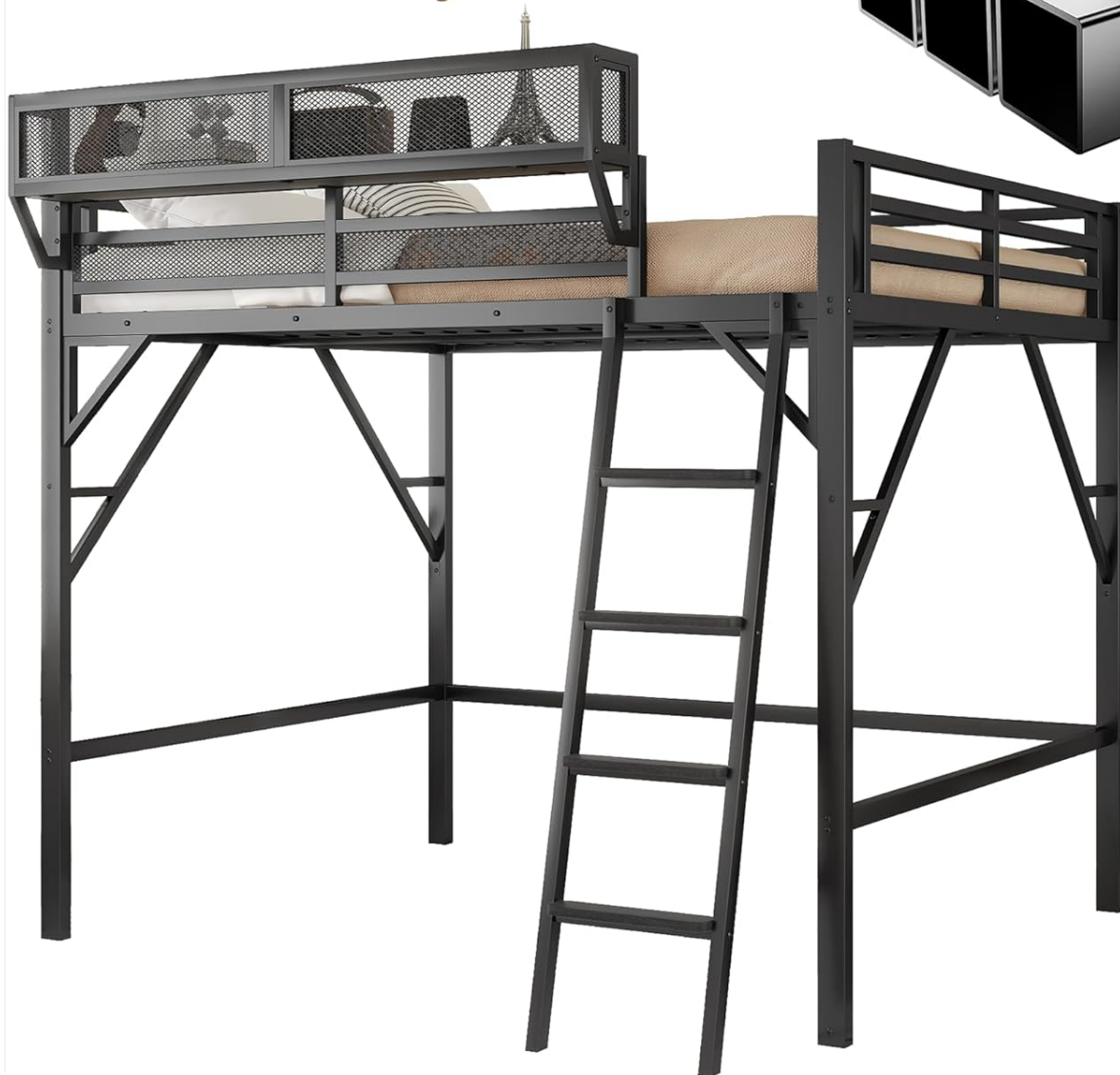
Image: Illustration of the heavy-duty steel construction, highlighting the durability provided by thickened tubes.