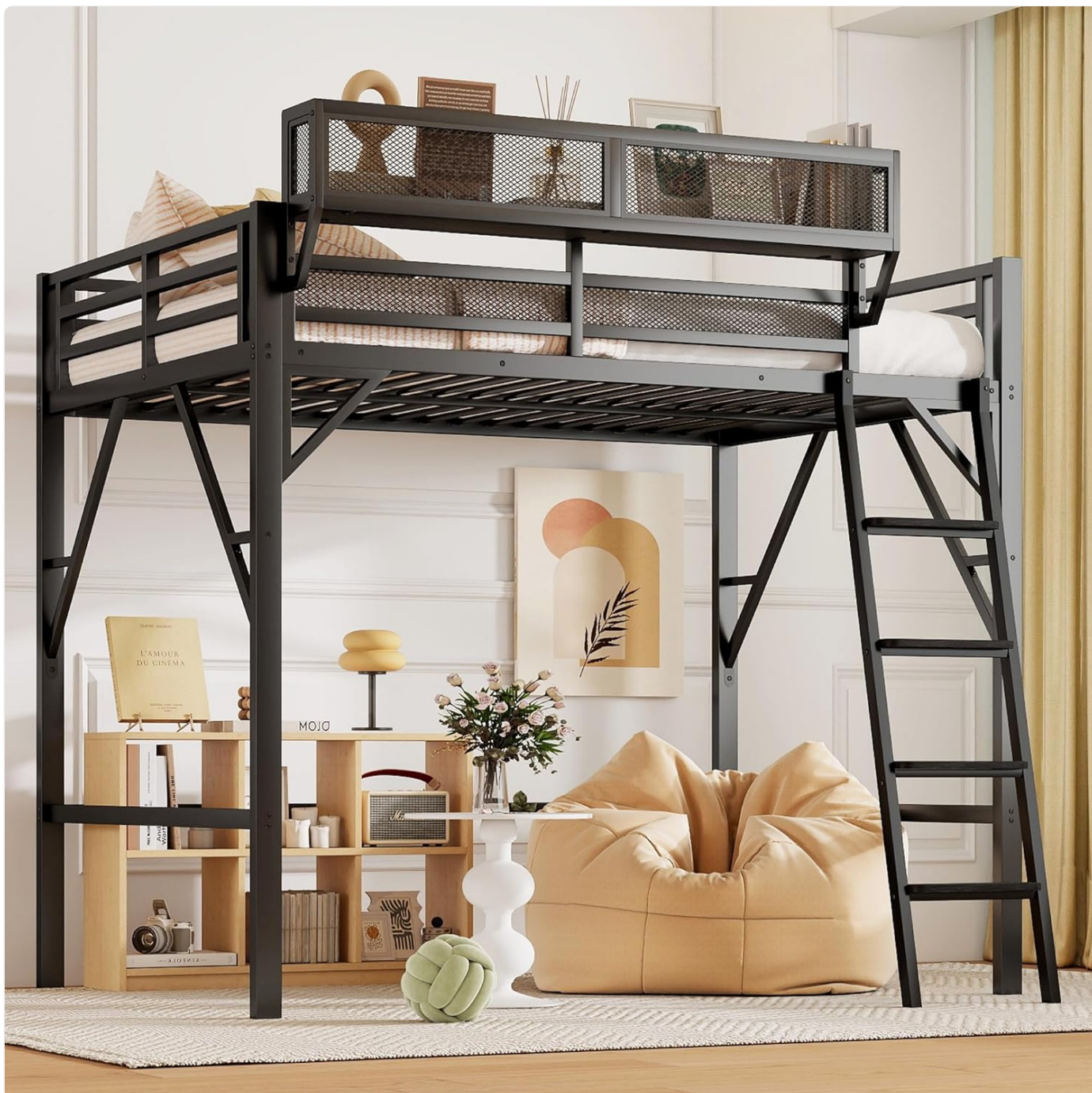
Image: The Mirightone Full Size Loft Bed, showcasing its design and the spacious area beneath, suitable for various furniture arrangements.