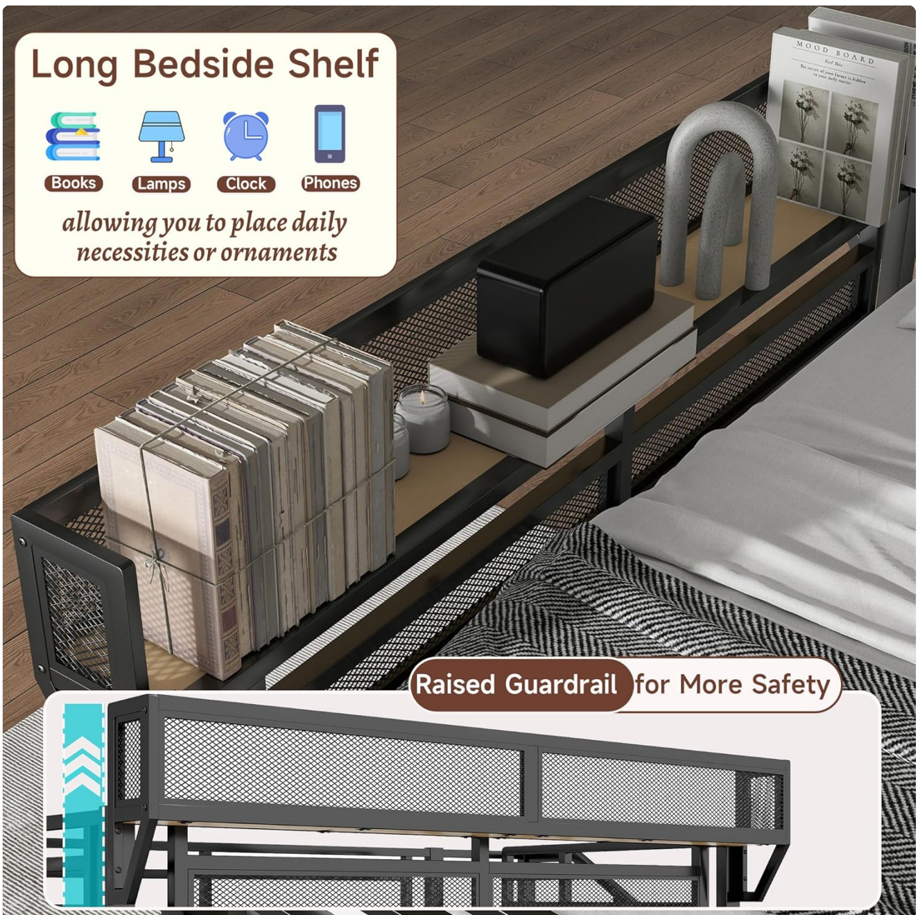
Image: Detail of the long bedside shelf, highlighting its utility for storing various items and its contribution to guardrail height.