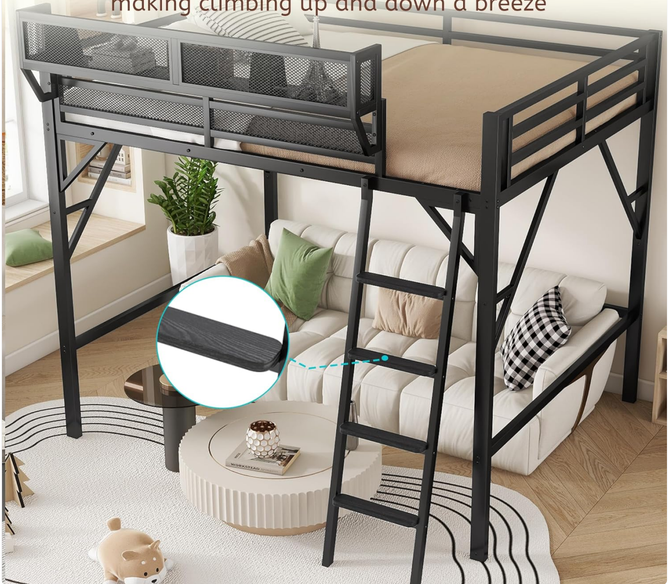
Image: The wide wooden ladder rungs, emphasizing comfort and stability during ascent and descent.

Every step feels comfortable and stable, making climbing up and down a breeze